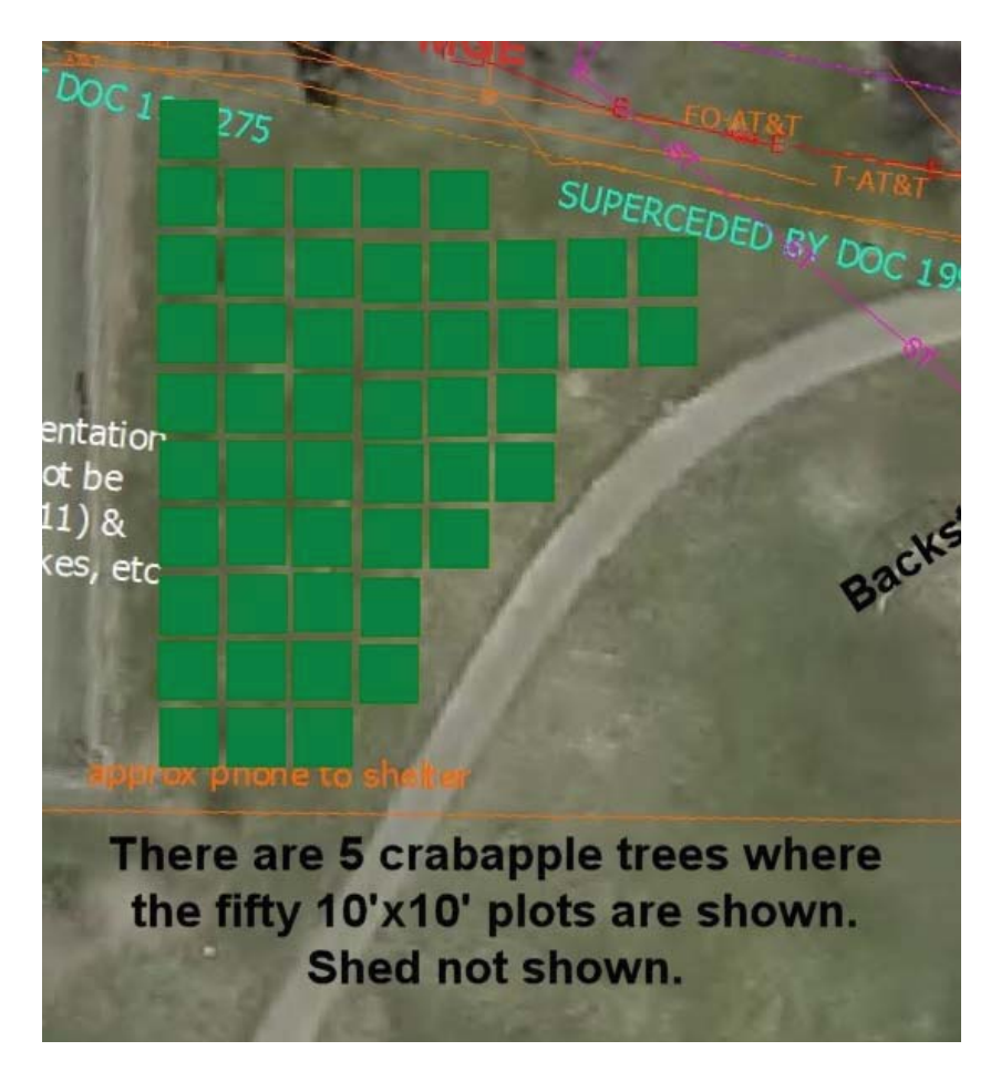
Option A: Near Tennis Courts

Garden Site near Tennis Courts – Attributes and Considerations: