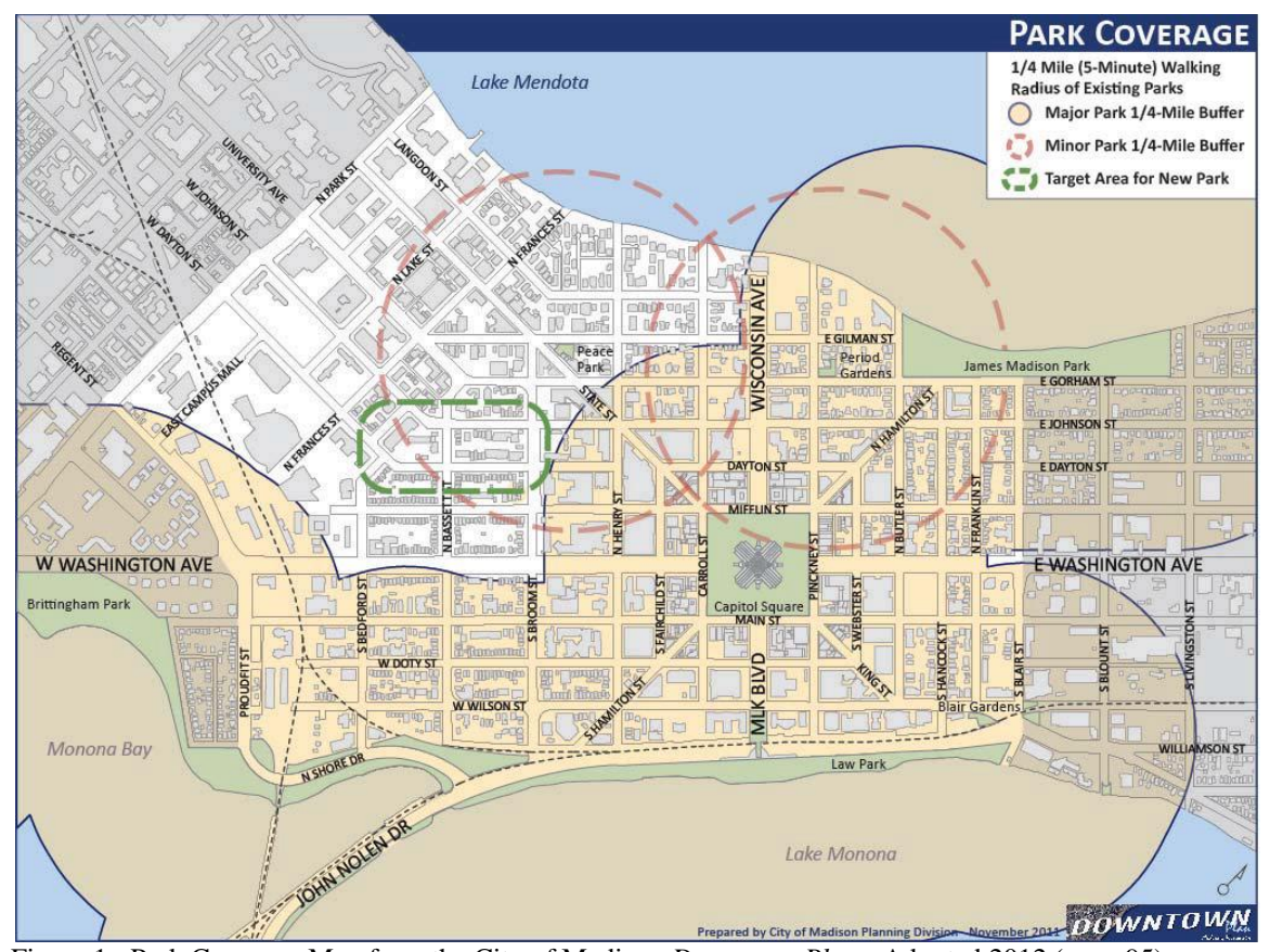
Figure 1: Park Coverage Map from the City of Madison Downtown Plan - Adopted 2012 (page 95)

and planned residential densities in this area, a target area for a new park was identified as being the most appropriate vicinity for establishing a new 1 ½ to 2 acre neighborhood park. Of note, since the Downtown Plan was adopted in 2012, there has been significant residential growth in the downtown area, particularly through the development of large apartment buildings. No new park land has been acquired to accommodate this massive residential growth, and areas for potential acquisition sites have been filled in by new development or will be redeveloped in the near future.