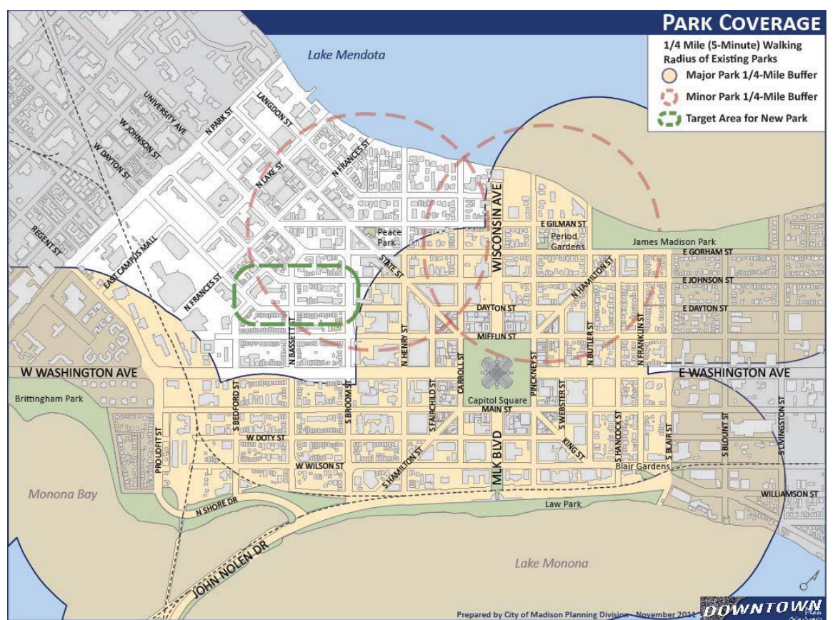
Figure 1: Park Coverage Map from the City of Madison Downtown Plan - Adopted 2012 (page 95)

and planned residential densities in this area, a target area for a new park was identified as being the most appropriate vicinity for establishing a new 1 ½ to 2 acre neighborhood park. Of note, since the Downtown Plan was adopted in 2012, there has been significant residential growth in the downtown area, particularly through the development of large apartment buildings. No new park land has been acquired to accommodate this massive residential growth, and areas for potential acquisition sites have been filled in by new development or will be redeveloped in the near future.