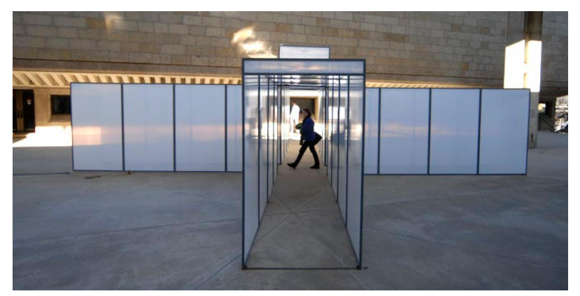
Bluethrough, By Chele Isaac