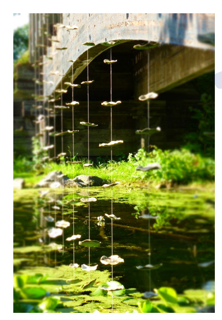
"Rain" by Nadia Niggli. A series of 12 rain chains of shallow bowls that visually echo the lilypads. The artwork hung from bridge posts in Vilas Park to draw people's attention to the beauty of the landscape and invite them to reflect on the watershed.