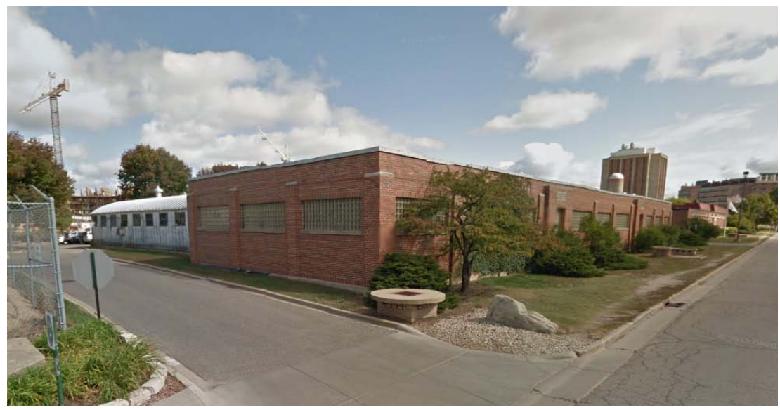
Google street view

Campus Institutional Building constructed in 1955.