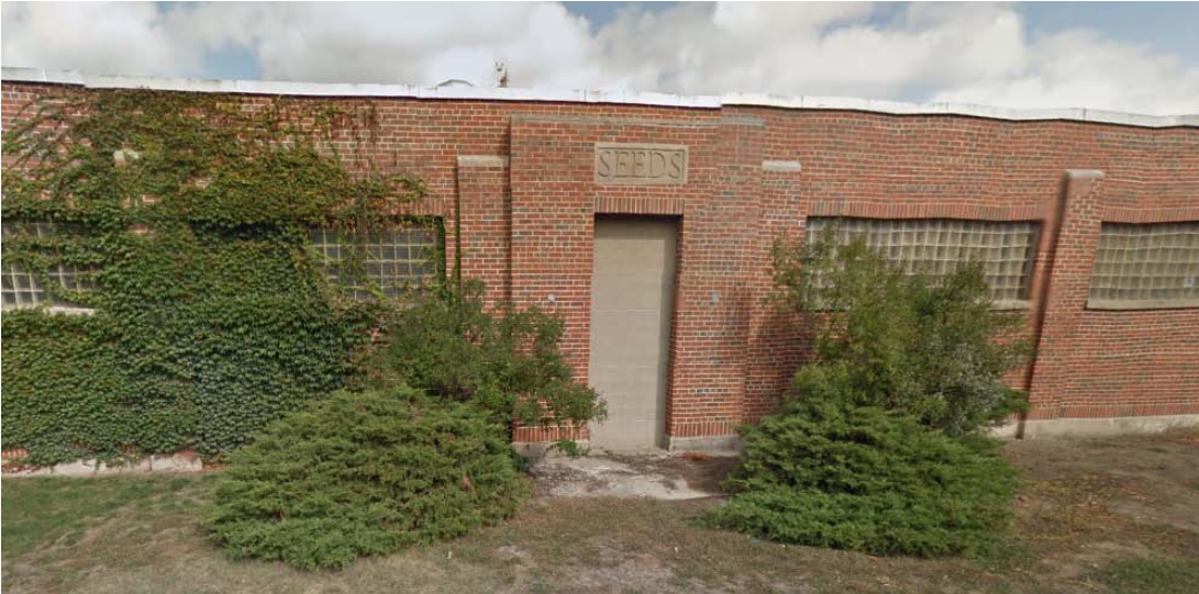
Google street view