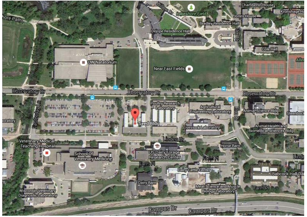
Google aerial view

Legistar File ID # 36427 Demolition Report August 17, 2015 Page 3 of 3