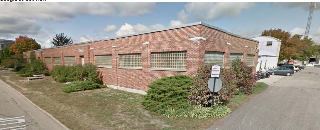
Google street view