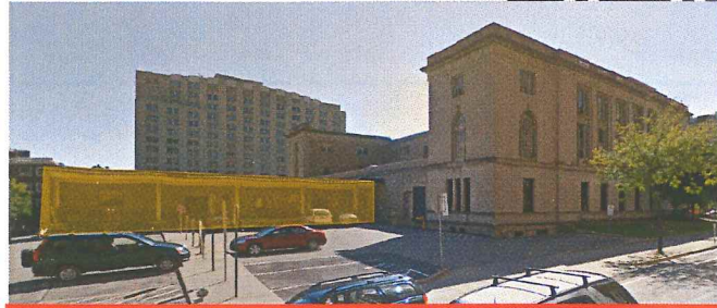
PHOTO 1 - VIEW OF REAR OF MMB FROM DOTY/PINCKNEY VICINITY. ANNEX HIGHLIGHTED IN ORANGE.