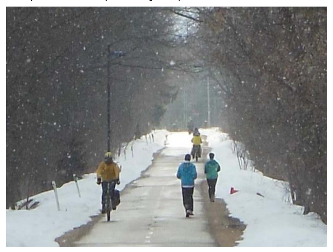
Figure 4: This is a photograph of the existing Southwest Path. The Tenney Park path will be widened from 8-feet to 10-feet to increase comfort and to make the path more stable for use by maintenance vehicles. Two light poles, like those shown in the photo are proposed to illuminate a dark section of the path between Dickinson Street and Marston Avenue.