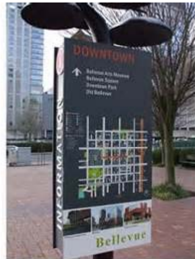
Information kiosks, like those found in downtown Bellevue, could be used to improve wayfinding in the Crossroads neighborhood.