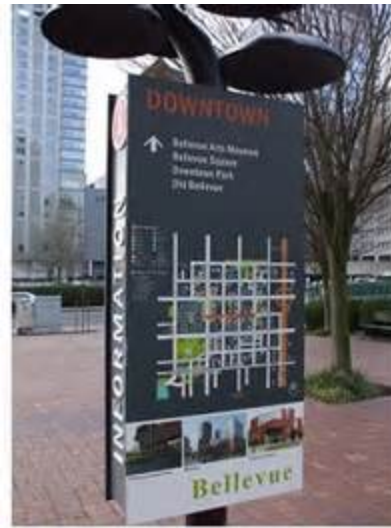
Information kiosks, like those found in downtown Bellevue, could be used to improve wayfinding in the Crossroads neighborhood.