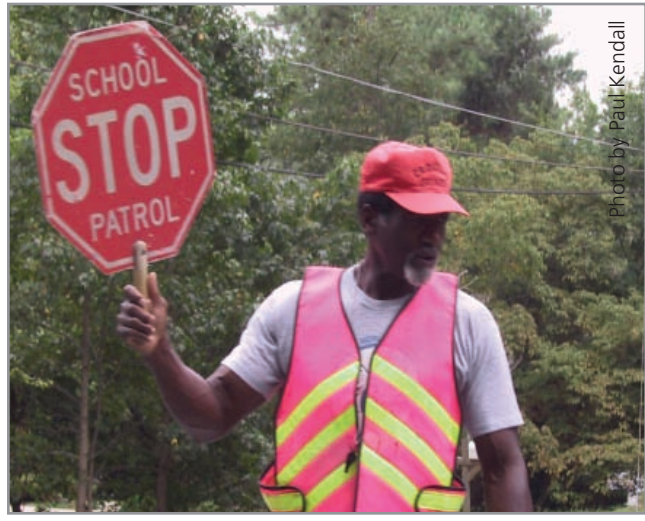
Estes Hills Elementary School, Chapel Hill, NC

The State of North Carolina strongly recommends the use of hand-held signs or STOP paddles, but allows the local governing agency to decide whether a guard uses either a STOP paddle or an orange-gloved hand, or both.