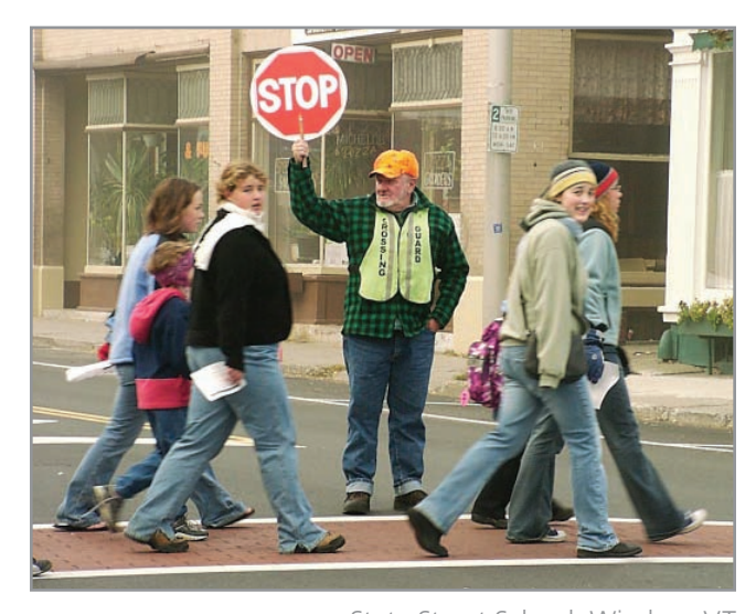
State Street School, Windsor, VT

In every situation, a guard uses the proper search pattern for crossing a street and encourages student pedestrians to follow these safety steps. This pattern is: