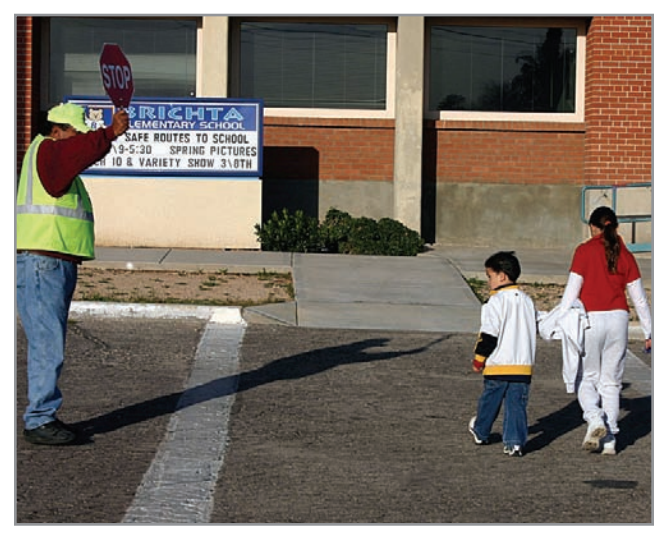
Brichta Elementary School, Tucson, AZ