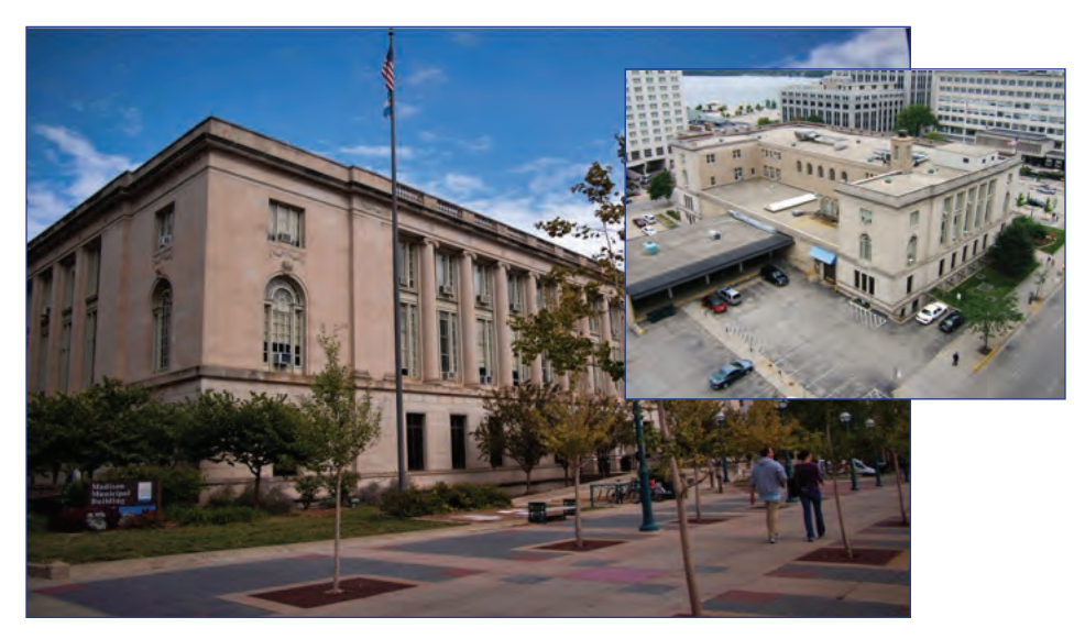
Madison Municipal Building (2012)

This two-block area within the city has a rich and long history. In 1909 John Nolen created the Lake Monona Approach, a plan to tie the new Wisconsin State Capitol to Lake Monona by way of a Capital Mall lined by significant buildings. Later, in 1929 the Federal government built the United States Courthouse and Post Office on the east side of the mall between Doty Street and Wilson Street as the first of a series of civic buildings.