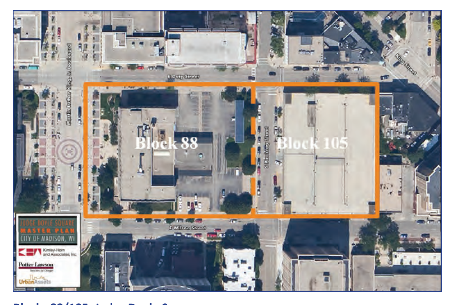
Blocks 88/105: Judge Doyle Square

It is within this context that the City of Madison is pursuing an exciting new development opportunity known as Judge Doyle Square in the heart of the city's central business district.