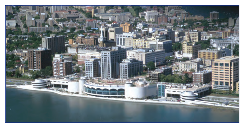
Monona Terrace Community and Convention Center

The Judge Doyle Square (JDS) site is bounded by Martin Luther King, Jr. Boulevard on the west, Doty Street on the north, Wilson Street on the south and on the east by a group of buildings that front mainly on King Street. See figure page 5. Pinckney Street runs through the site and defines Block 88 from Block 105. The eastern portion of Block 88, which is currently a surface parking lot for the MMB and the GE garage on Block 105 are currently identified in the Madison Downtown Plan (2012) as potential redevelopment and infill sites.