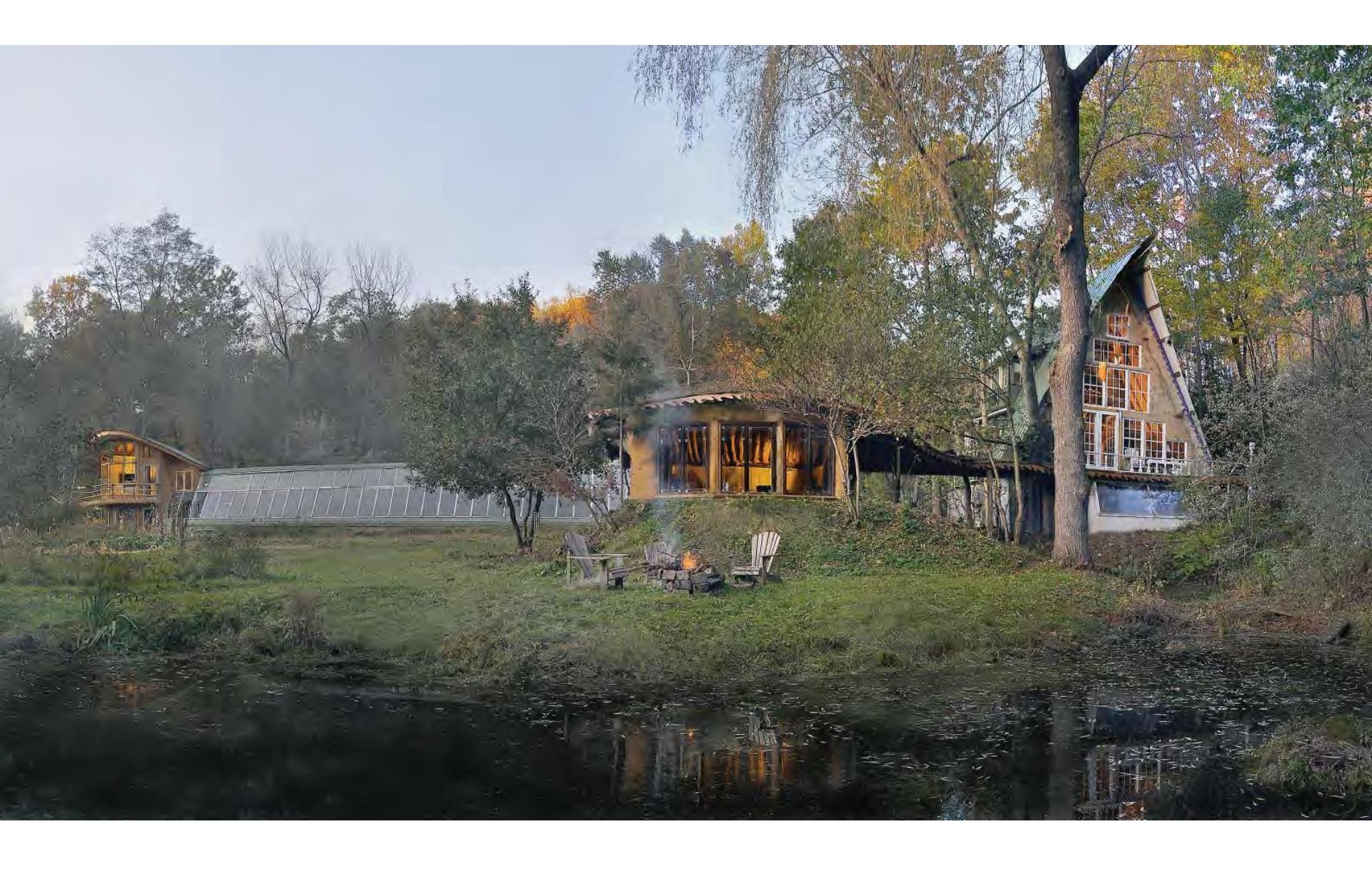
Driftless Forest 134 acres of sustainable managed forest