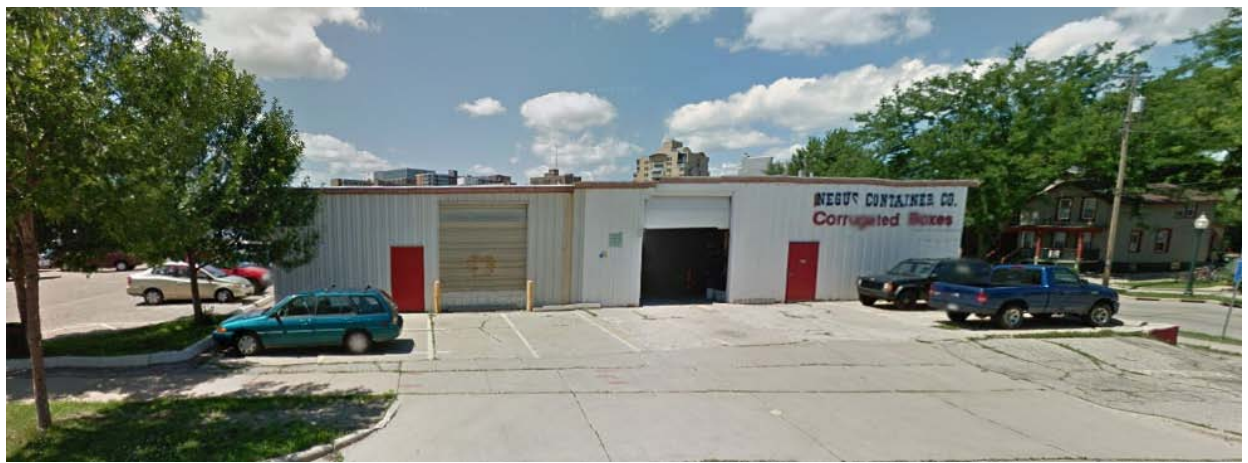
Google street view