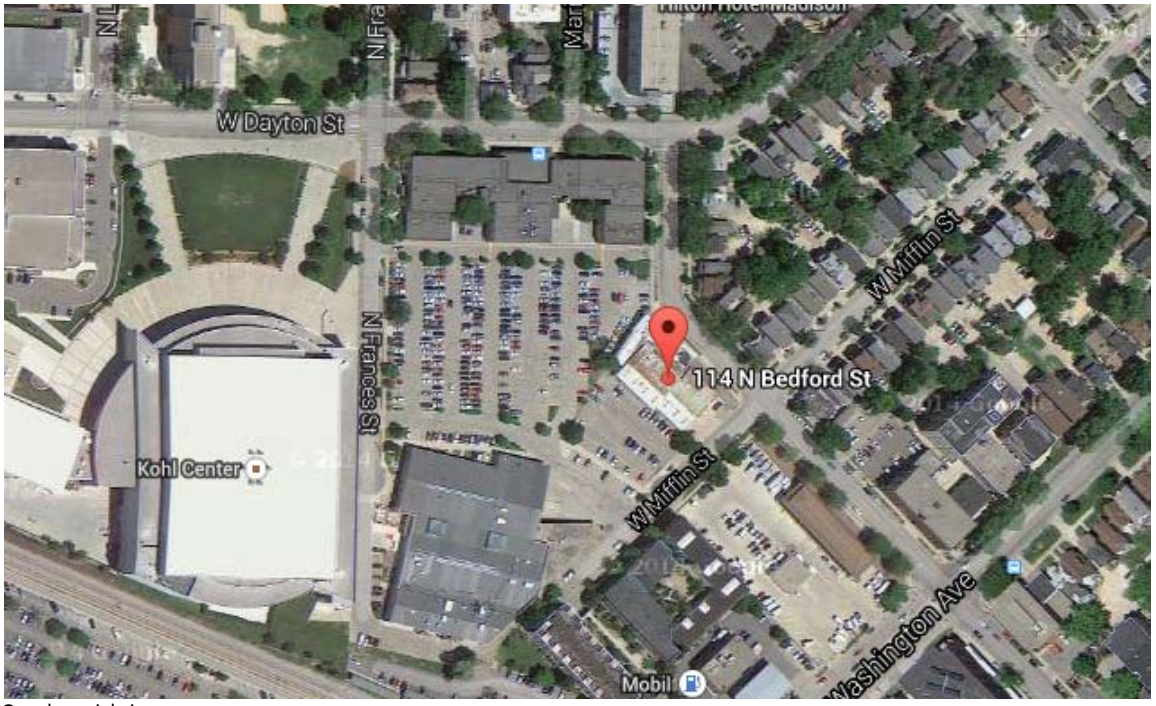
Google aerial view

Industrial building. Date of construction unknown.