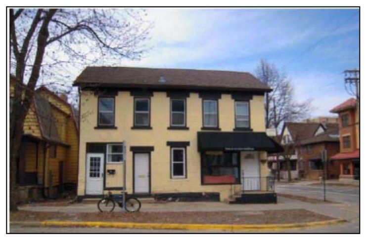
Figure 1: 502 West Main St.

Planning Division staff identified the Proudfit Open Space, particularly 129 Proudfit Street, as a potential city-owned site nearby which could physically accommodate the relocated building. The) 72 by 55-foot (nearly 4,000 square foot parcel at the northeast corner of Proudfit Street and Findorff Court is across Findorff Court from the larger Proudfit Open Space property, in front of the Tobacco Warehouses, adjacent to two homes to the southeast, and faces homes of similar size across Proudfit Street to the southwest.