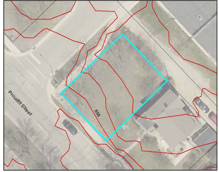
Figure 2: 129 Proudfit St.