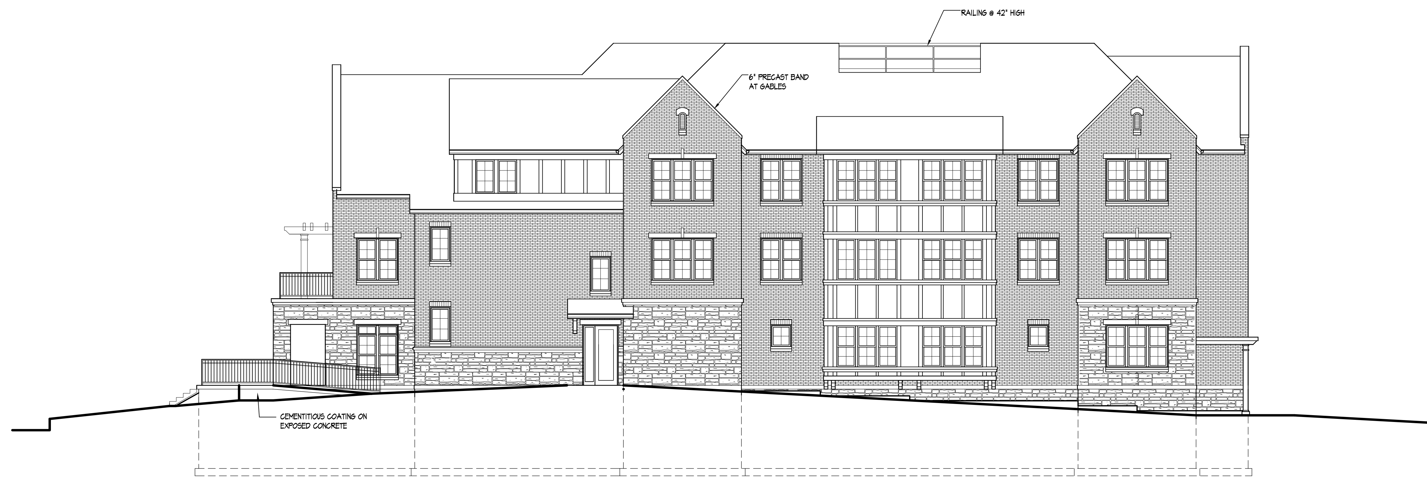
NORTH (SIDE) ELEVATION 1/8" = 1'-0"