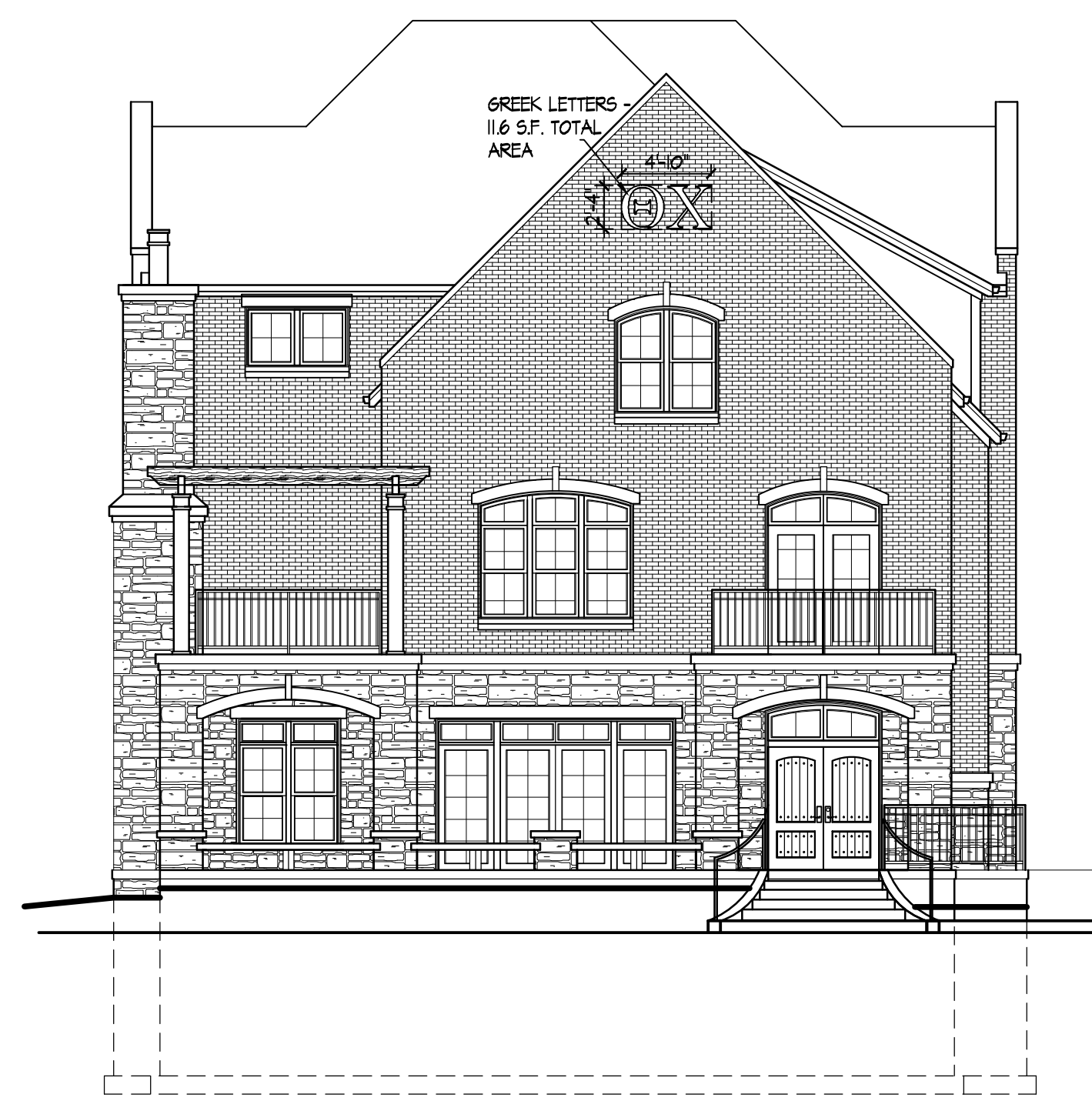
LANGDON ST. ELEVATION 1/8" = 1'-0"