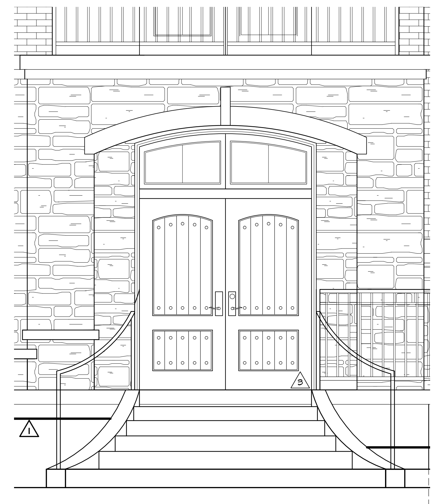
LANGDON ST. ELEVATION - DETAIL 1/2" = 1'-0"