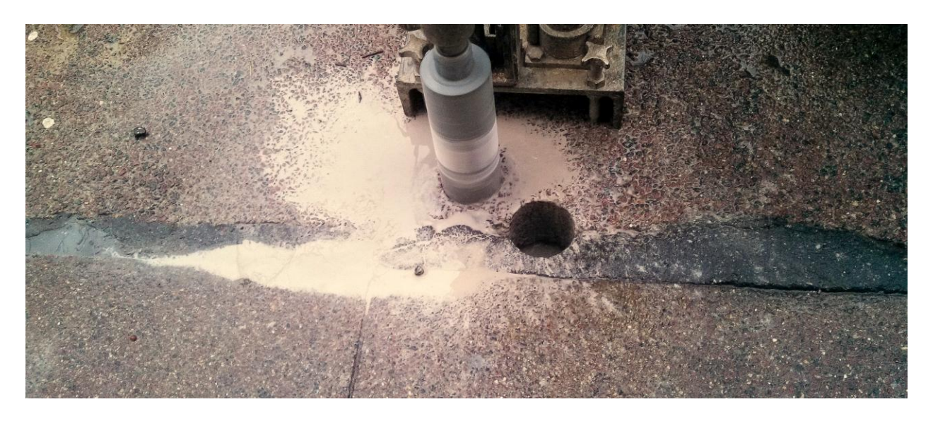
Figure 4. The location of cores showing the deterioration and which were subjected to laboratory testing.