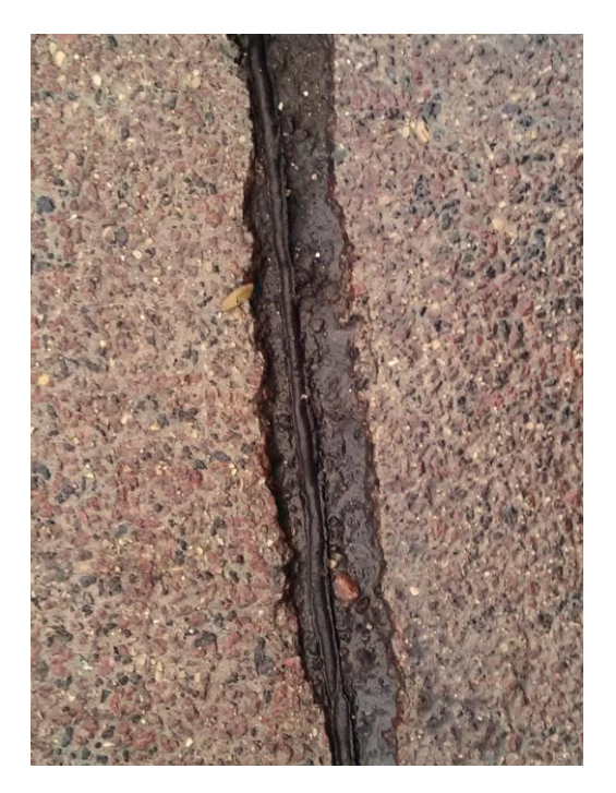
Figure 3. Cracking, spalling and raveling along joints