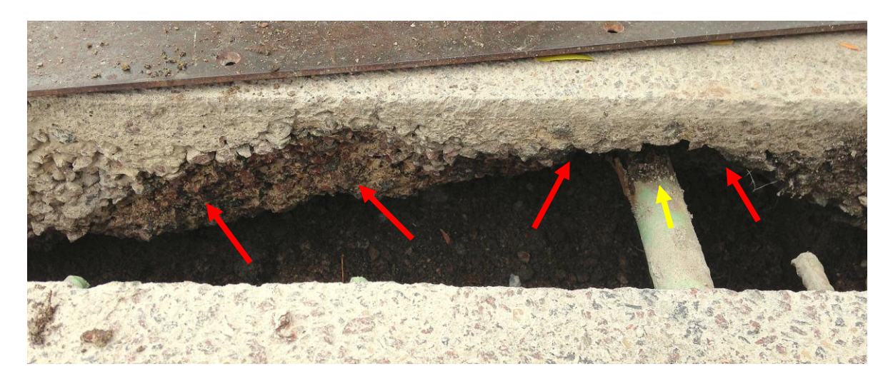
Figure 2. Oblique view of the slab showing deterioration of the slab bottom (red arrows) and corrosion of a dowel bar (yellow arrow).

Sometime this past Fall, it was determined that along joints the slabs were deteriorating from the bottom upward (Figure 2). The deterioration is in the form of bottom of the slab cracking and spalling (Figure 2) and joint surface cracking and spalling (Figure 3). The City of Madison contracted CGC, Inc. to take cores of various slabs for testing to determine the cause(s) and extent of the deterioration.