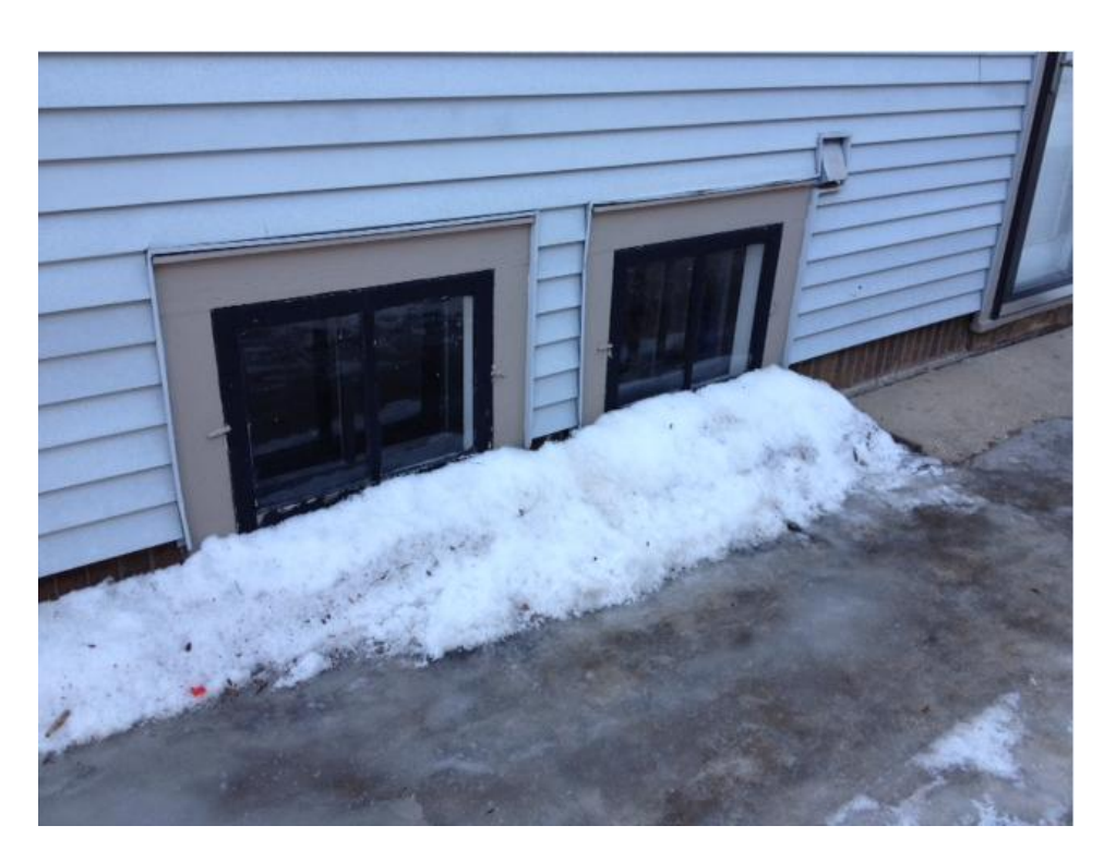
11. Left Side Basement Windows - replace with matching Andersen windows