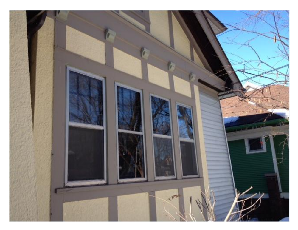
7. 1<sup>st</sup> Floor Front Windows - replace with matching Renewal by Andersen