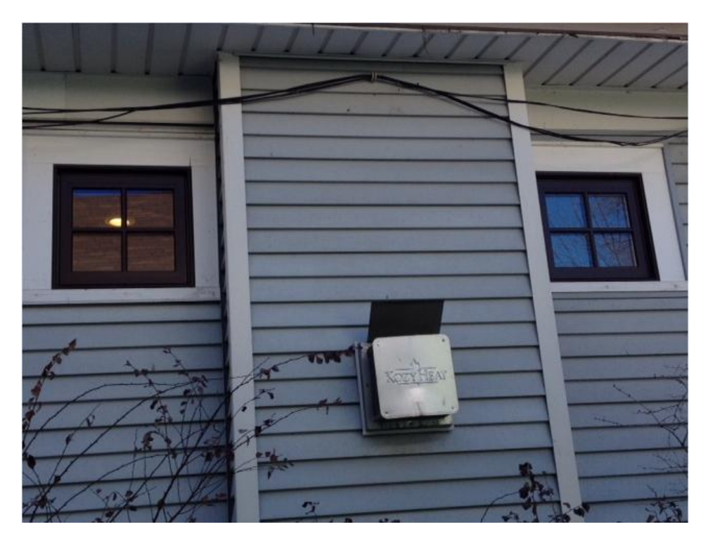
19. 1<sup>st</sup> Floor Right Side Kitchen – maintain existing Marvin replacement windows; paint gas fireplace vent cover to match color of siding; replace siding with L.P. Smart Side 3" profile lap siding; replace aluminum soffit with wood beadboard soffit