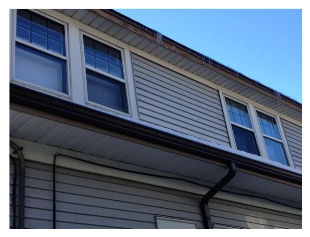
18. 2<sup>nd</sup> Floor Right Side - replace with matching Renewal by Andersen windows; replace siding with L.P. Smart Side 3" profile lap siding; replace aluminum soffit with wood beadboard soffit

17. 1<sup>st</sup> Floor Right Side Windows – replace first two large (bedroom) windows with Renewal by Andersen cottage style 2:3 ratio with full divided light colonial grill; replace third large (bathroom) window with Renewal by Andersen picture window with beaded privacy glass.