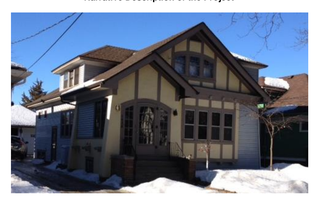
Marquette Bungalows 1438 Rutledge Street