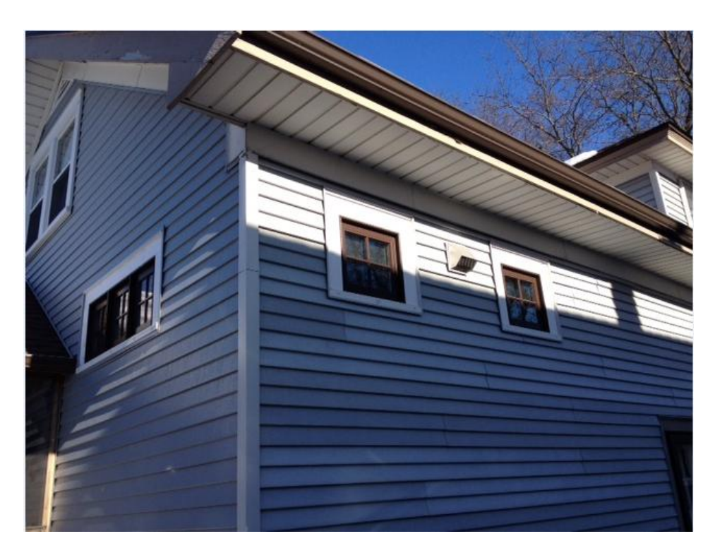
12. 1<sup>st</sup> Floor Kitchen Windows – maintain existing Marvin replacement windows; replace siding with L.P. Smart Side 3" profile lap siding; replace aluminum soffit with wood beadboard soffit