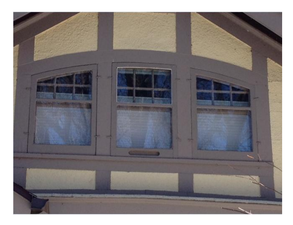
6. 2nd Floor Front Windows – replace with matching curved Andersen windows