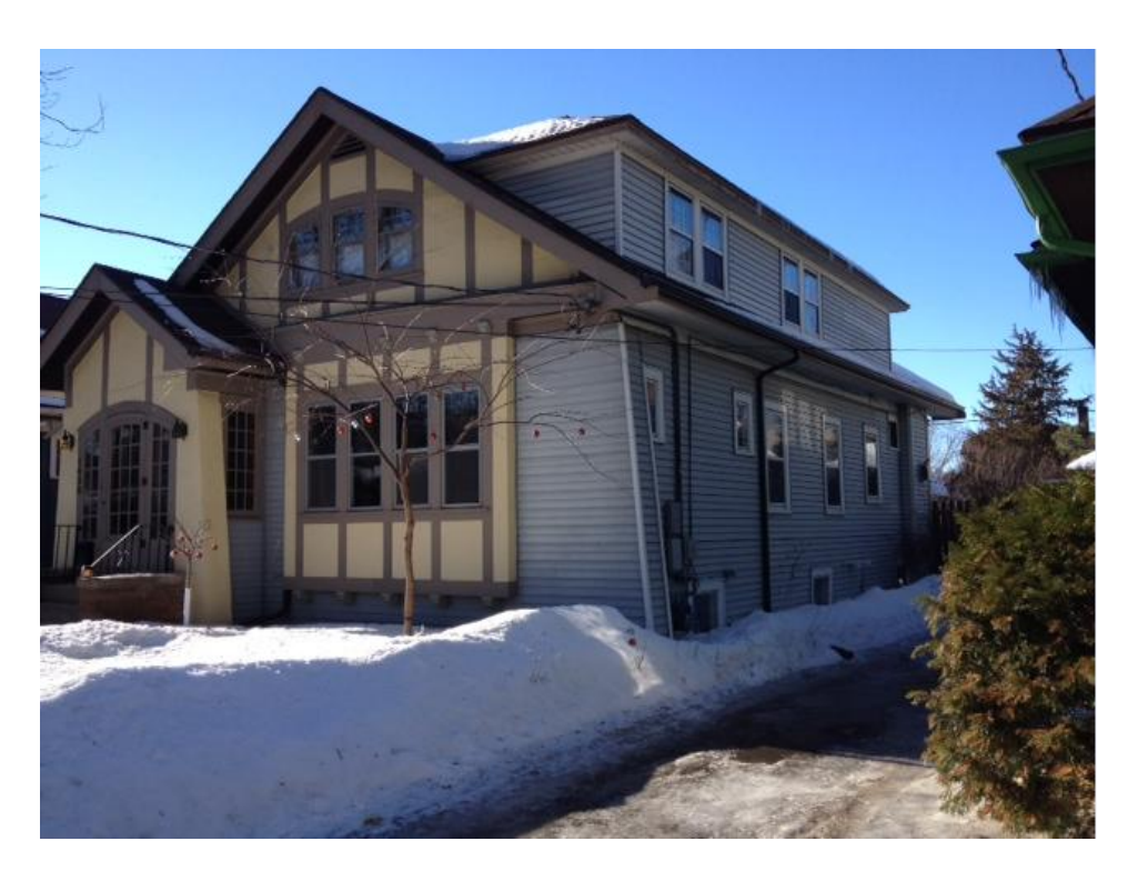
2. Front of home from right angle