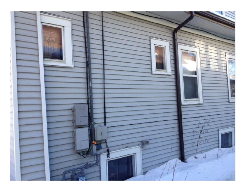
16. 1<sup>st</sup> Floor Right Side Windows - replace with matching Renewal by Andersen