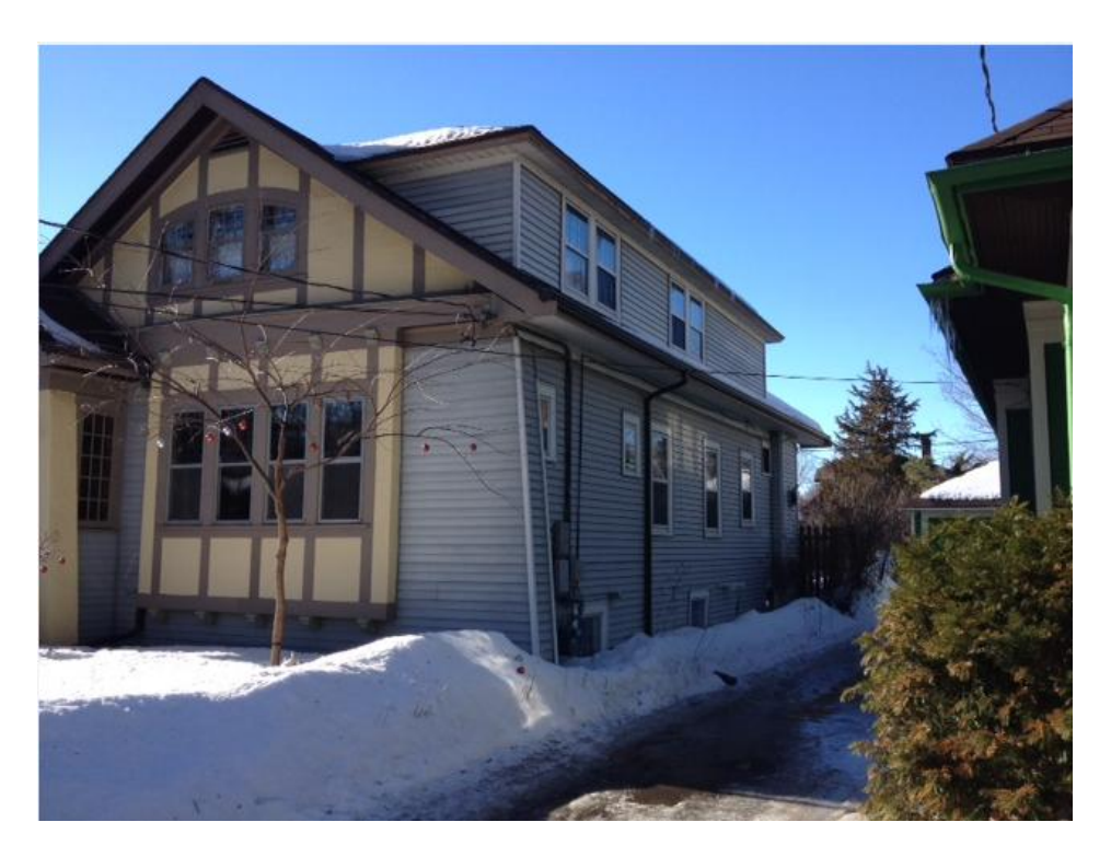
15. Right Side of Home – windows, siding and soffit