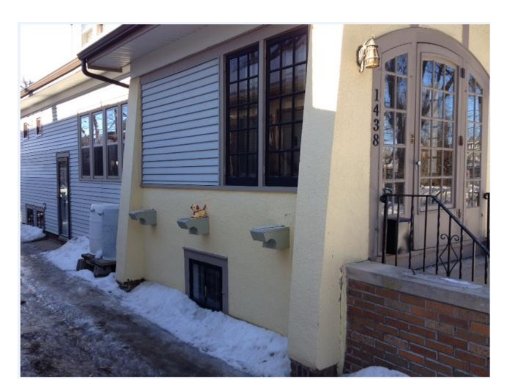
8. 1<sup>st</sup> Floor Side Vestibule Windows - replace with matching Renewal by Andersen