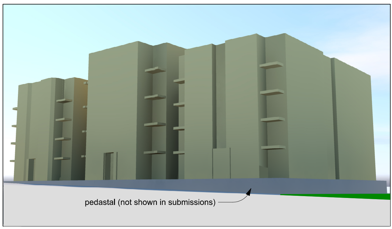
Front Perspective - Sun: Mar 21,, 11 AM DST (5th Floor Set Back)