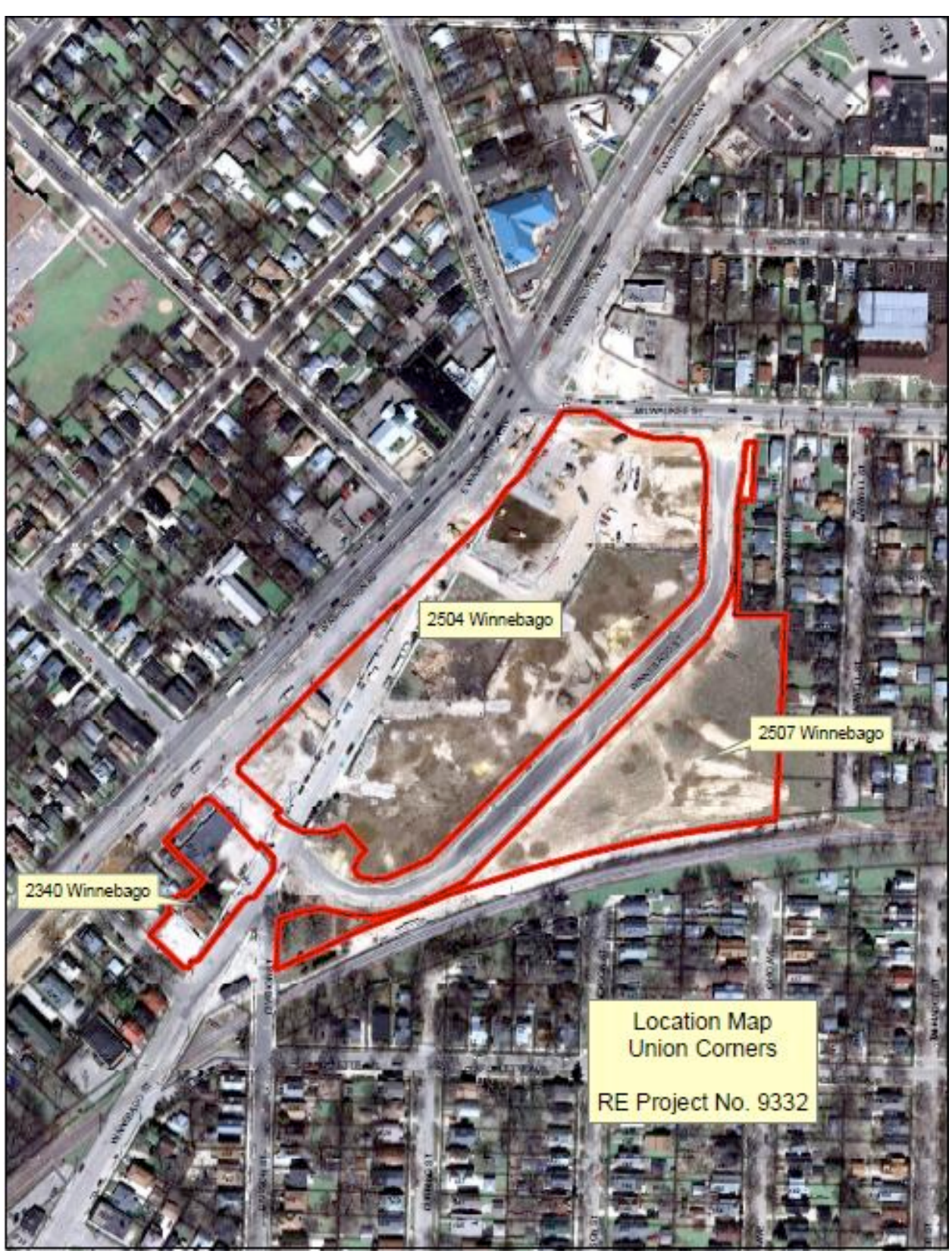
The Sites are essentially comprised of three individual parcels as depicted above. The City would prefer a proposal for a master developer for all three parcels. However, the City will also accept