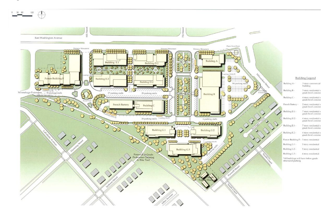
Page 7 of 13

The McGrath plan for the Sites included a series of buildings of a variety of densities and was expected to include 450 residential units and over 100,000 square feet of commercial space. The plan anticipated providing 938 parking spaces through a combination of surface, street, and structured parking. Developers are free to propose new plans for the site, but we the City hopes to achieve a comparable level of density. To achieve this density, the City anticipates the need for structured parking to be incorporated into or adjacent to buildings. The City may provide financial assistance, through TIF or other means, for the construction of structured parking on the Sites. The City will also consider financial assistance for shared parking structures between multiple redevelopment projects when such parking facilities are more financially feasible than single-use facilities for individual redevelopments projects.