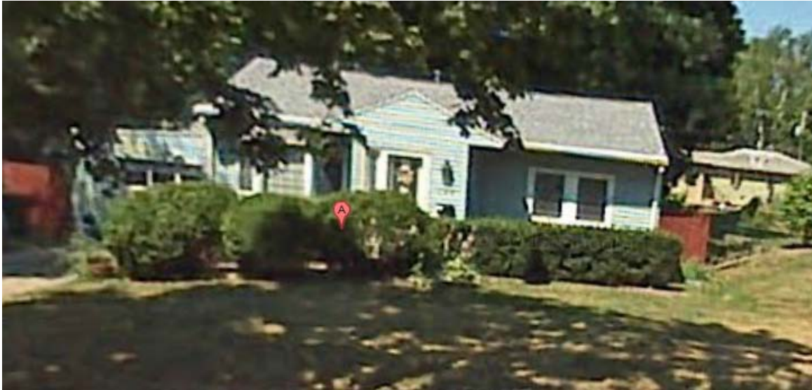
Google street view

Single family residence constructed in 1948.