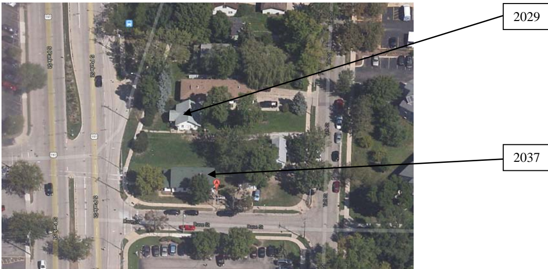
Google aerial view

Single family residences, constructed in 1925 and 1929.