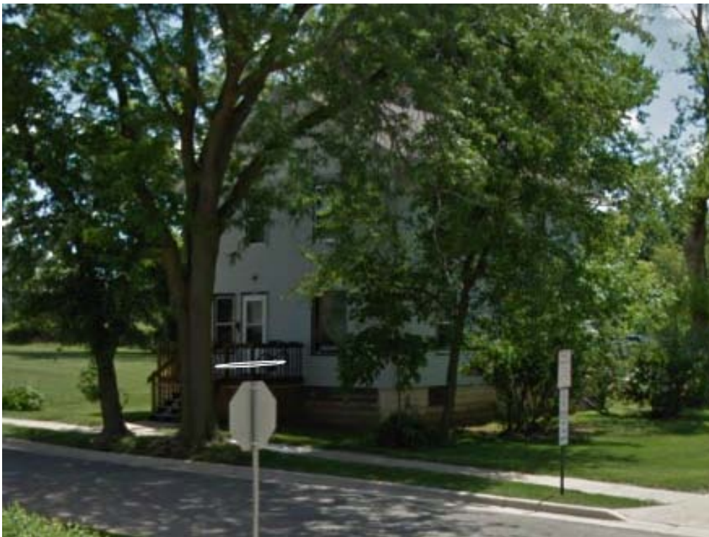
Google street view image