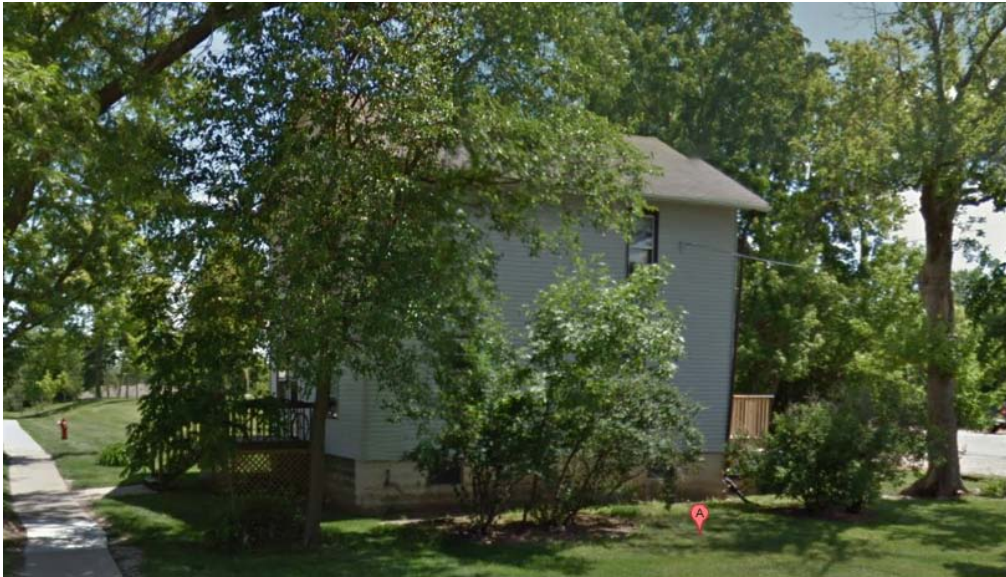
Google street view image