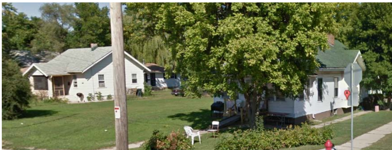
Google street view