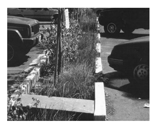
Figures I16: Interior Parking Lot Landscaping Example.

grasses, and shall be installed along building facades, except where building facades directly abut the sidewalk (a zero setback). The Zoning Administrator may modify this requirement for development existing prior to the effective date of this ordinance, as long as improvements achieve an equivalent or greater level of landscaping for the site.