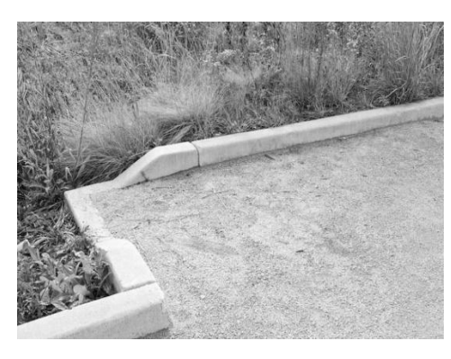
Figure I15: Interior Parking Lot Landscaping Example.

Foundation plantings shall be installed along building facades, except where building facades directly abut the sidewalk, plaza, or other hardscape features. Foundation plantings shall consist primarily of shrubs, perennials, and native