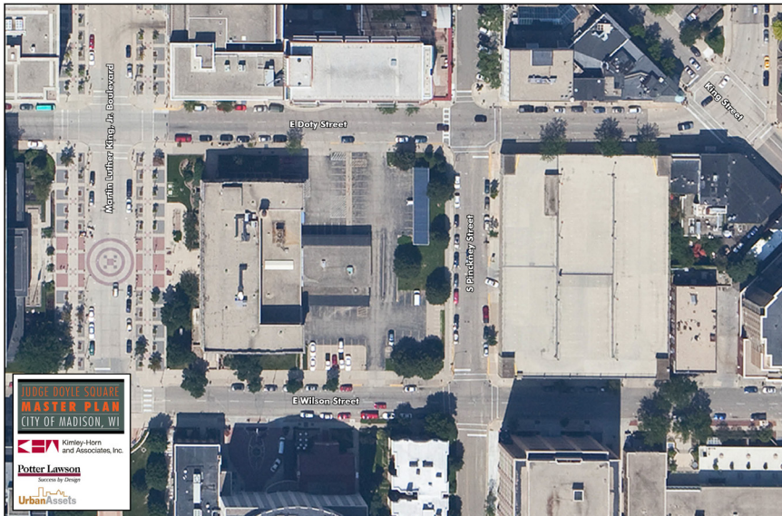
Blocks 88/105: Judge Doyle Square

Developer shall post notices in an accessible format to applicants, beneficiaries, and other persons, describing the applicable provisions of Sec. 39.05 of the Madison General Ordinances, in the manner prescribed by section 711 of the Civil Rights Act of 1964 (42 USCA Sec 2000e-10).