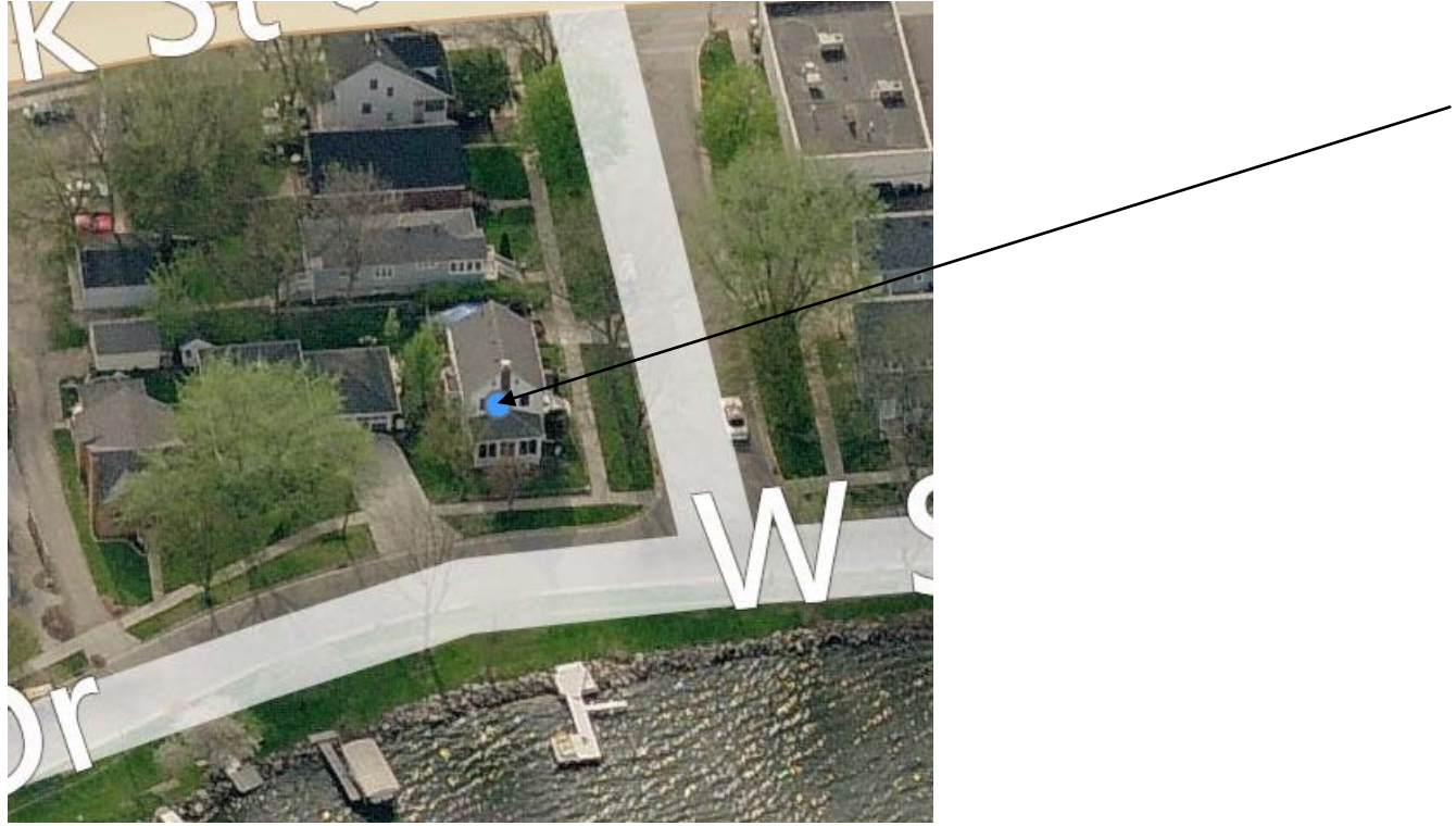
Bing aerial view image

Single family residence (TR-C2) constructed in 1923.