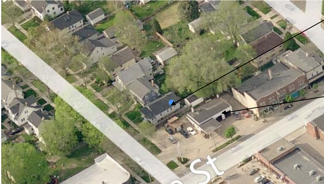
Bing aerial view image

Commercial building constructed in 1951.