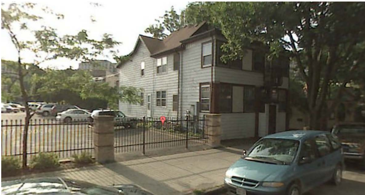
Google street view image

Multi-family residence constructed in 1894.