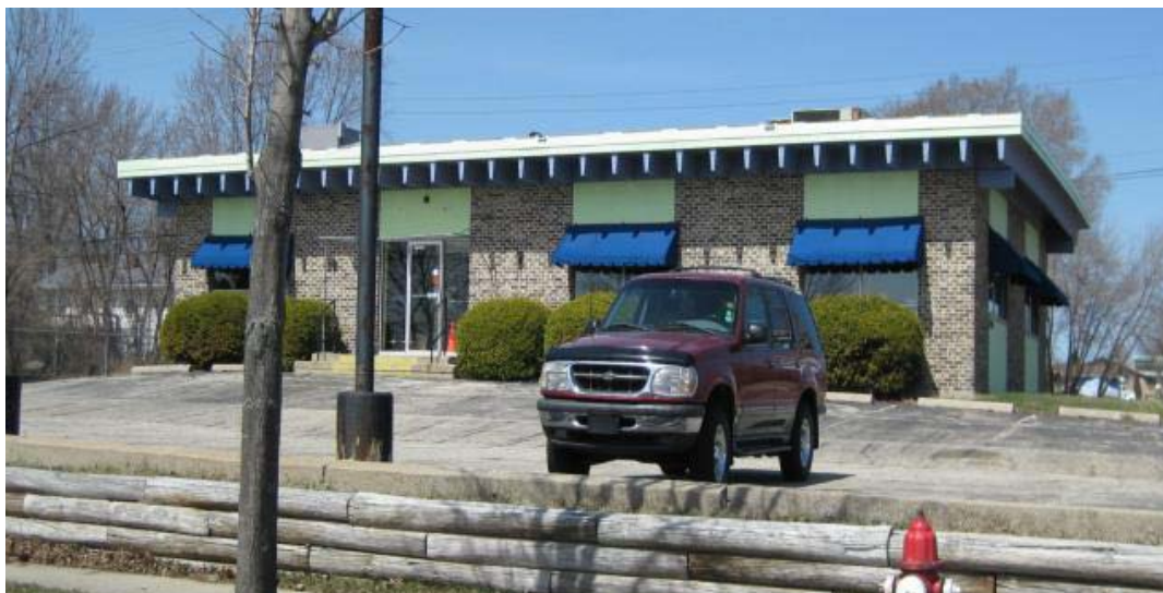
Assessor's property record photo (approximately 15 years old)