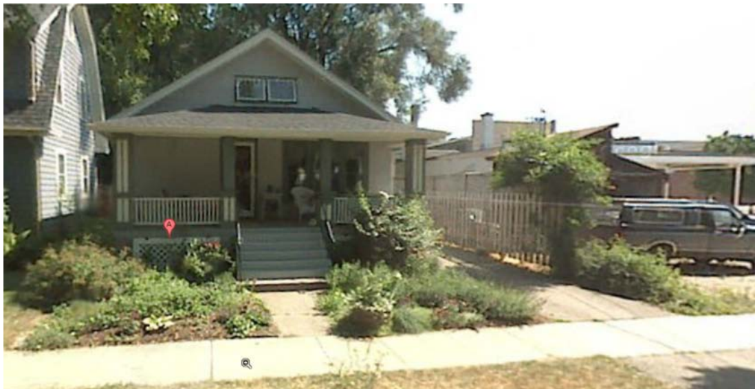
Google street view image