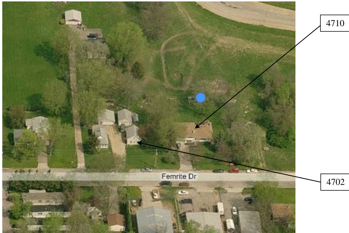
Bing maps image

Single family residential, dates of construction unknown.