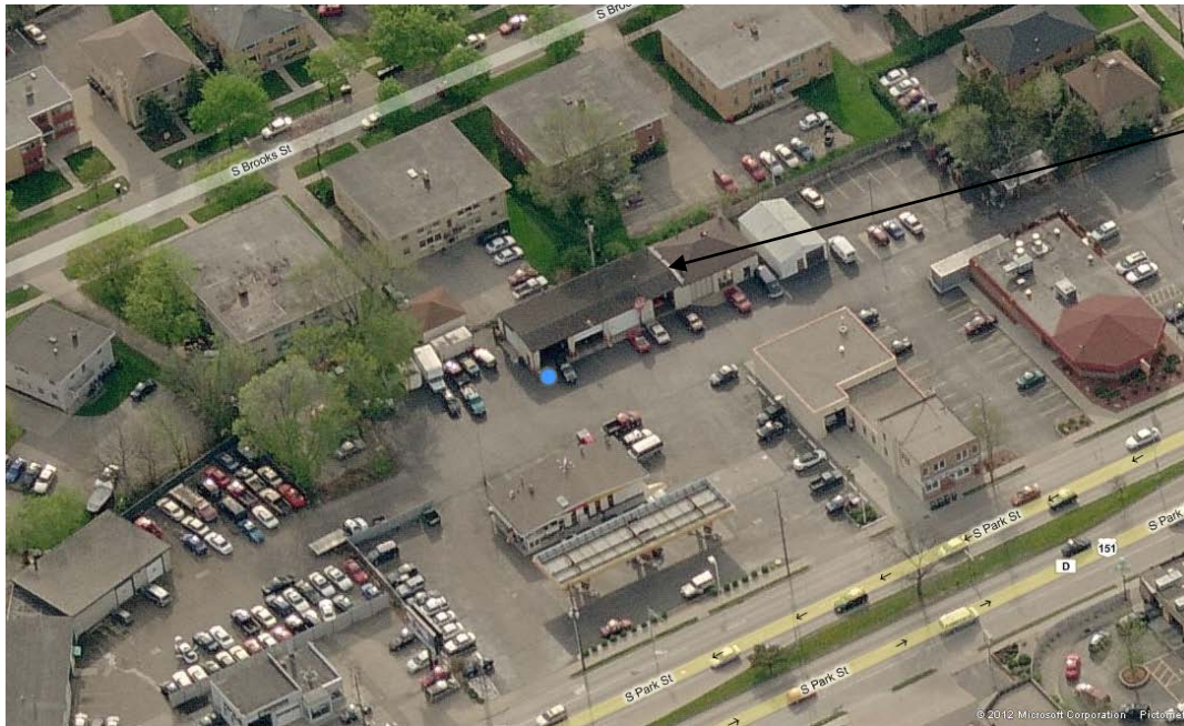
Bing maps image

Commercial, constructed before 1978 (according to the Assessor's records).