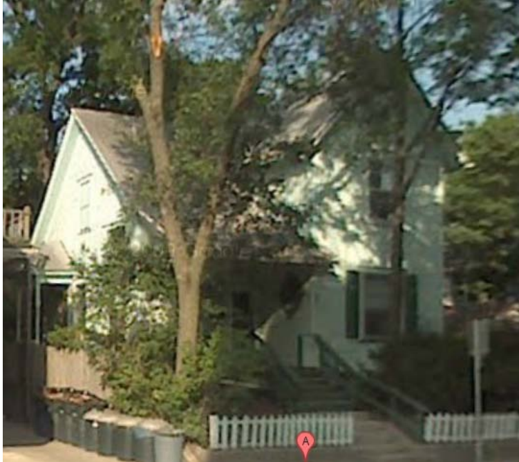
Google street view image