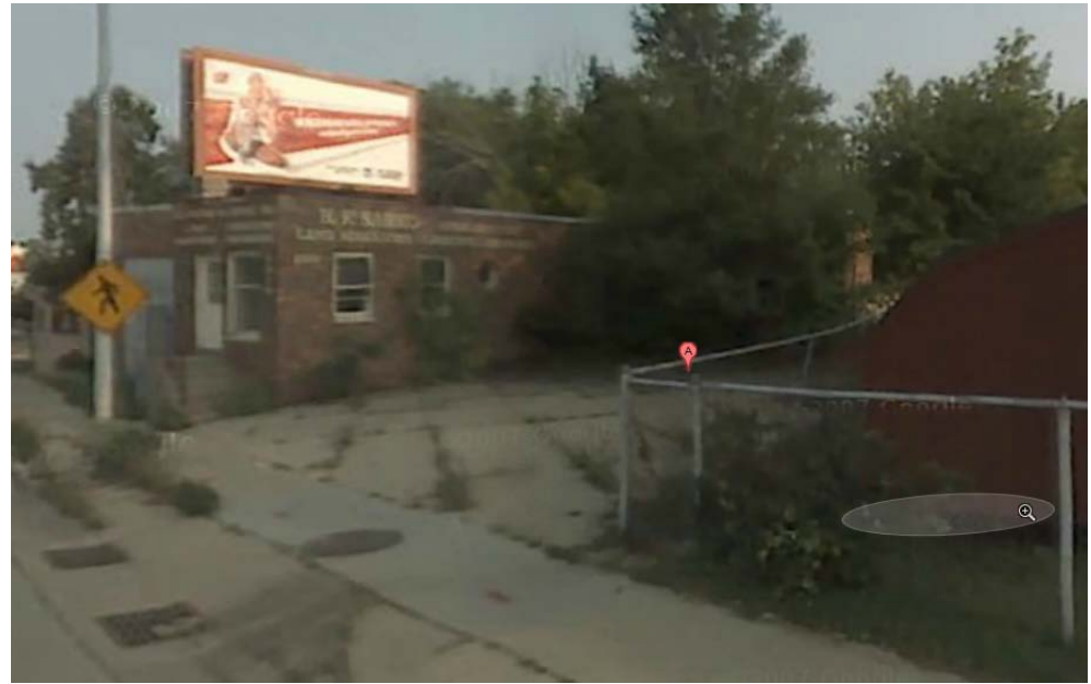
Google street view image