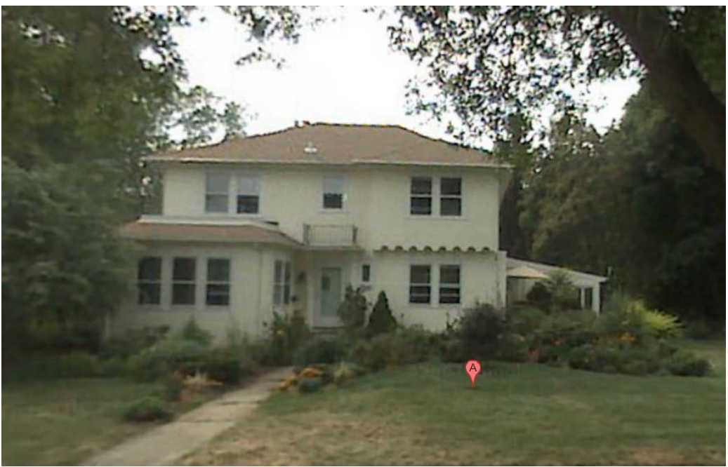
Google street view image

<u>3934 Manitou Way</u> Single family residence, constructed in 1924 (according to the Assessor)/ 1930 (according to the preservation file).