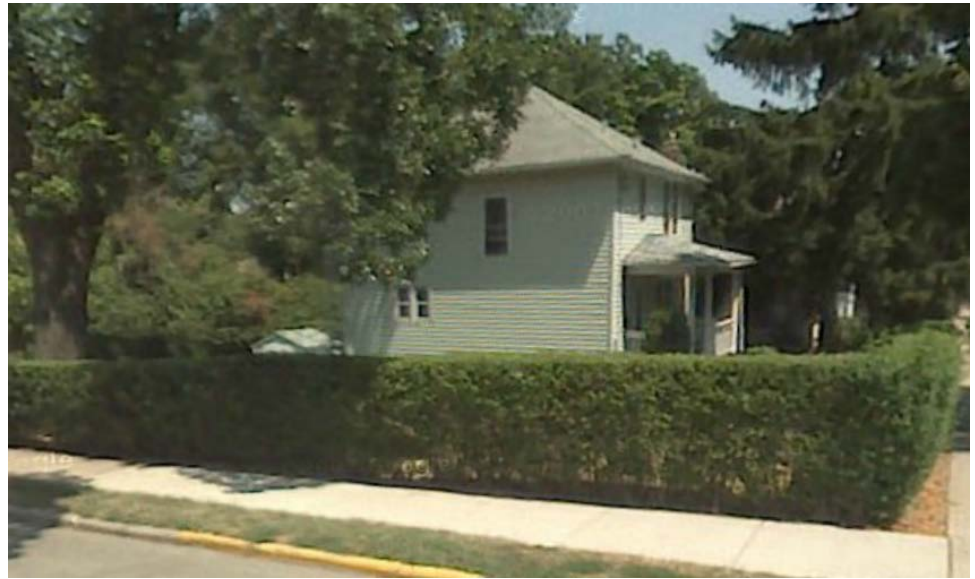
Google street view image