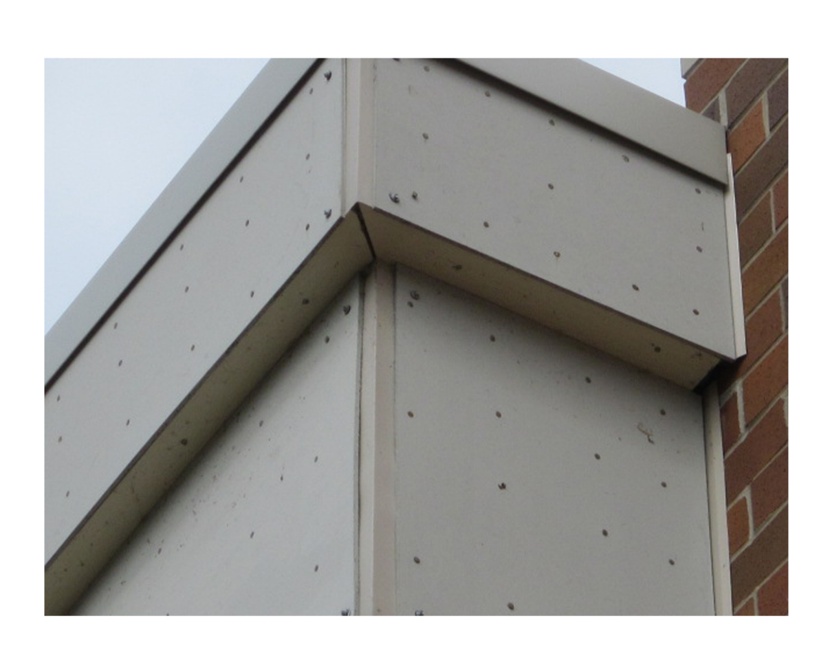
Existing Building 1912 Atwood Avene September 12, 2012