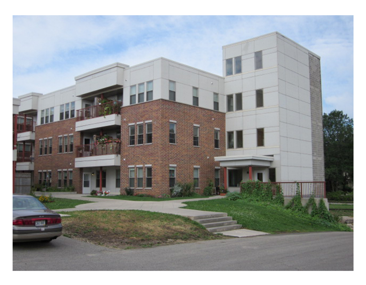
Existing Building Photos 1912 Atwood Avene September 12, 2012