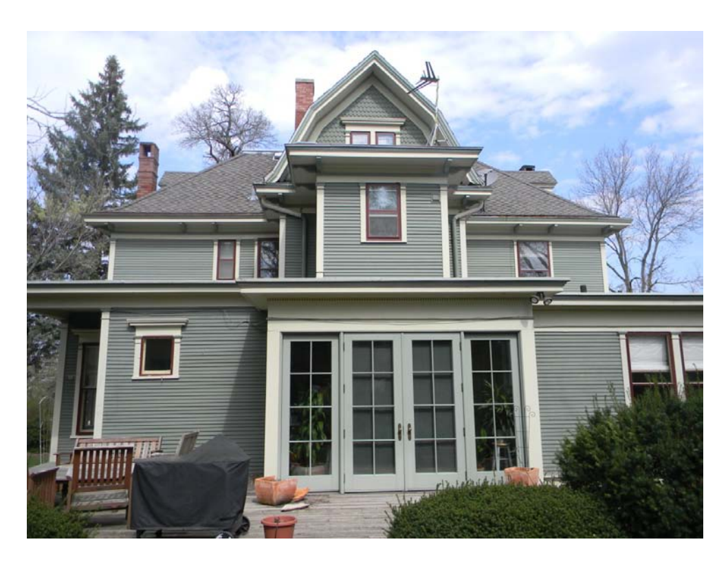
the east façade (note: enclosed porch windows will remain)