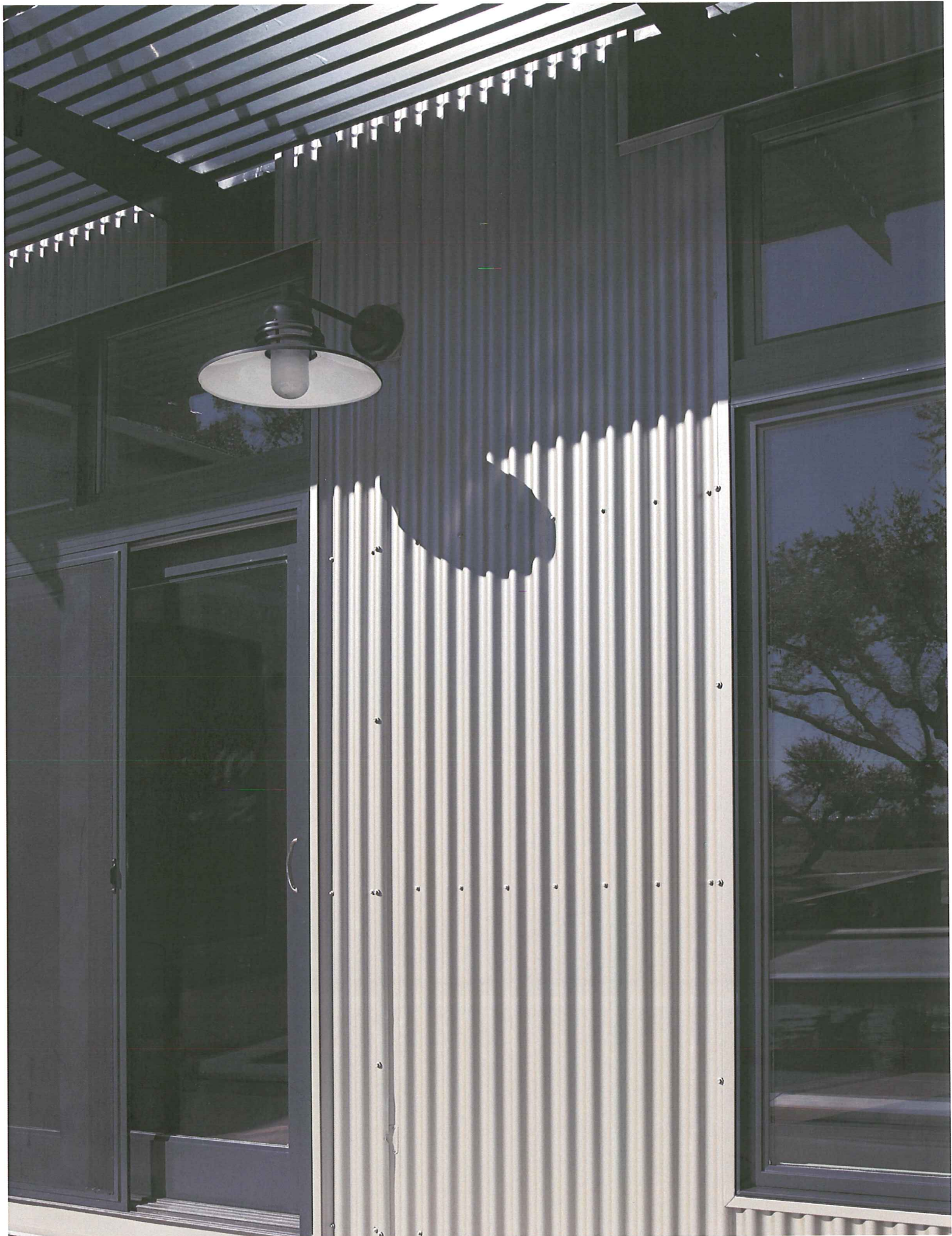
4-11-12 USL No. 1 Handout