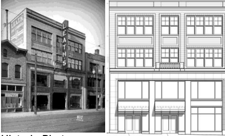
Historic Photo 117-119 State Street