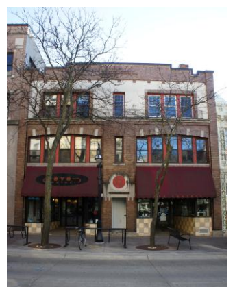
121-123 State Street – Façade to remain