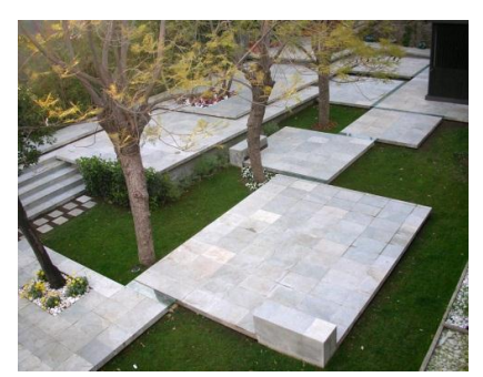
Montjuic Garden Barcelona, Spain

There are many fine examples of green spaces within the urban fabric of cities around the world. These spaces add to the aesthetics of our cities – they provide outdoor rooms that are engaging, inviting and unique within the city fabric. These spaces can also be dynamic and sculptural as illustrated in the examples below. Such a vision is proposed in this Project.