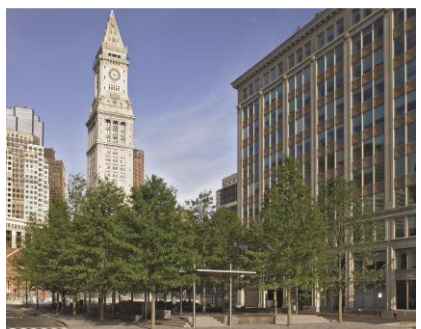
Central Wharf Boston, MA