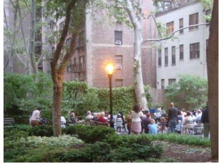
Tudor City Greens New York City, NY