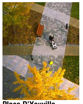
Place D'Youville Montreal, Quebec