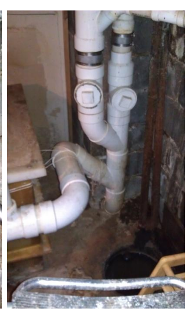
Poor condition of sanitary piping