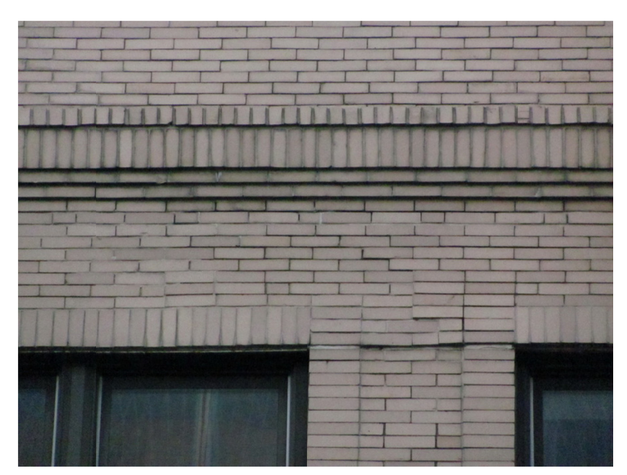
Figure 5. Cracking and displacement of brick masonry above window heads.