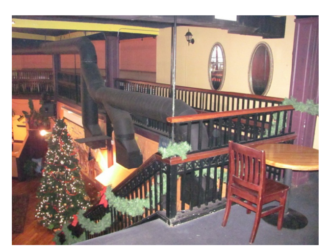
Figure 11. Second floor mezzanine with original balustrade.