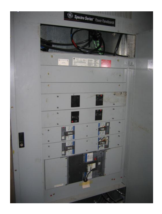
Distribution panel in the basement.