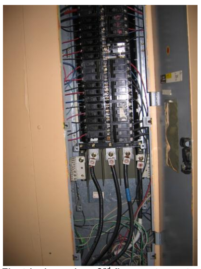
Electrical panel on 2<sup>nd</sup> floor restaurant missing interior trim cover.