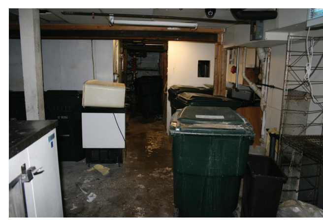
Basement: View of garbage cans