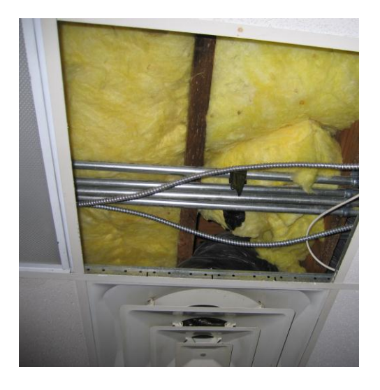
Conduits above ceiling on 3<sup>rd</sup> floor.