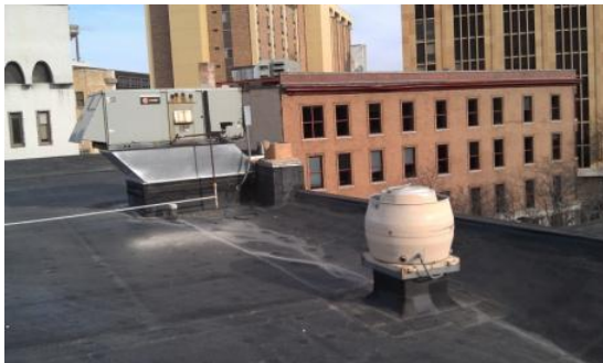
Existing rooftop equipment