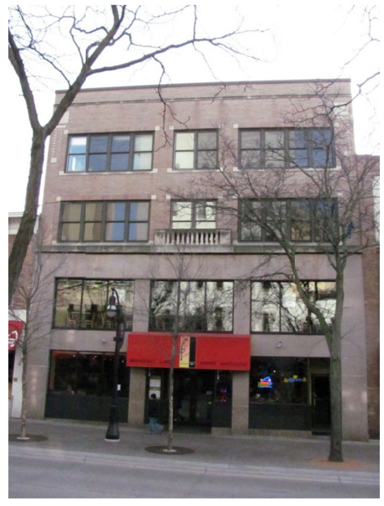
Figure 1. The State Street facade.