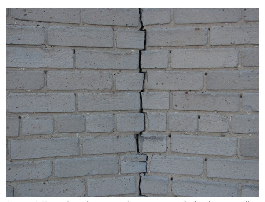
Figure 6. Vertical cracking at an obtuse corner in the brick party wall.