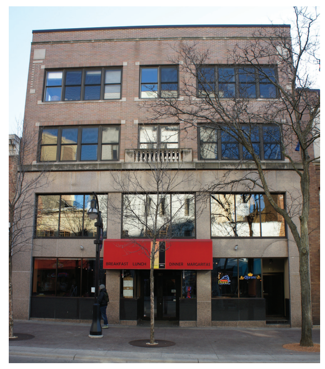
View of Front Facade