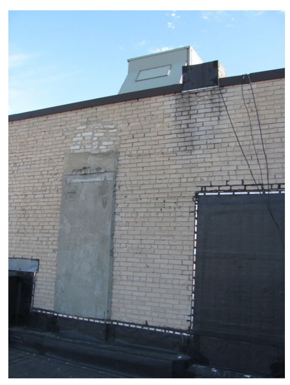
Figure 7. Left. Vertical cracking and localized damage in the brick masonry party wall, which is visible where it extends above the roofs of the adjacent buildings.