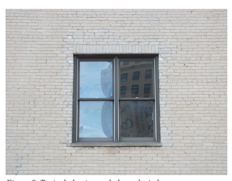
Figure 9. Typical aluminum-clad wood windows.