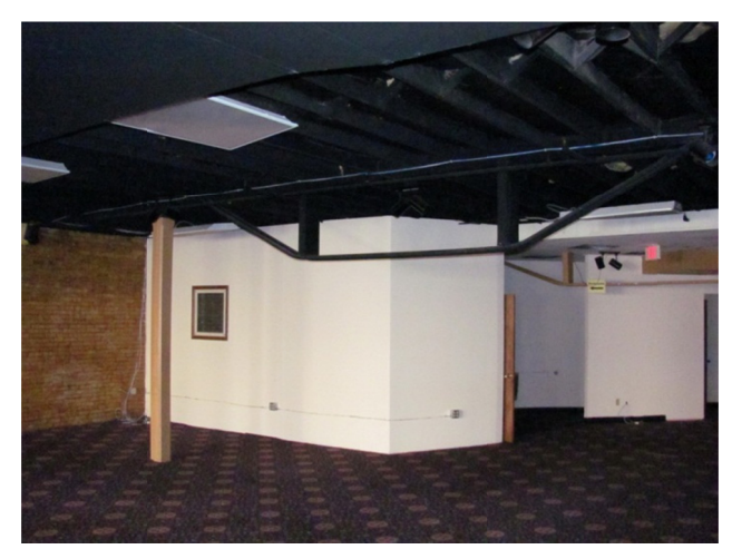
Figure 12. At the third and fourth floors of the building, unique original wood and iron trusses are exposed to view.