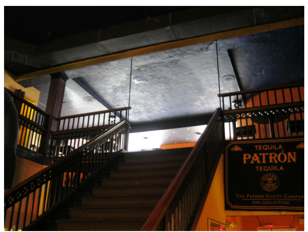
Photo 1 –3<sup>rd</sup> floor beams and column viewed from 1<sup>st</sup> floor restaurant