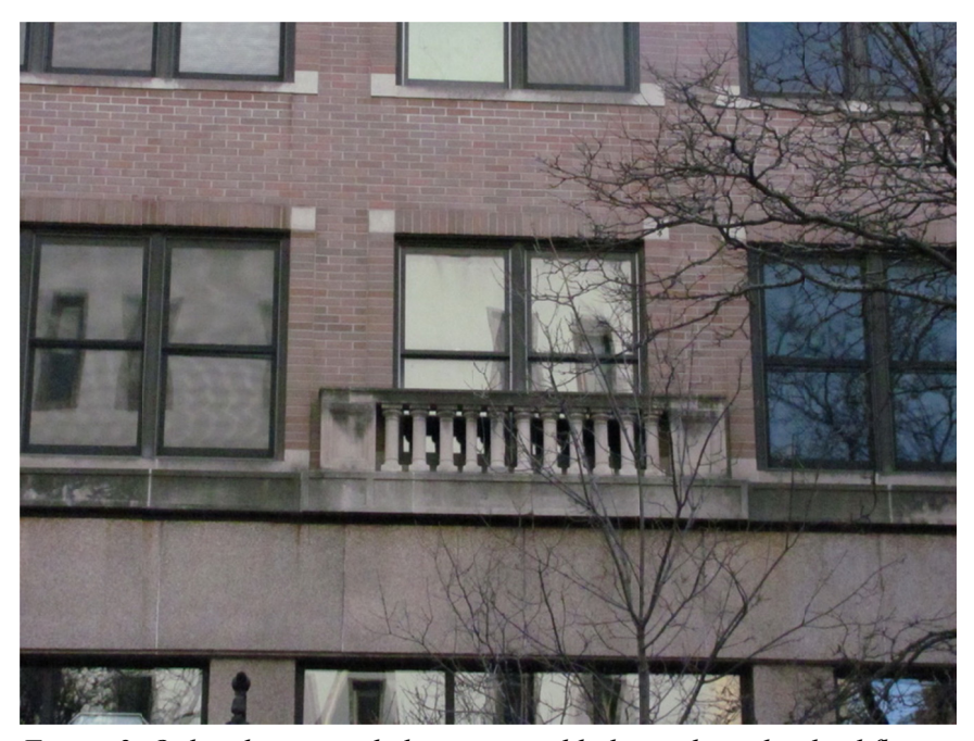
Figure 2. Only a limestone belt course and balustrade at the third floor remain from the original State Street facade.