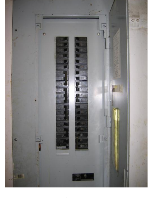
Electrical panel on 1st floor restaurant.