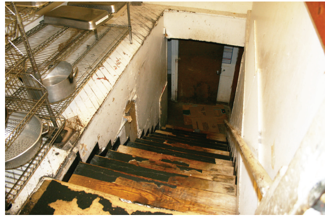
First Floor: View of access to basement