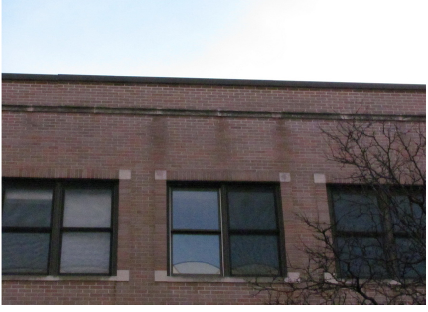
Figure 3. Water rundown staining below the stringcourse at the parapet wall.