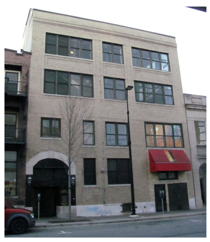
Figure 4. The Fairchild Street facade.