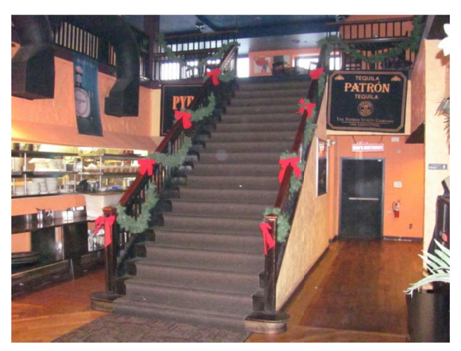
Figure 10. Original staircase from the first floor to the second floor.