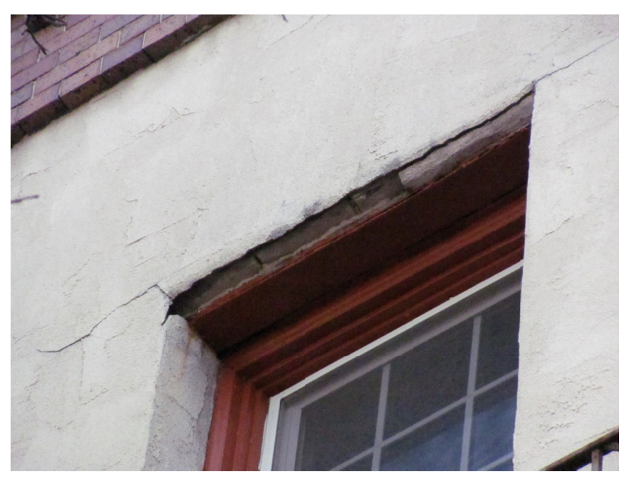
Figure 6. A portion of stucco has previously spalled at the head of the center third floor window.