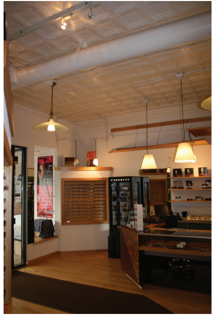
First Floor Retail