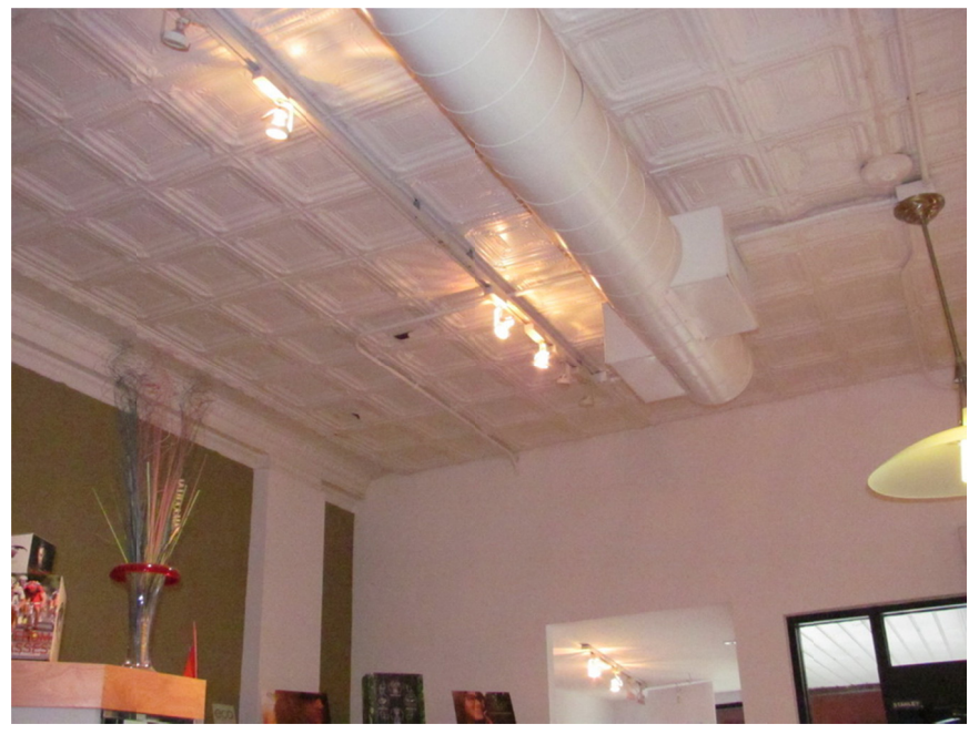
Figure 17. The ceiling in a portion of the retail space is an original painted pressed metal ceiling.