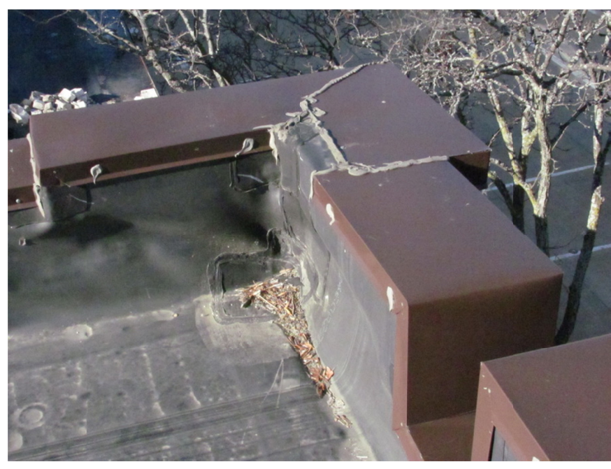
Figure 16. The sheet metal coping has numerous laps and splices that are surface-sealed with untooled sealant.