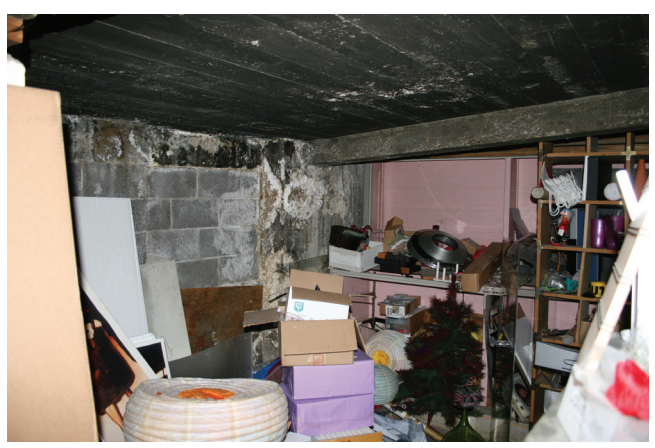
Basement: View of area below an entry ramp to the first floor retail