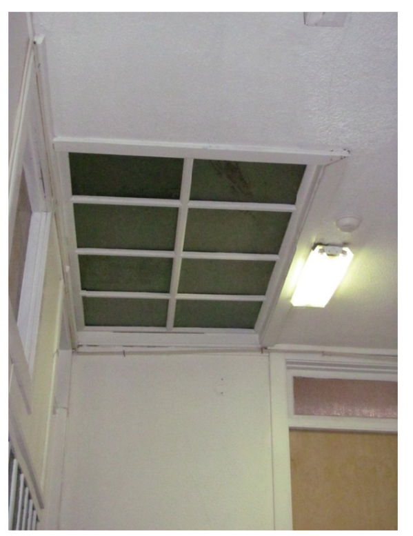
Figure 21. Interior laylight at the third floor corridor.