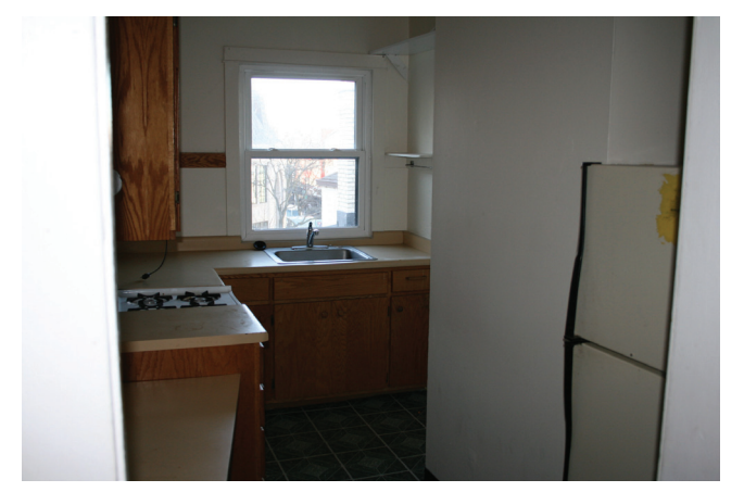
Upper Floor Apartment: Kitchen