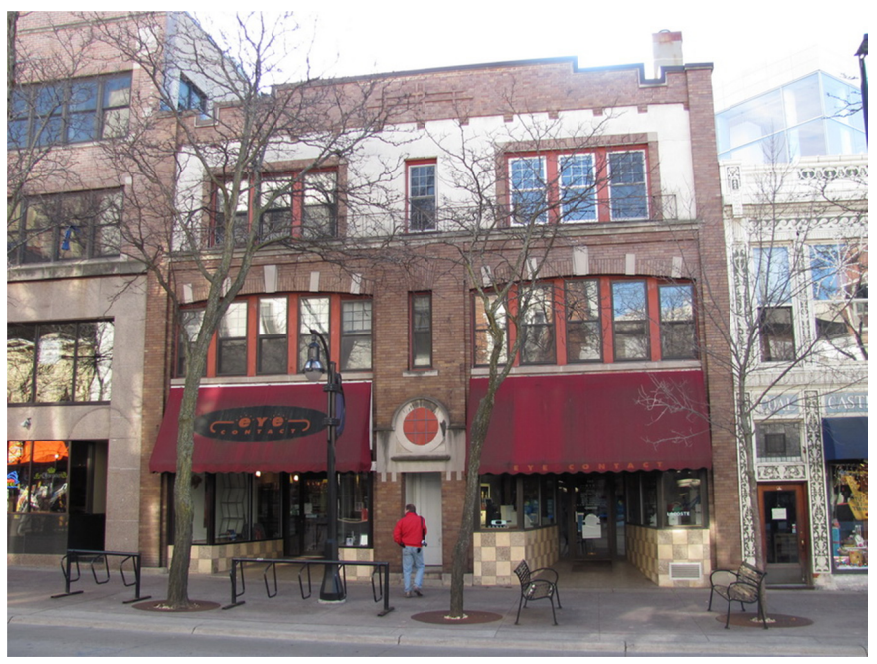
Figure 1. Overall view of the State Street facade.