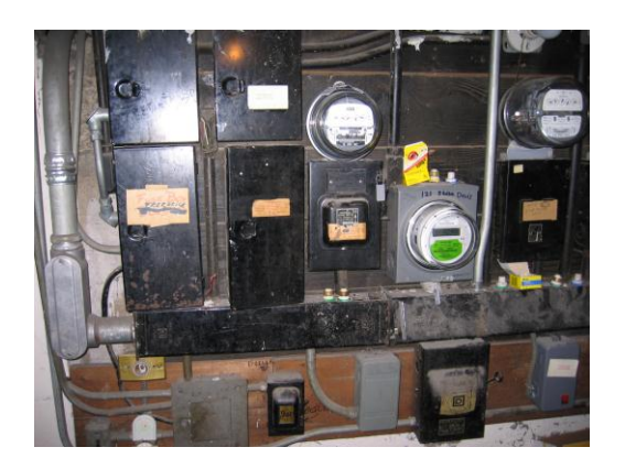
A portion of the older electrical service equipment in the Basement.