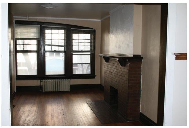
Upper Floor: Apartment toward State Street window