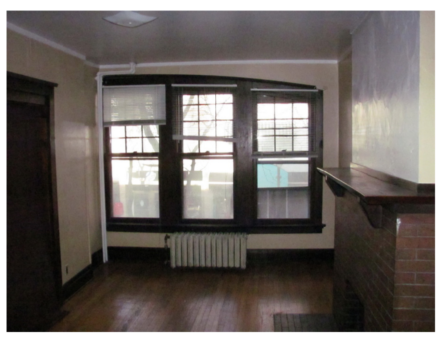
Figure 20. Typical apartment interior showing intact original finishes.