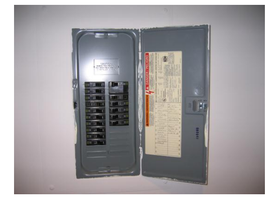
Electrical panel on 1<sup>st</sup> floor retail.

The newer electrical meters in the Basement.