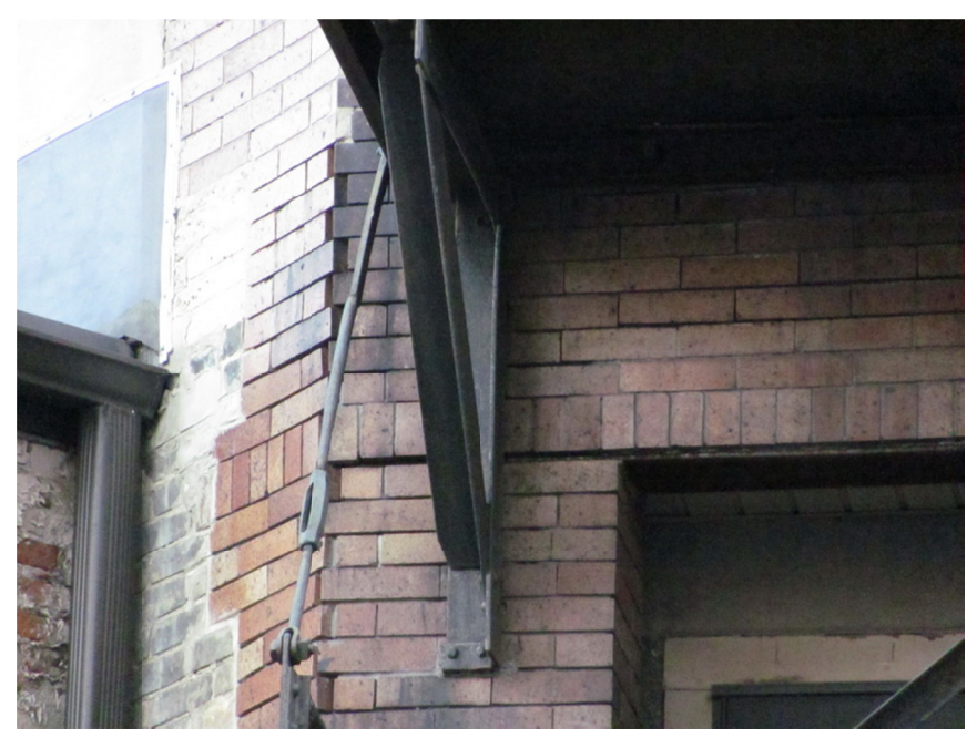
Figure 13. Surface corrosion and minor displacement of masonry associated with the bearing points of the lintels was observed.