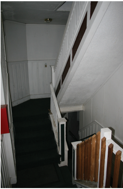
View from third floor toward stair to roof