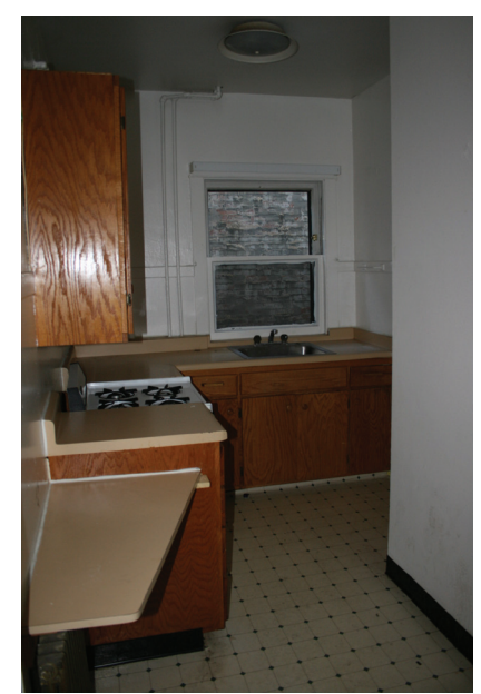
Upper Floor Apartment: Kitchen