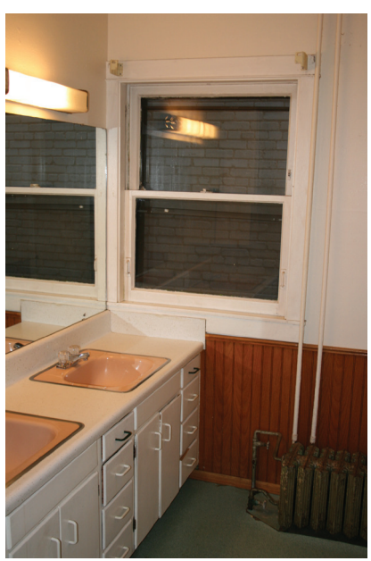
Upper Floor Apartment