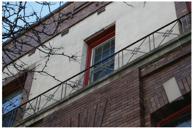
Exterior: View of plaster-coated wall surface