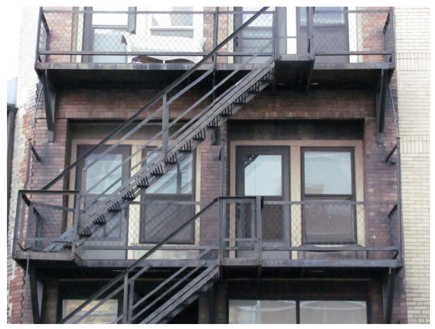
Figure 12. The balconies and fire escapes appeared intact, with areas of paint loss and surface corrosion.