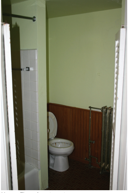
Upper Floor Apartment