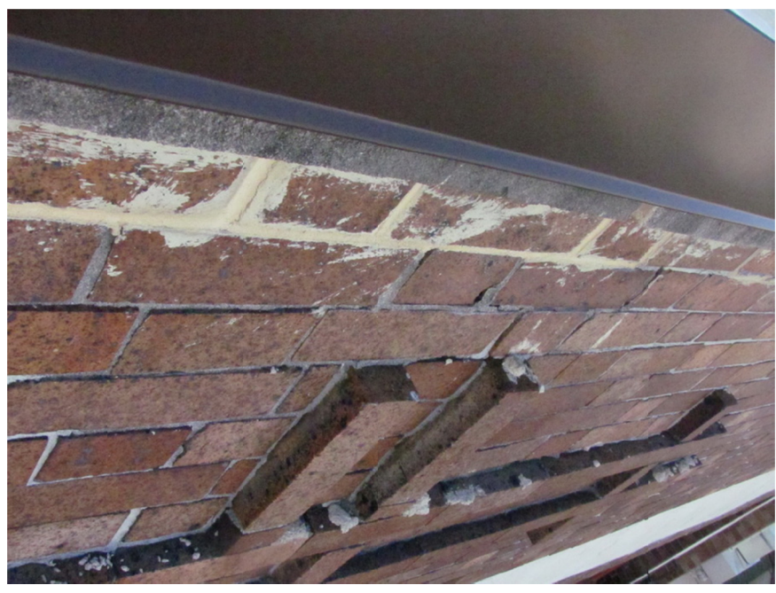
Figure 3. Portions of the top of the parapet wall were previously repointed.