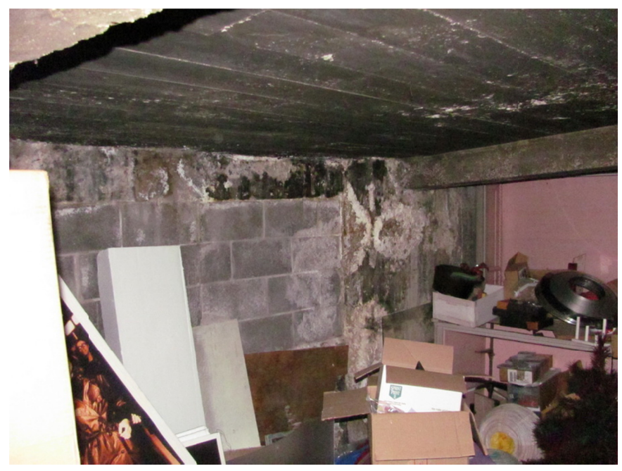
Figure 22. Efflorescence and water staining at the basement level below the entrance storefront.