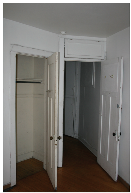
Upper Floor Apartment