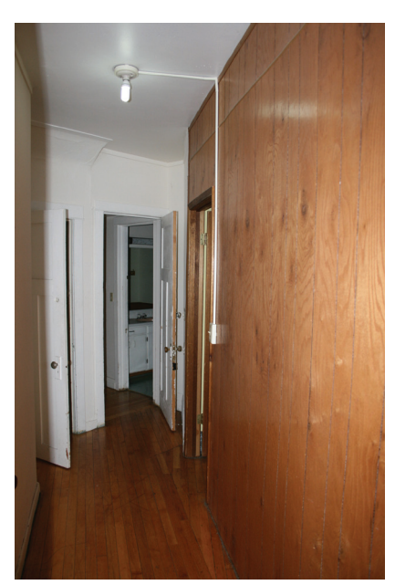
Upper Floor Apartment