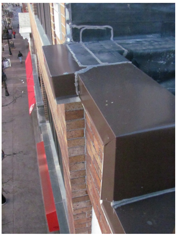
Figure 15. The sheet metal coping covers the original limestone coping.