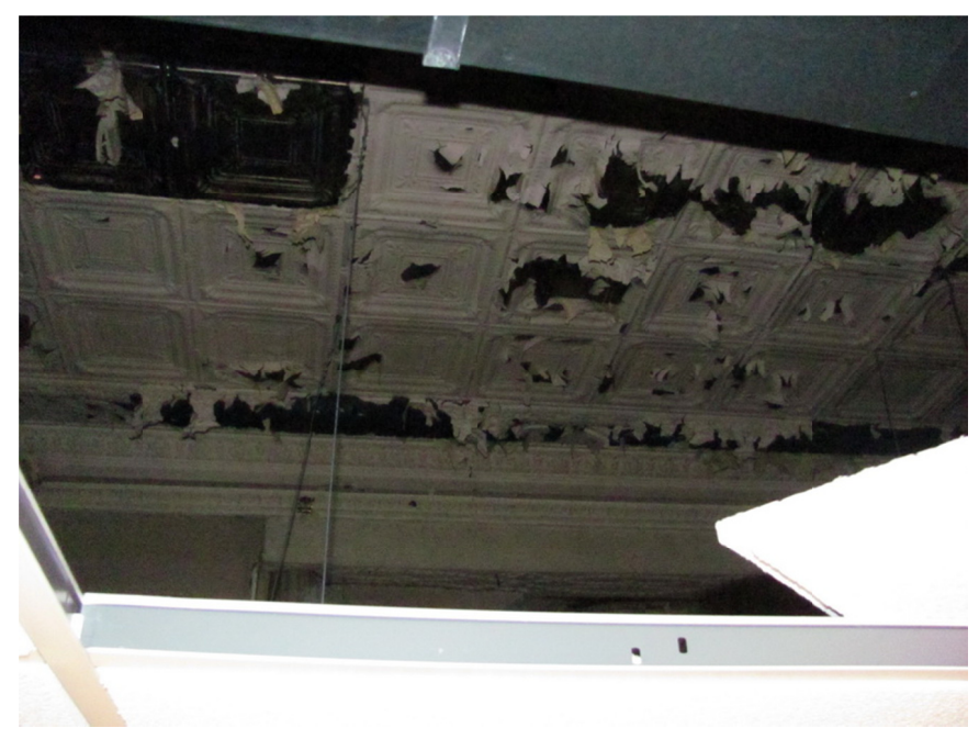
Figure 18. A suspended acoustic tile ceiling conceals other similar original pressed metal ceilings. The full extent of the pressed metal ceiling finish is not known.