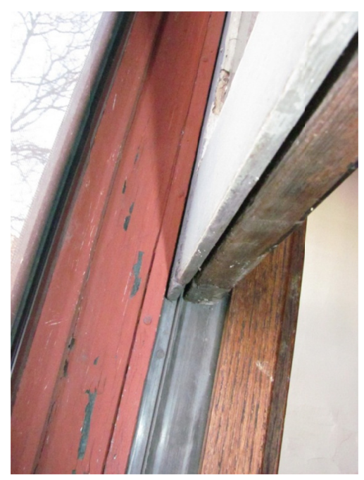
Figure 9. The original wood windows appeared intact and have been routed to receive galvanized metal weatherstripping.