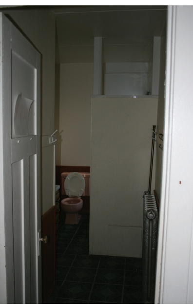
Upper Floor Apartment: Bathroom