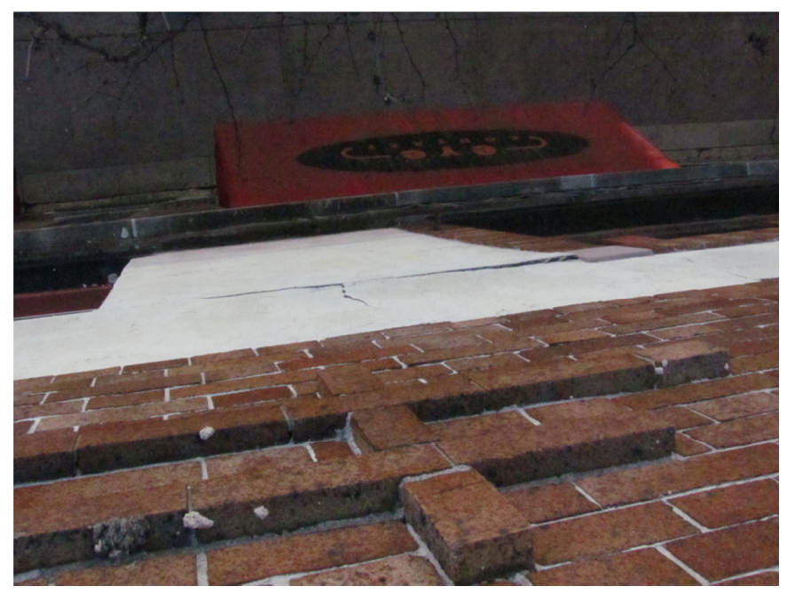
Figure 5. View from the roof of one especially large delaminated area of stucco observed near the middle of the facade.