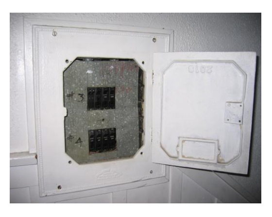
Third floor fuse panel converted to circuit breakers.