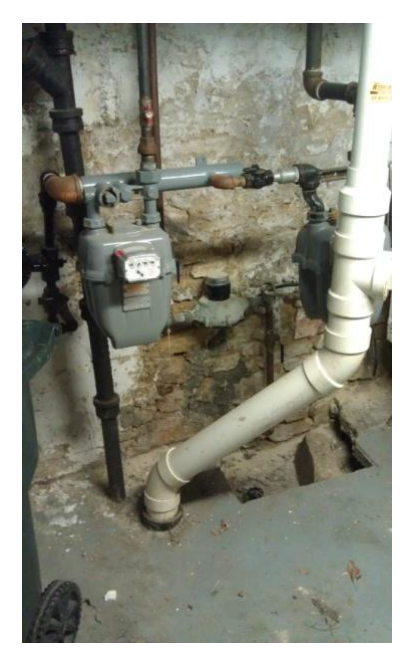
Building service entrances

The first floor heating/cooling system consists of a furnace in the basement, and an air cooled condensing unit adjacent to the fire escape. The upper apartments are heated by a pair of gas-fired hot water boilers, also in the basement. A gas-fired water heater provides hot water for the building. There is an internal cast iron storm drain dropping down into the basement and horizontally out to the storm main in N. Fairchild St.. Multiple vertical cast iron sanitary pipes drop into the basement and into the floor. There are two gas meters serving this building and one water meter.