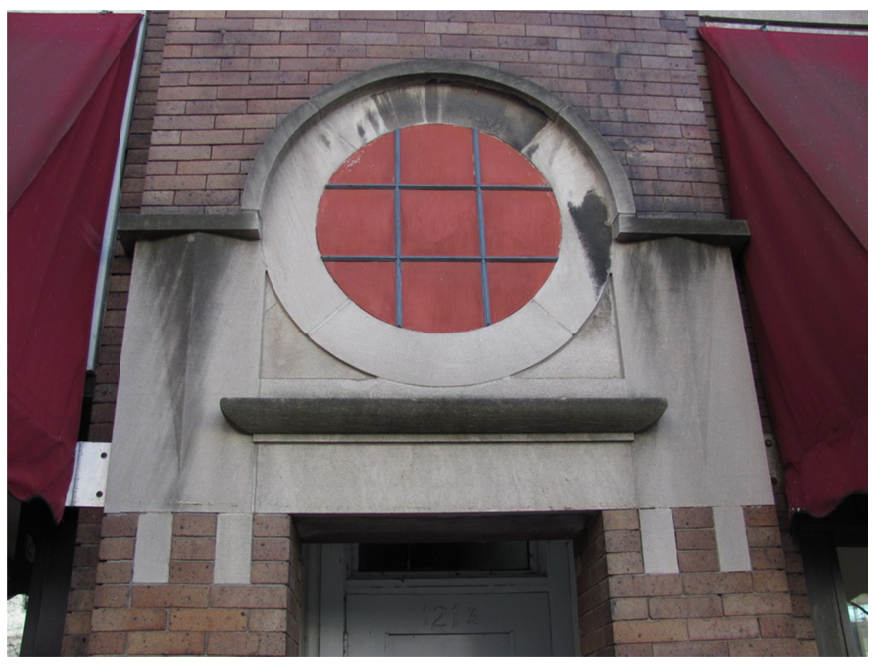
Figure 2. A circular opening above the entrance door to the apartments has been infilled with painted plywood.