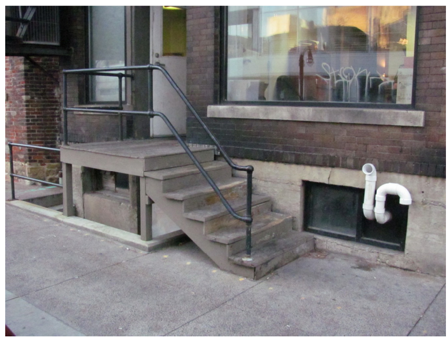
Figure 11. A painted wood stair and platform provide access to a first floor entrance door; there is a sunken well with an entrance door to the basement directly below.