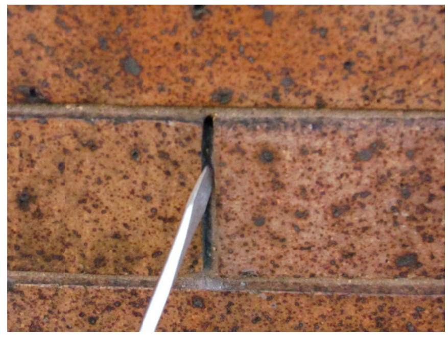
Figure 4. Occasional open mortar joints were observed.