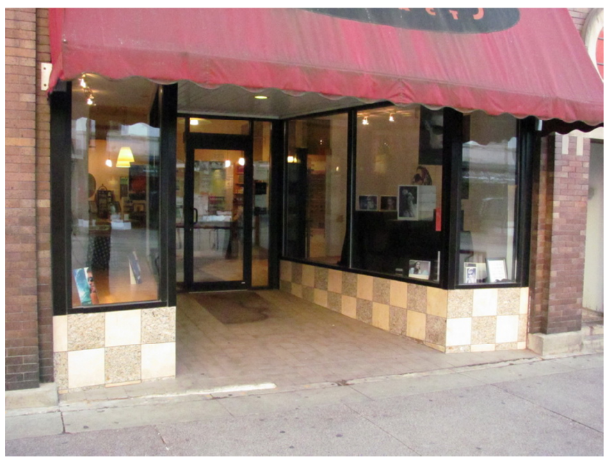
Figure 7. The first floor storefronts are relatively new aluminum-framed windows above a tile-clad knee wall.