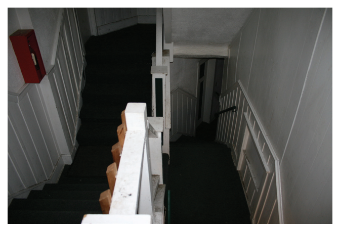
View from third floor down stairs to second floor apartment entrances