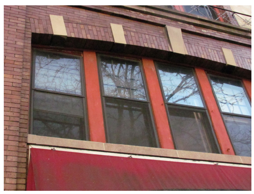
Figure 8. The upper floors of the building typically have original double-hung nine-over-one wood windows, covered by aluminum triple-track exterior storm windows.