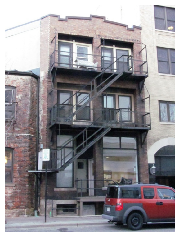
Figure 10. Overall view of the Fairchild Street facade.