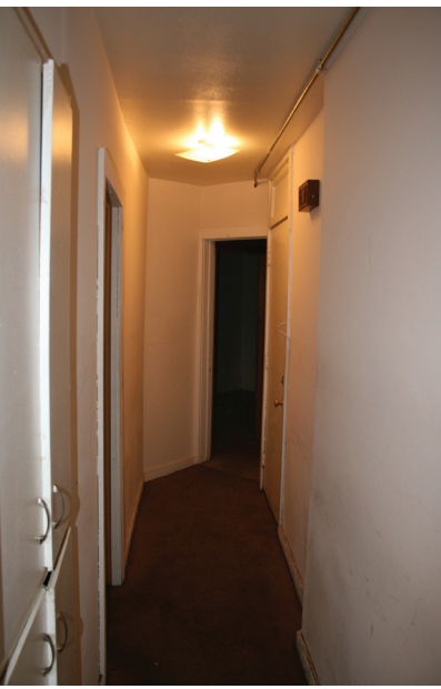
Upper Floor Apartment