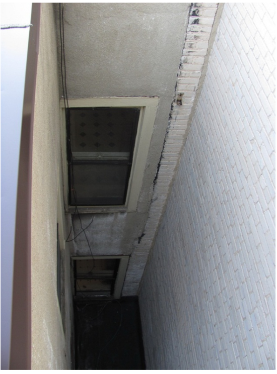
Figure 14. Two-story light well along the east wall of the building.