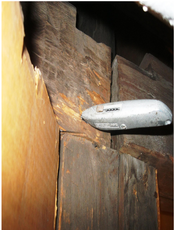
Photo 2 – Poor fit up and wood density at 1<sup>st</sup> floor beams and column