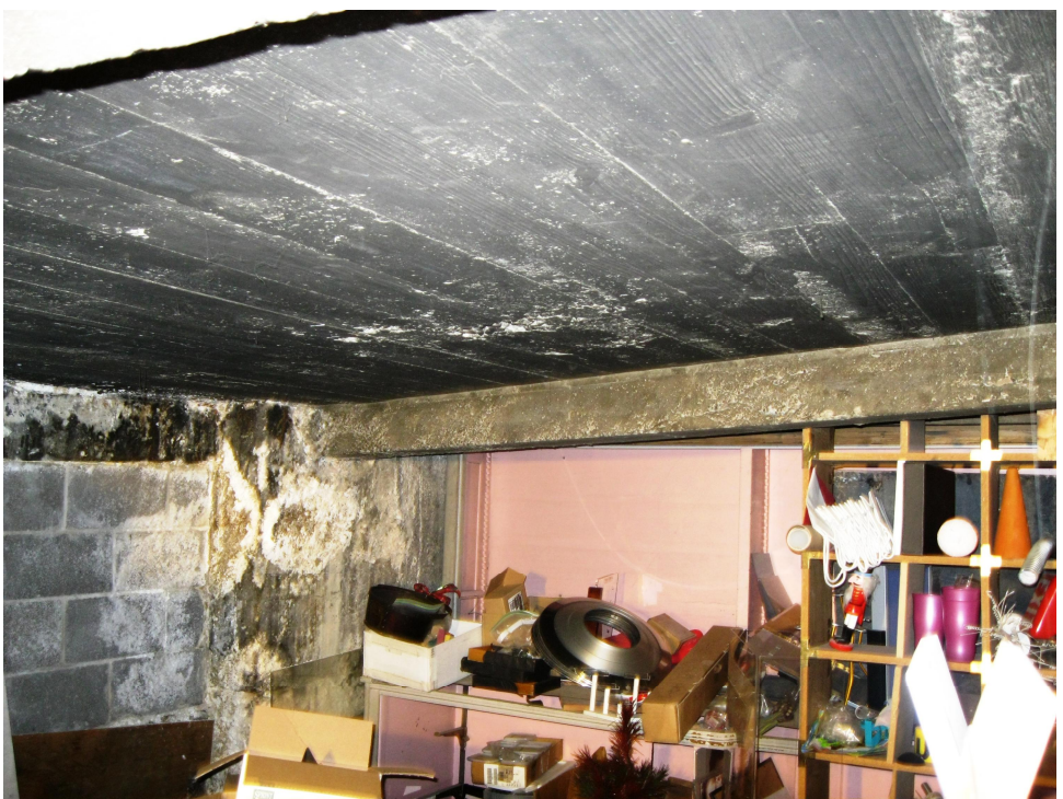
Photo 3 – Cast in place concrete area of 1st floor at State Street entrance