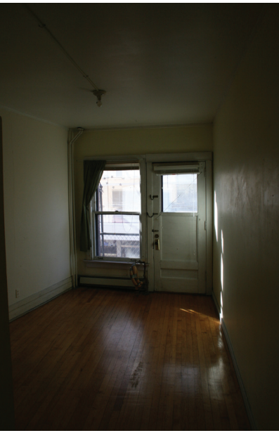
Upper Floor: Bedroom