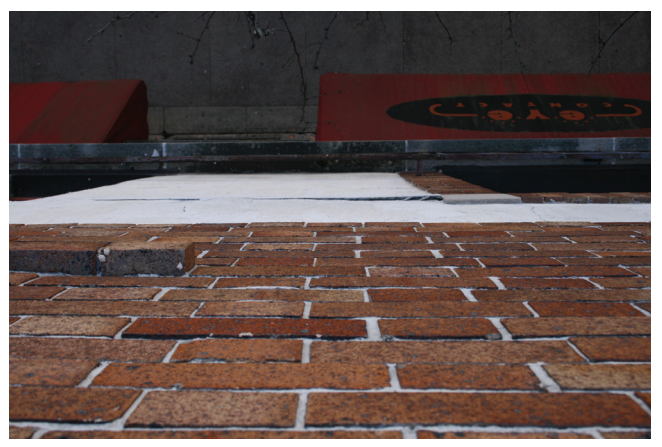
Exterior: View from roof of plaster-coated wall surface showing delamination of the plaster coating