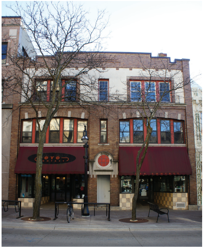
View of Front Facade