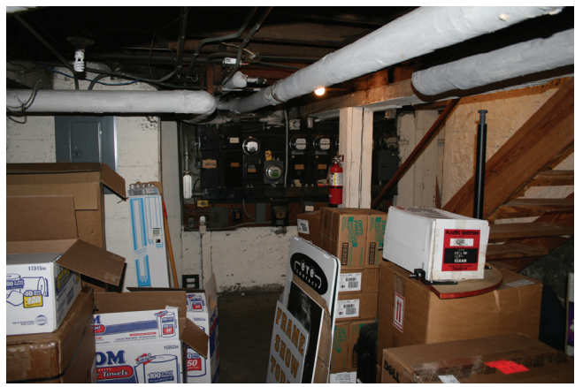
Basement: View of electrical