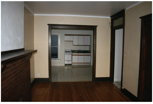
Upper Floor Apartment