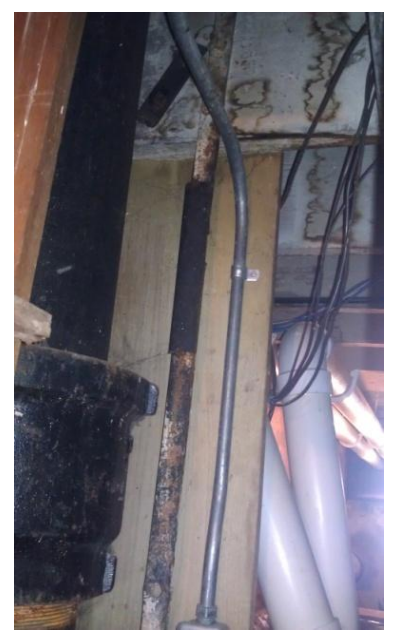
Failing storm main support

The building does not have a fire protection system.