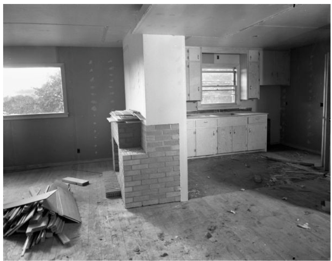
1948: Low Cost Housing for World War II Veterans. Interior to one of four Erdman homes, Midvale Blvd., Sunset Village, Madison. Image ID: WHi-54825