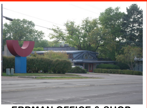
ERDMAN OFFICE & SHOP 5117 UNIVERSITY AVE MADISON, WI