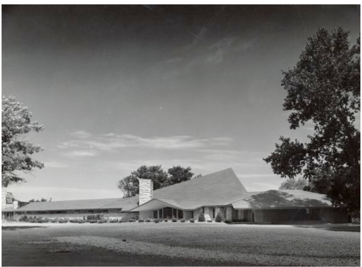
1952 ca. First Unitarian Society Meeting House.