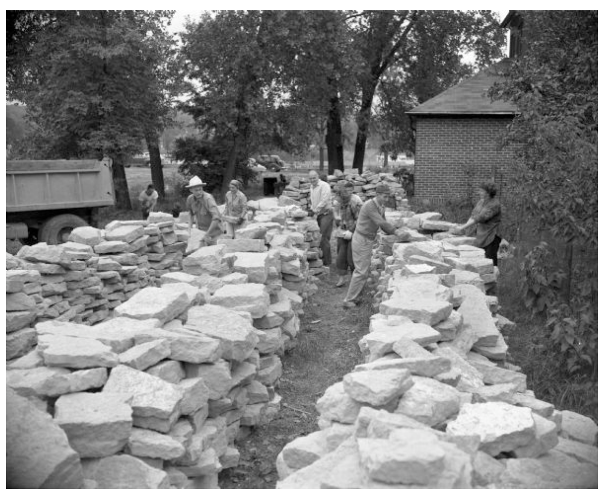
c. 1949-51. Unitarian Meeting House Congregation Sorting Stones. Image ID: WHi-26547