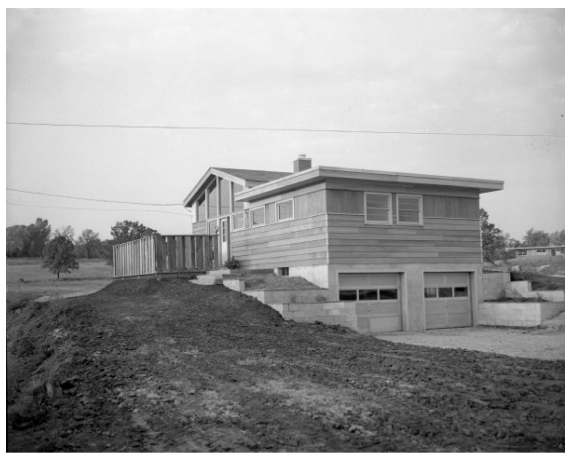
date unknown: Marshall Erdman Prize-winning Prefabricated Home.