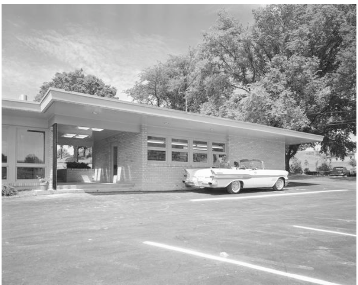
1958: 2700 Marshall Court in Doctors Park, Shorewood Hills. Early drive-through pharmacy.