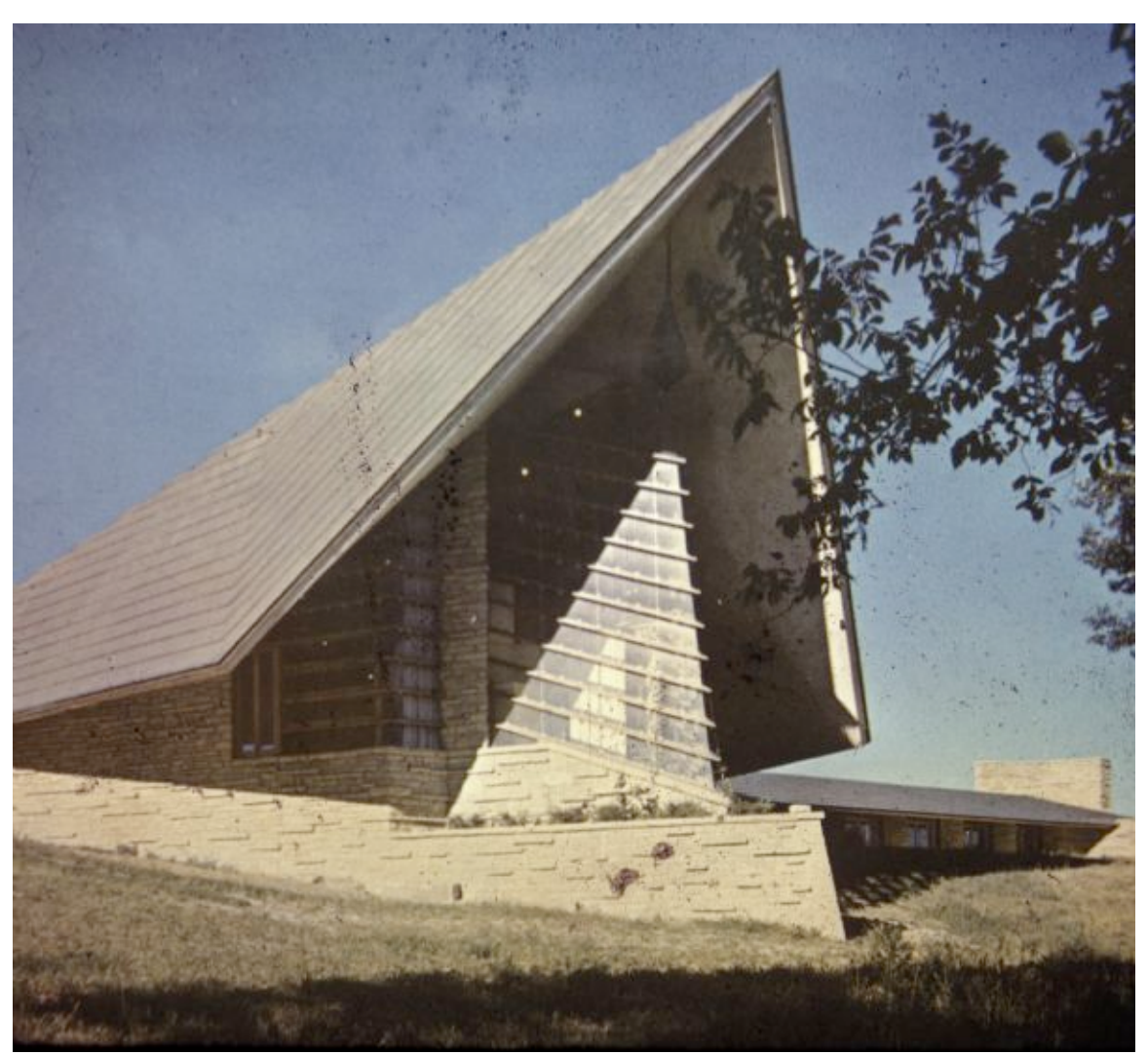
1951: First Unitarian Meeting House, 900 University Bay Drive.