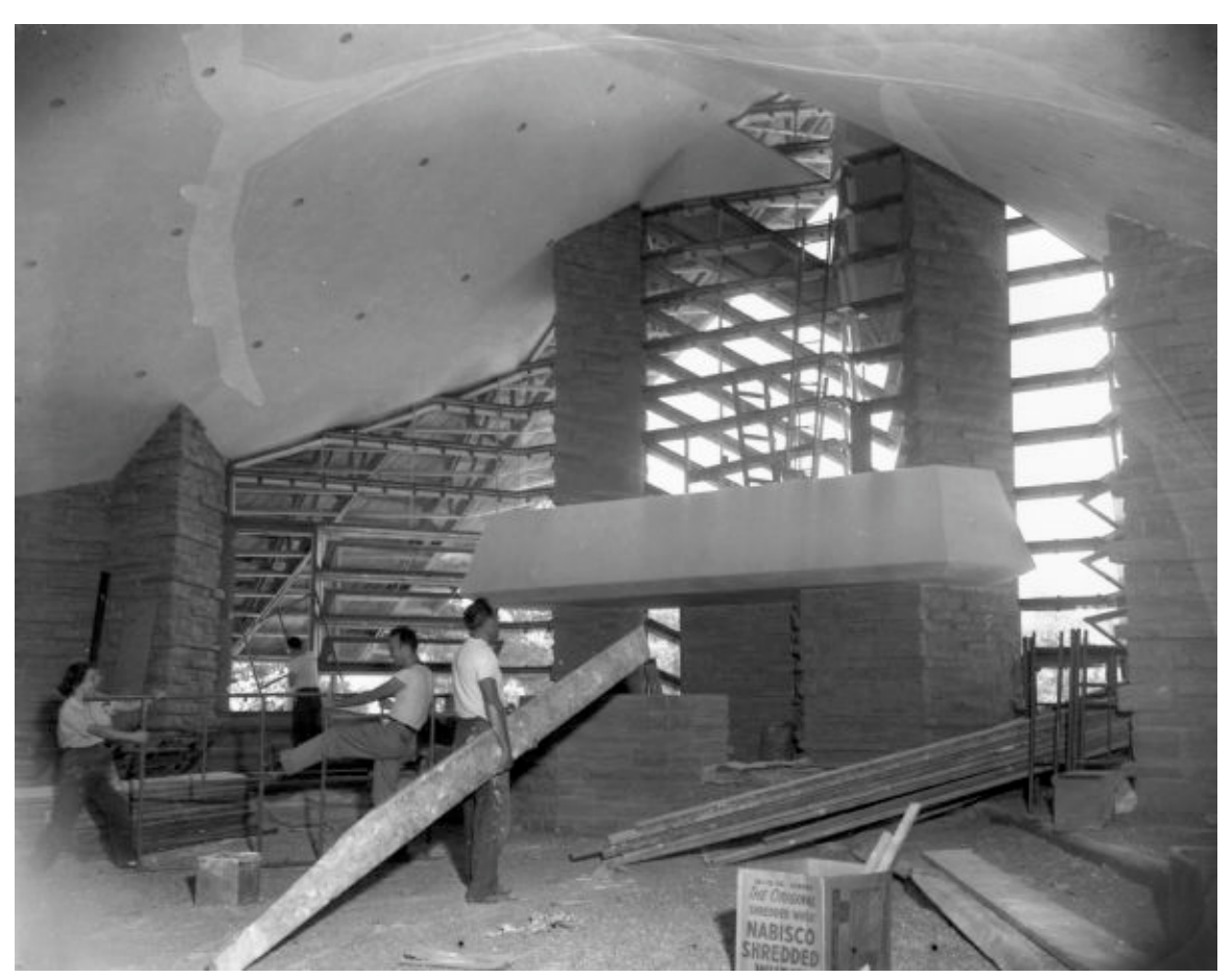
August 19, 1951 before: Unitarian Meeting House Construction.

Image ID: WHi-26534