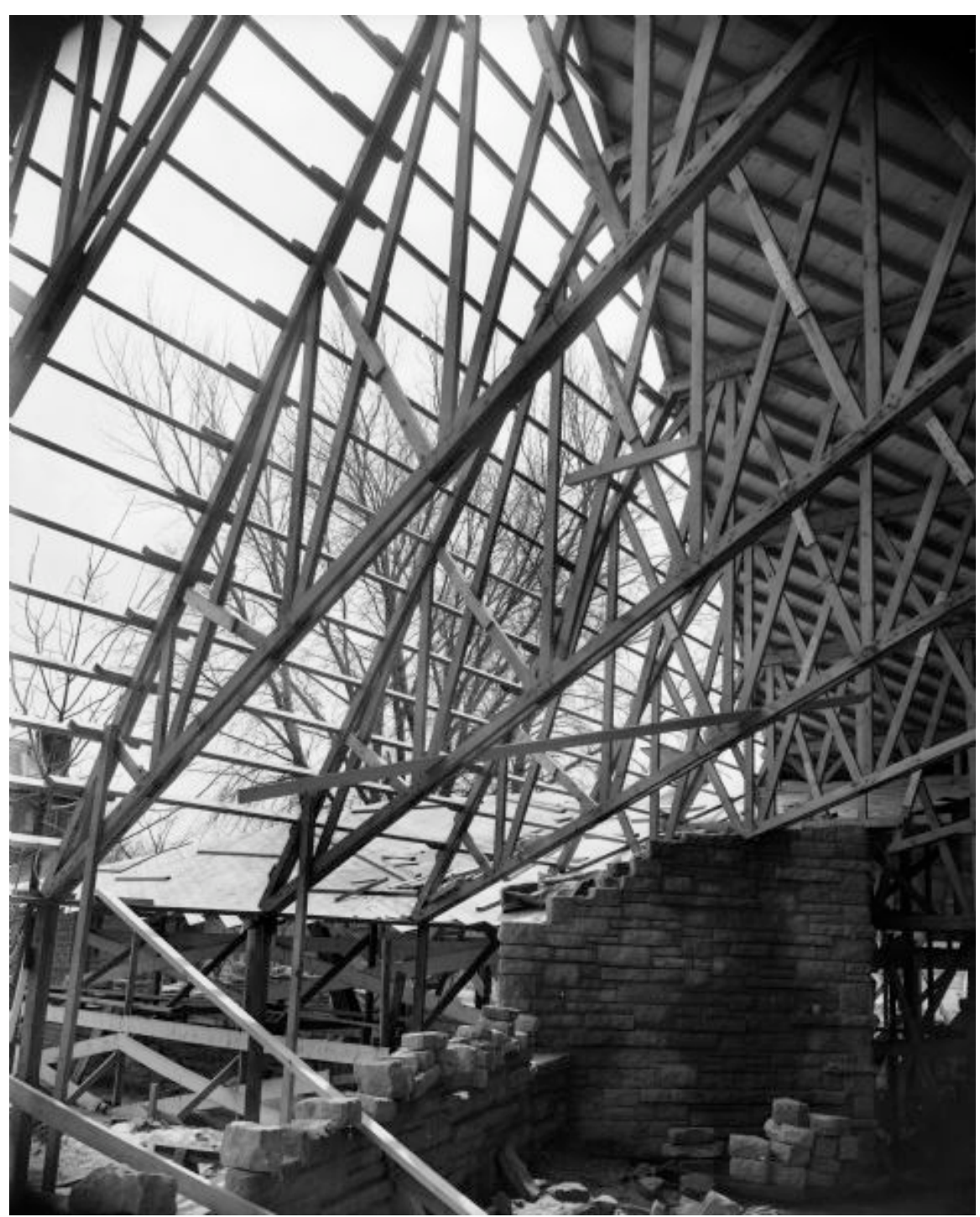
1950 ca. Unitarian Meeting House Construction.

Roof trusses in auditorium of the Unitarian Meeting House during construction.