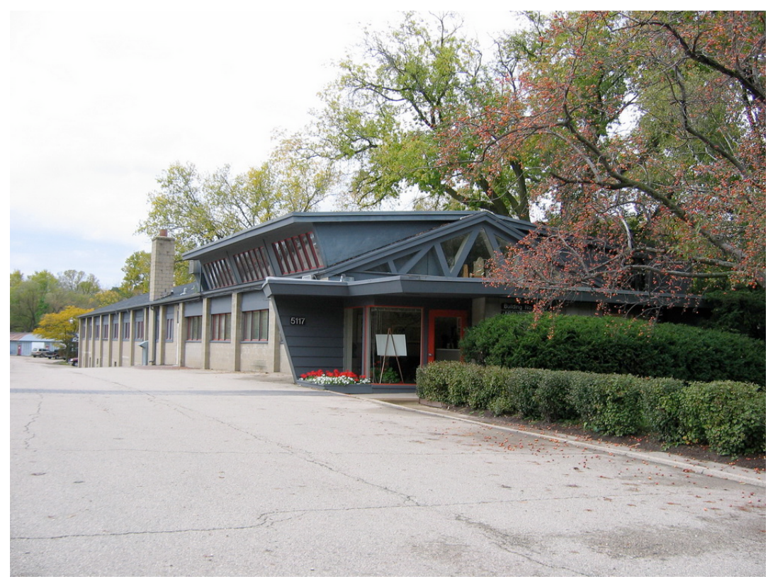
Marshall Erdman Office & Shop, 5117 University Ave., Madison, WI.