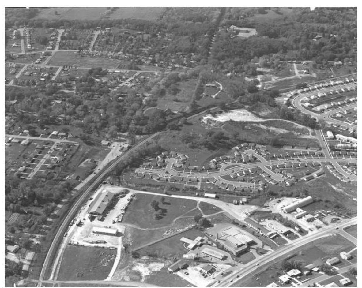
1958 aerial view. Erdman property, lower right. Railroad left, curving. Indian Hills subdivision, bottom right corner. University Ave. bottom right. Looking SW toward Craig Ave. Blackhawk District, upper right.

Image ID: WHi-5070