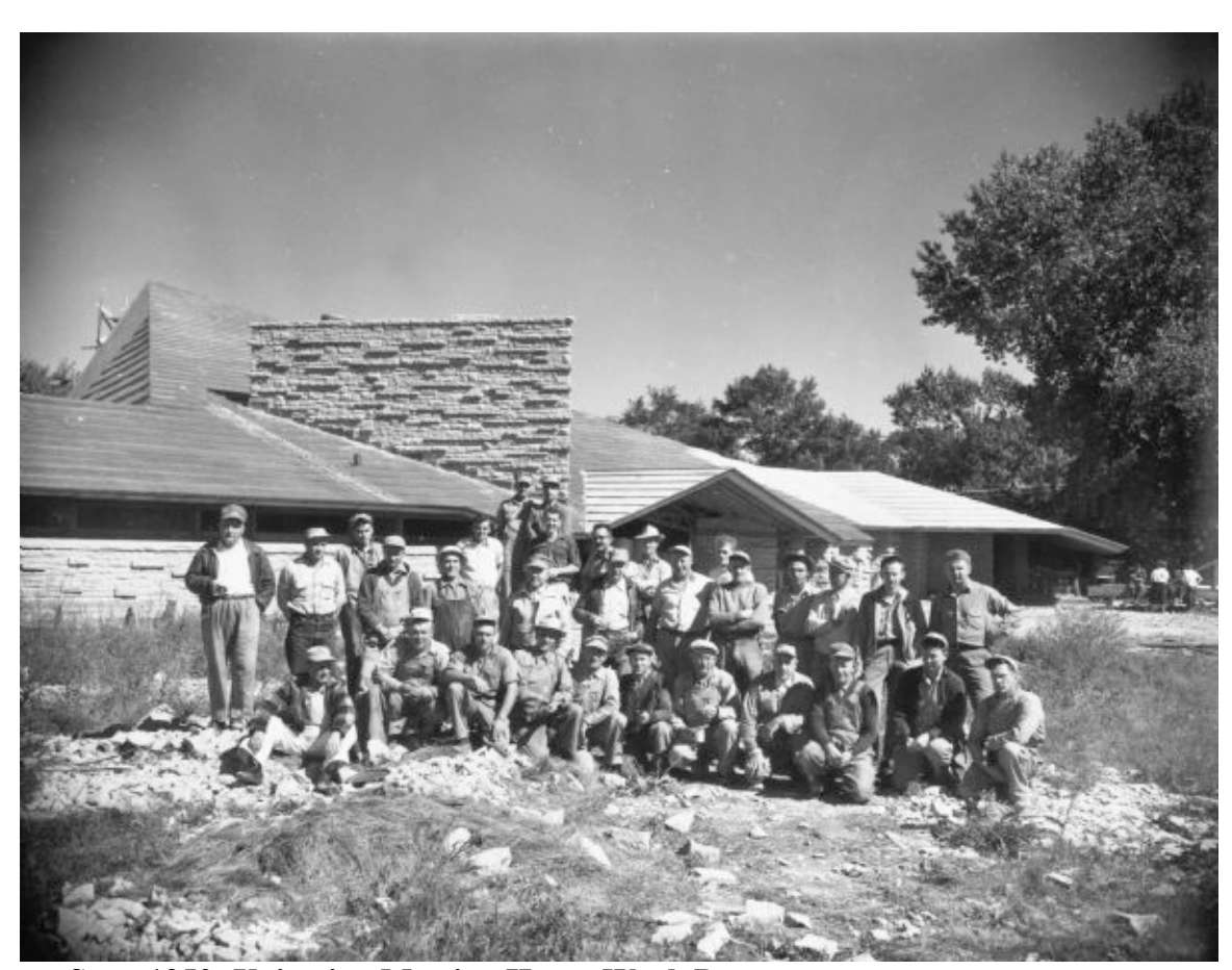
ca. Sept. 1950: Unitarian Meeting House Work Day. Image ID: WHi-26524