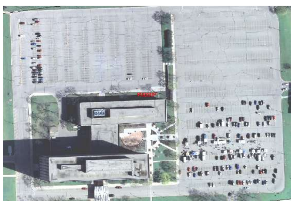
1% Landscaped Coverage within Interior of Parking Lot