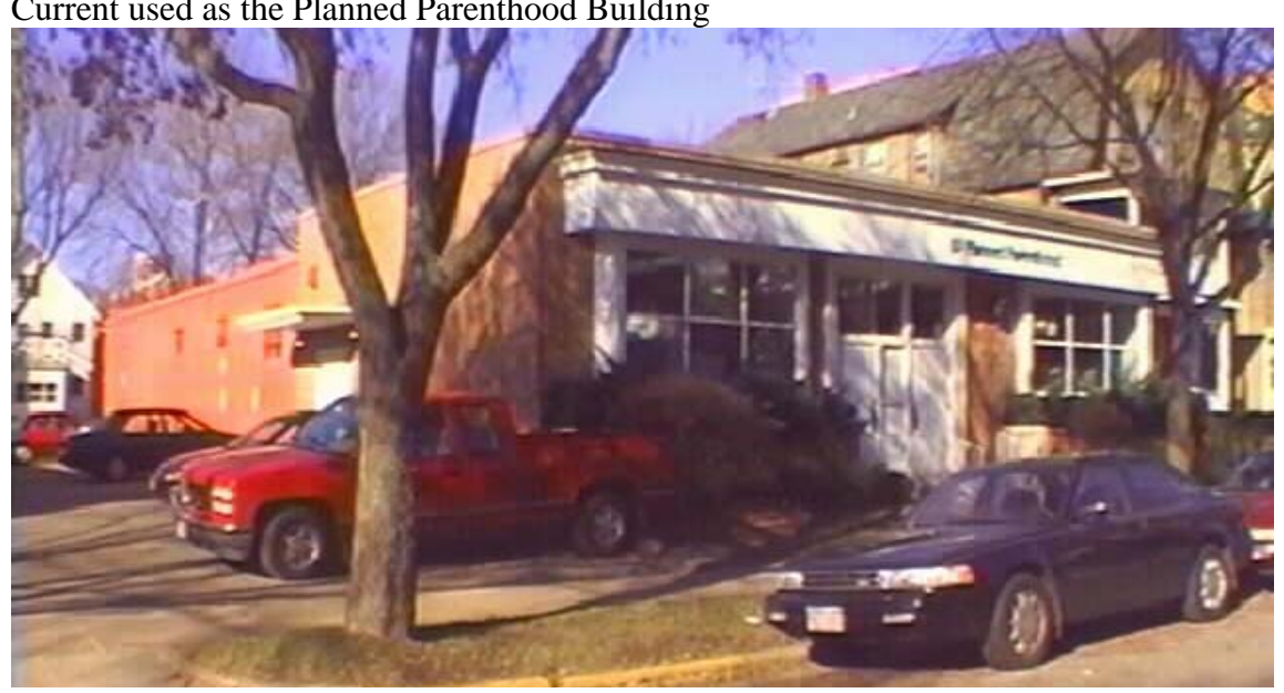
677 S Segoe Rd Madison, WI 53711 – Current Use: office building

416 W Mifflin St Madison, WI 53703 -- One story brick & concrete block office building. Current used as the Planned Parenthood Building