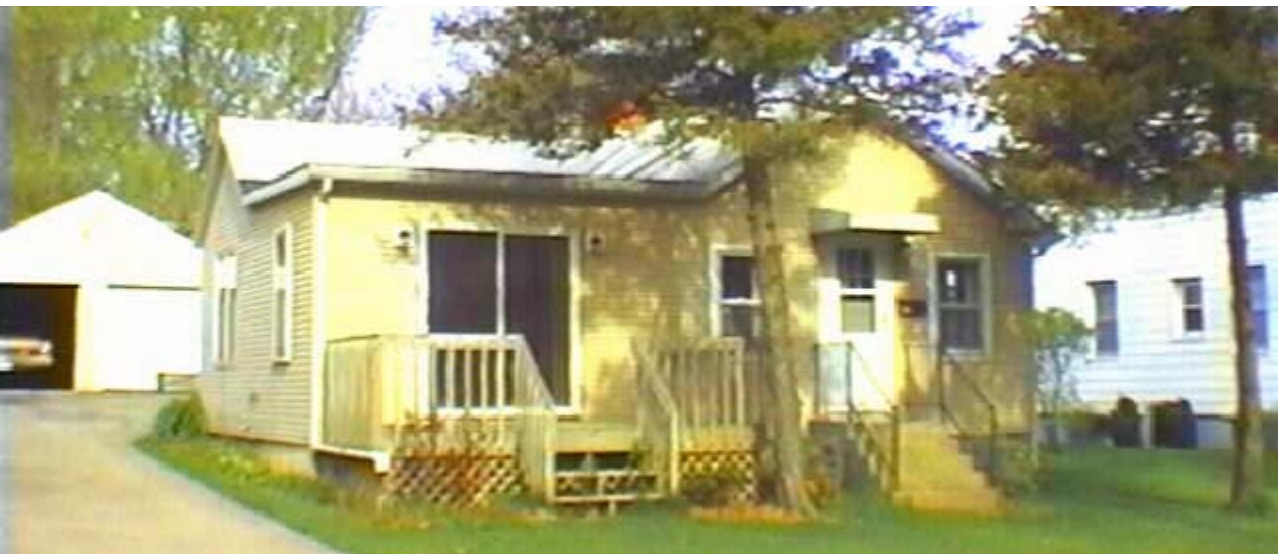
Applicant's Comments: This 2-bedroom house was built in 1930. No one has lived there for a while. It has been on the market for over 400 days. The owner would like to tear it down and build a 3-bedroom single-family house.