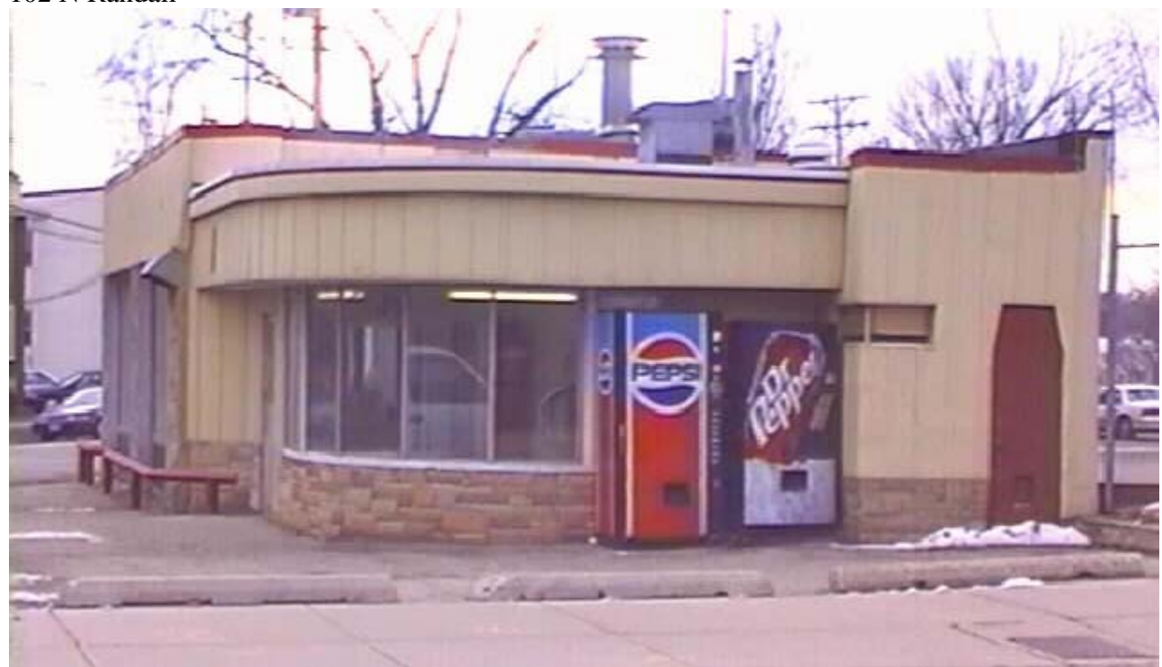
Commercial Building located at 102 N Randall Ave Madison, WI 53711 to be demolished to expand parking lot.