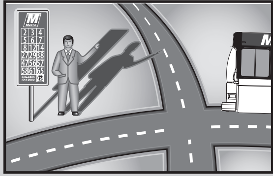
Wait at Sign! Bus stop is past the intersection—wait at sign.