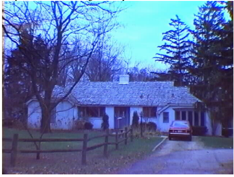
5210 Harbor Court, built in 1925 (Staff has no historic file for this house.)

Proposal: Demolish single-family residence to create open space for adjacent residential bldg.