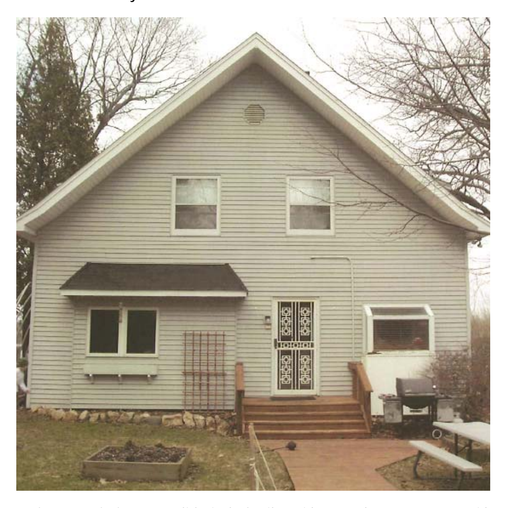
Project Description : Demolish single-family residence and construct new residence on lakefront