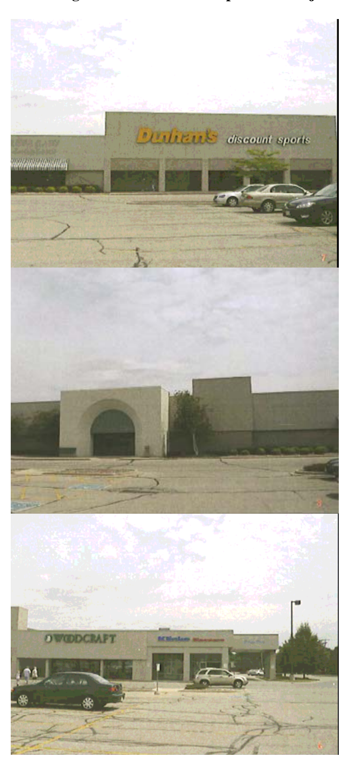
160 Westgate Mall: Dunham's Sports and adjacent tenants

Project Description: Demolish a potion of the mall, including several tenants and the larger Dunham's Sports space. The buildings will be replaced by a new stand alone Hy-Vee Grocery Store.