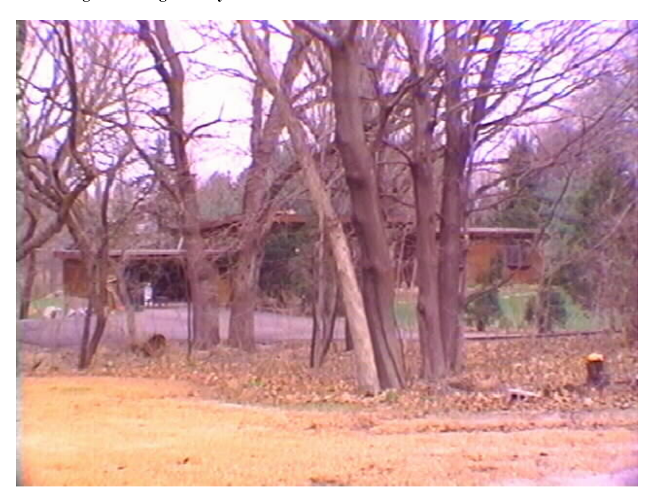
Project Description : Demolish Single-Family Home and Construct New Residence. No other information known at this time.