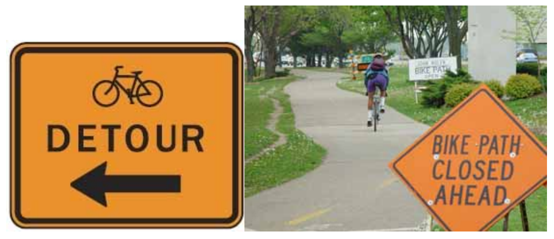
Bicycle Route Detour Sign.