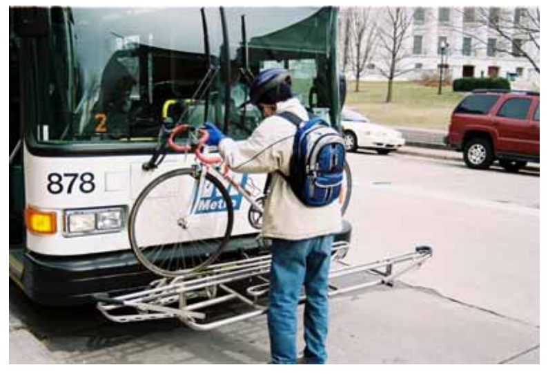
Bike Rack on Madison Metro Bus.