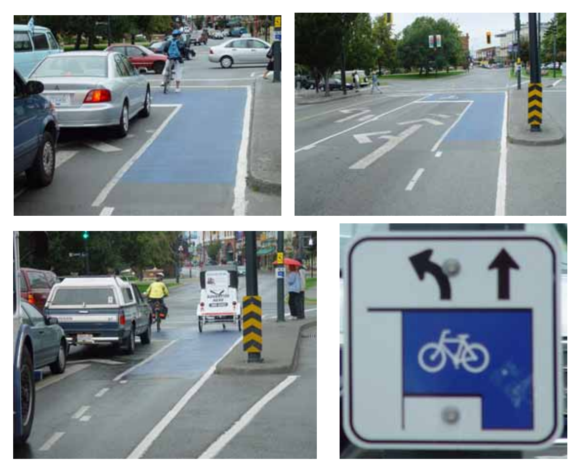
Bike Box, Victoria, BC.