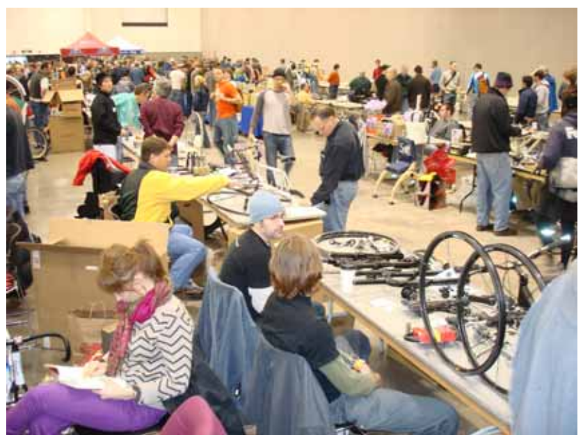
Cronometro's annual bike swap for the Brazen Dropouts Racing Club.