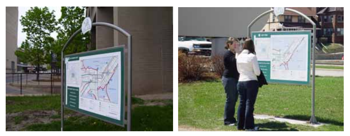
Wayfinding signs.