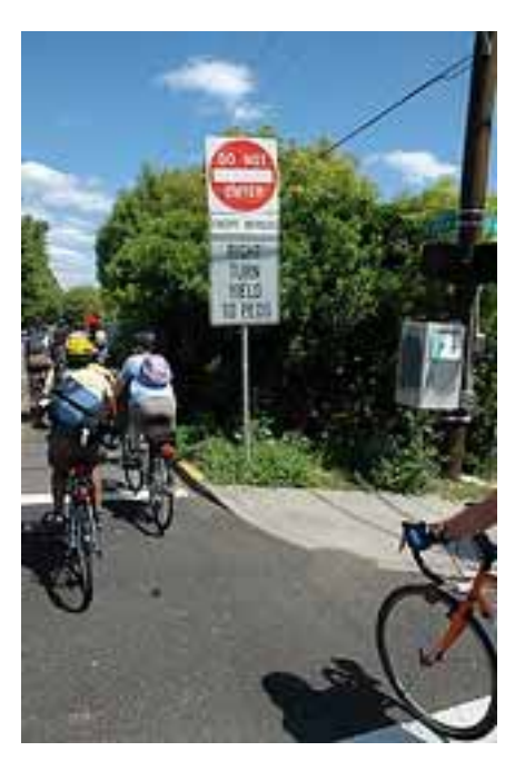
Bike Boulevard. Image: Portland