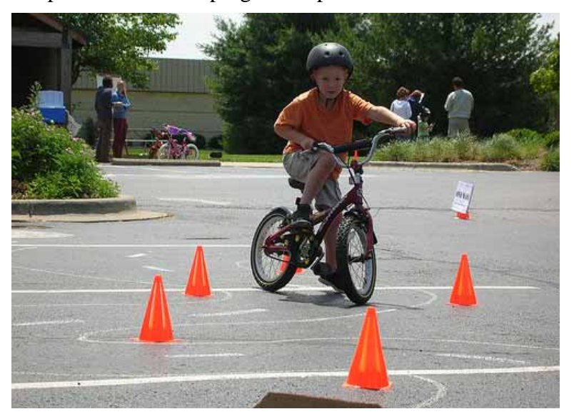
A child learns better bicycling techniques.

Resources: Depends on level of program implemented