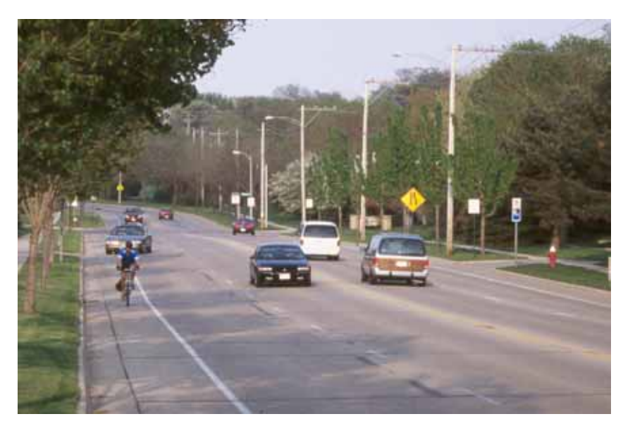
Bike lanes are a typical improvement for arterial streets.