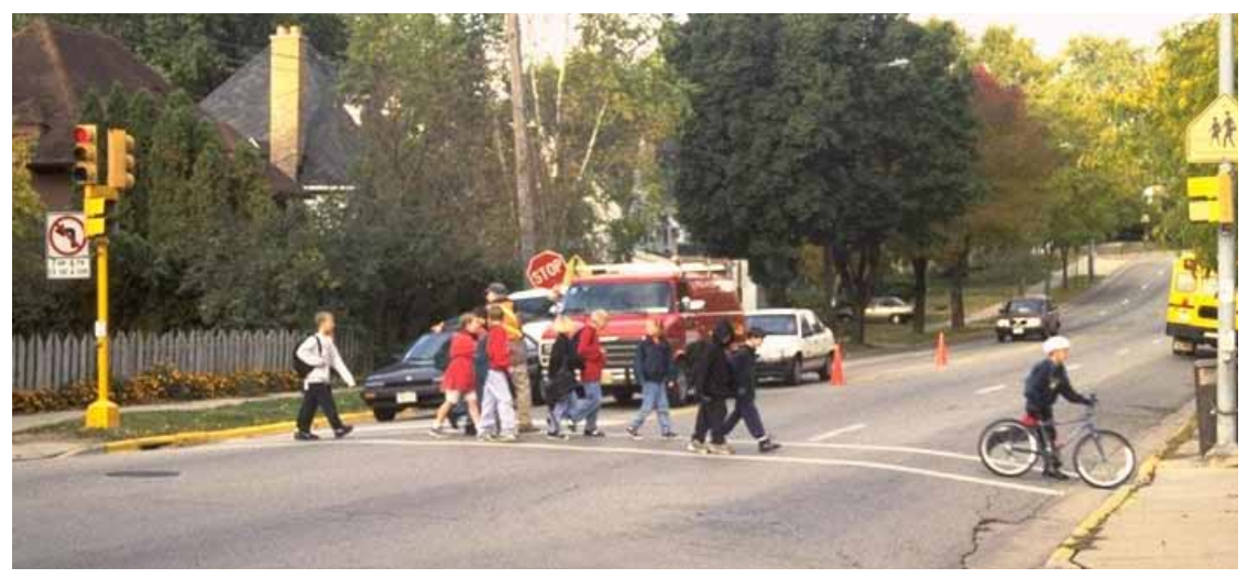
Kids heading to school.

Over the last several years an international movement has developed called Safe Routes to School, which seeks to improve children's ability to bike or walk to school by improving engineering, enforcement, education, encouragement, and evaluation. Though Safe Routes to School is a program or a combination of programs and policies that can be implemented, the Platinum Committee felt that it is also a theme that should be considered whenever improvements for bicycling and walking are discussed or made. All of the components of Safe Routes to School are incorporated in this report, though they are not always directly identified as such.