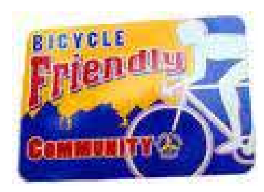
Example of Bicycle Friendly Community Sign.