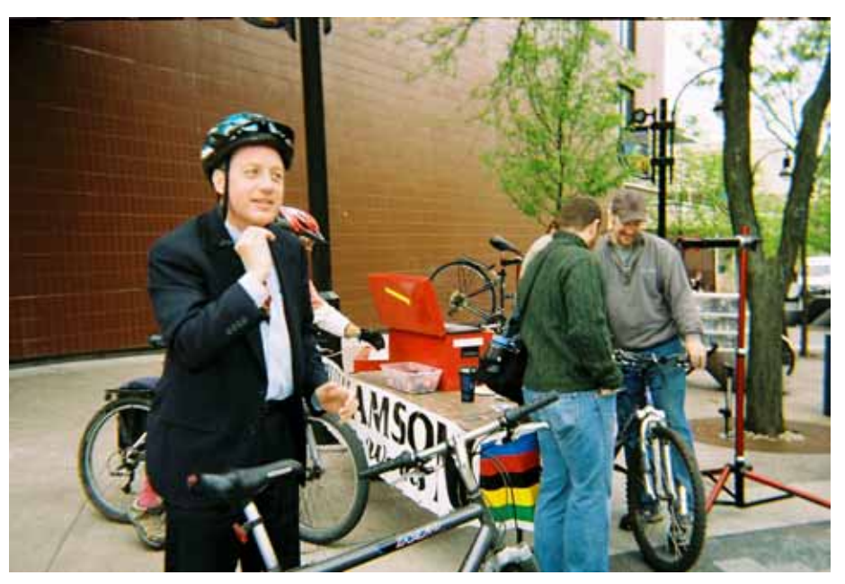
The Mayor arrives at Bike to Work Week press conference.