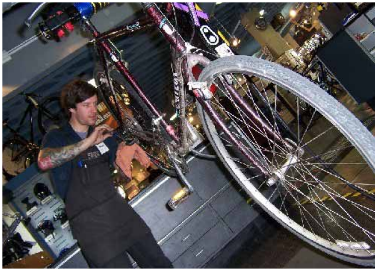
A mechanic at a Madison bike shop.