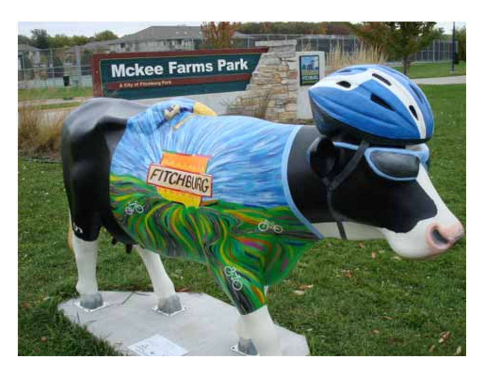
Fitchburg Bicycling Art Cow.

Finally, Madison is home to a significant percentage of the nation's bicycling industry. Improving bicycling conditions will increase the number of bicycle riders, and thus increase the direct and indirect positive economic impacts of the bicycling industry on the local economy.