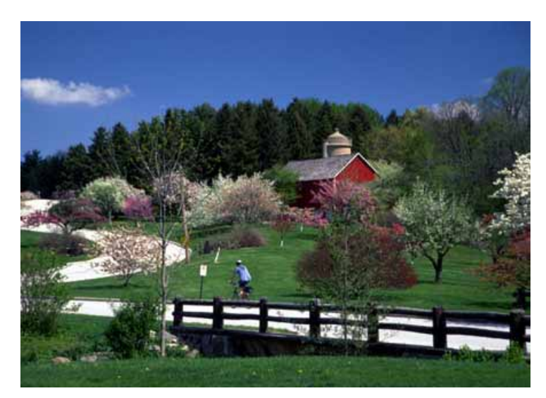
Rural Biking Scene.