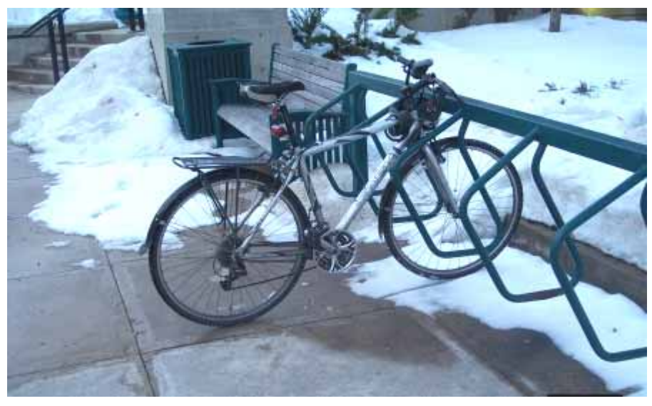
Bike Rack in Winter.