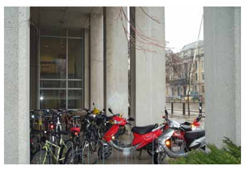
Mopeds parked at bike racks.