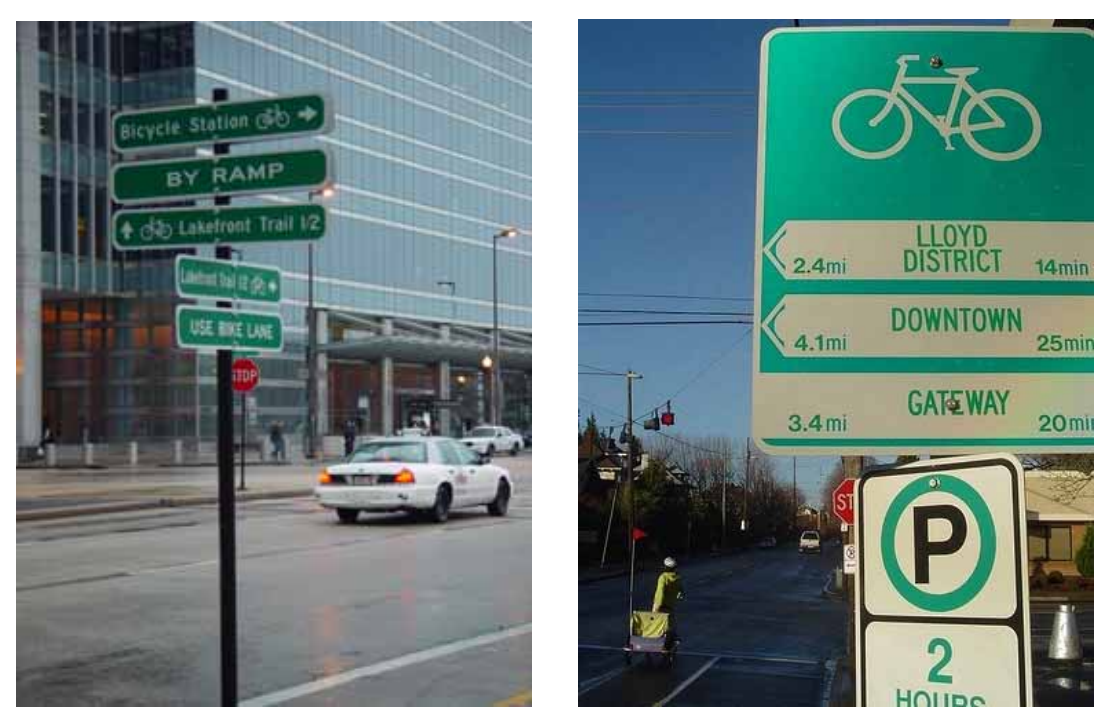
Examples of Destination Based Bike Network Signs (Chicago left, Portland right).