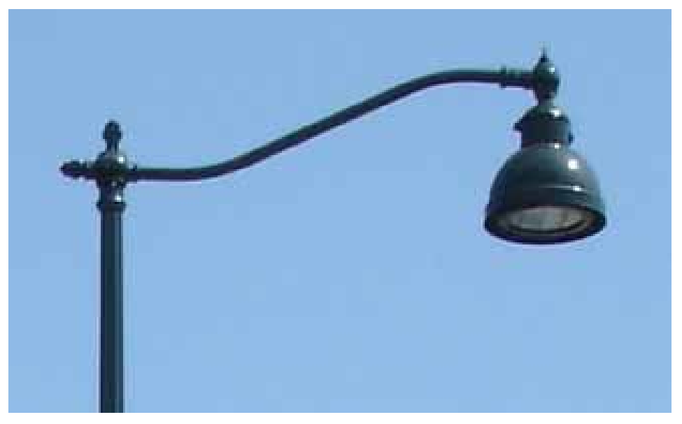
Cut off lighting on E Washington Avenue.

Resources: Staff time and cost of sign installation