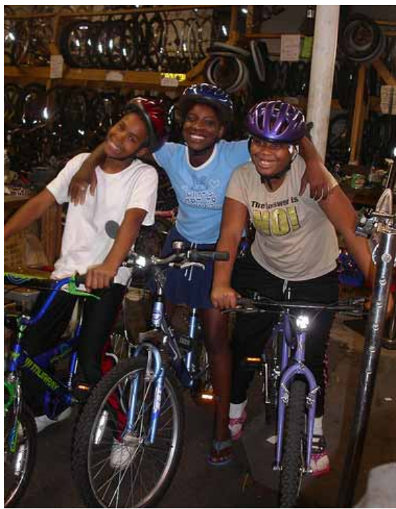
Some Madison girls pick up their Earn-a-Bikes.