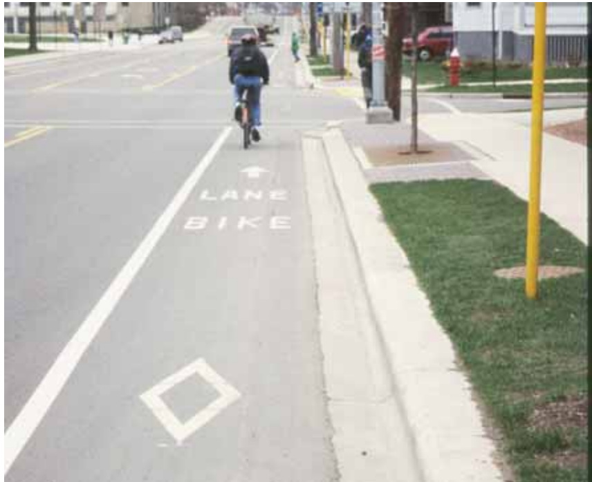
A complete street in Madison.

Madison has made many positive strides toward complete streets over the years, but now it is time to formalize the policy and implement it in a manner that will make our community a leader in the nation.