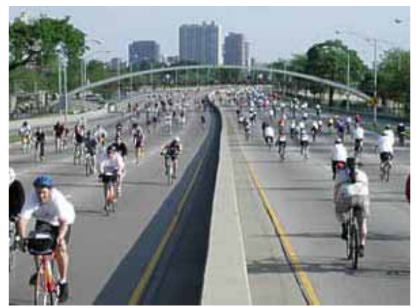
Bike the Drive in Chicago (an event similar to Sunday Parkways). Image: http://www.biketraffic.org/images/uploads/eventsmainpage.jpg

Resources: Staff, police time, and volunteers