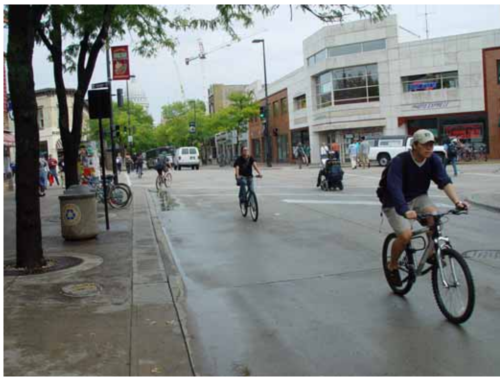
Madison's State Street, which is closed to through automobile traffic.

Madisonians enjoy and value a high quality of life. Better conditions for bicycling and walking have tangible and intangible benefits to the quality of life. In cities where people can regularly be seen out bicycling and walking, there is a palpable sense that these are safe and friendly places to live and visit. Bicyclists are an indicator of quality of life, the proverbial "canary in the coalmine." A contributing factor towards preserving and improving Madison's high quality of life is making the City even more friendly to bicycling.