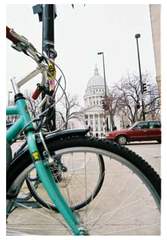
Bikes around the capital building..