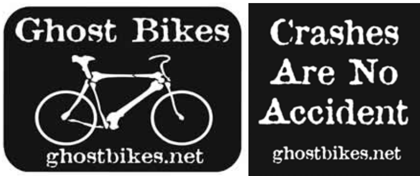
Ghostbike Project.