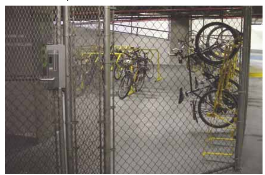
Bike Cage. Image: Arthur Ross