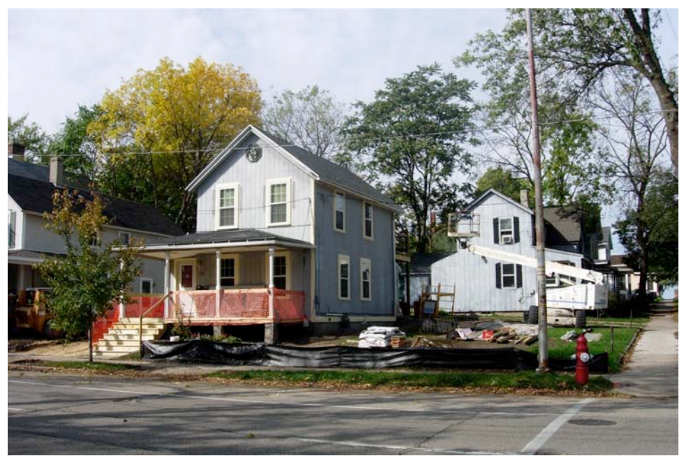
520 East Johnson from the South