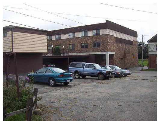
View from back of Knickerbocker Place looking Towards existing multifamily bldg and park.