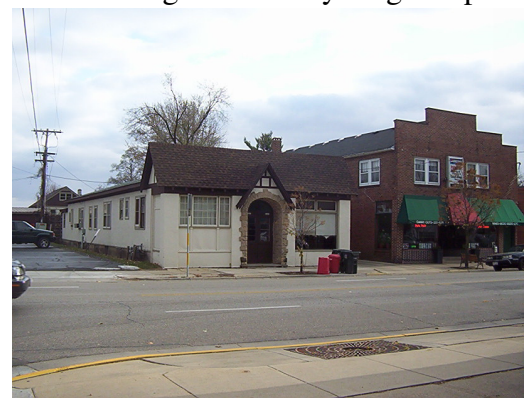
View of Papa Phil's Restaurant and a residential bldg.along Monroe St.