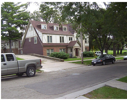
View from Knickerbocker St. to corner of Arbor Dr.