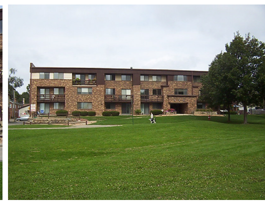
Views from park looking towards Arbor Drive.