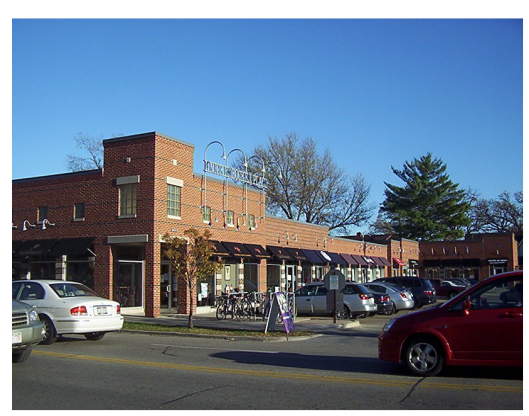
View of Knickerbocker Place along Monroe Street