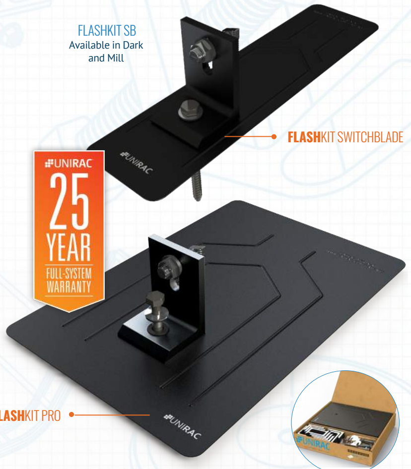
FLASHKIT SB Available in Dark and Mill