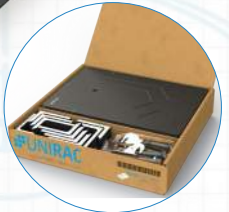
FLASHKIT PRO Available in Dark and Mill