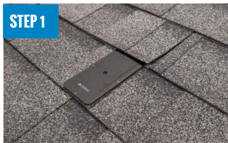
INSTALL FLASHKIT PRO SWITCHBLADE FLASHING

FLASHKIT PRO SWITCHBLADE IS THE COMPLETE FLASHING AND ATTACHMENT SOLUTION FOR COMPOSITION ROOFS.