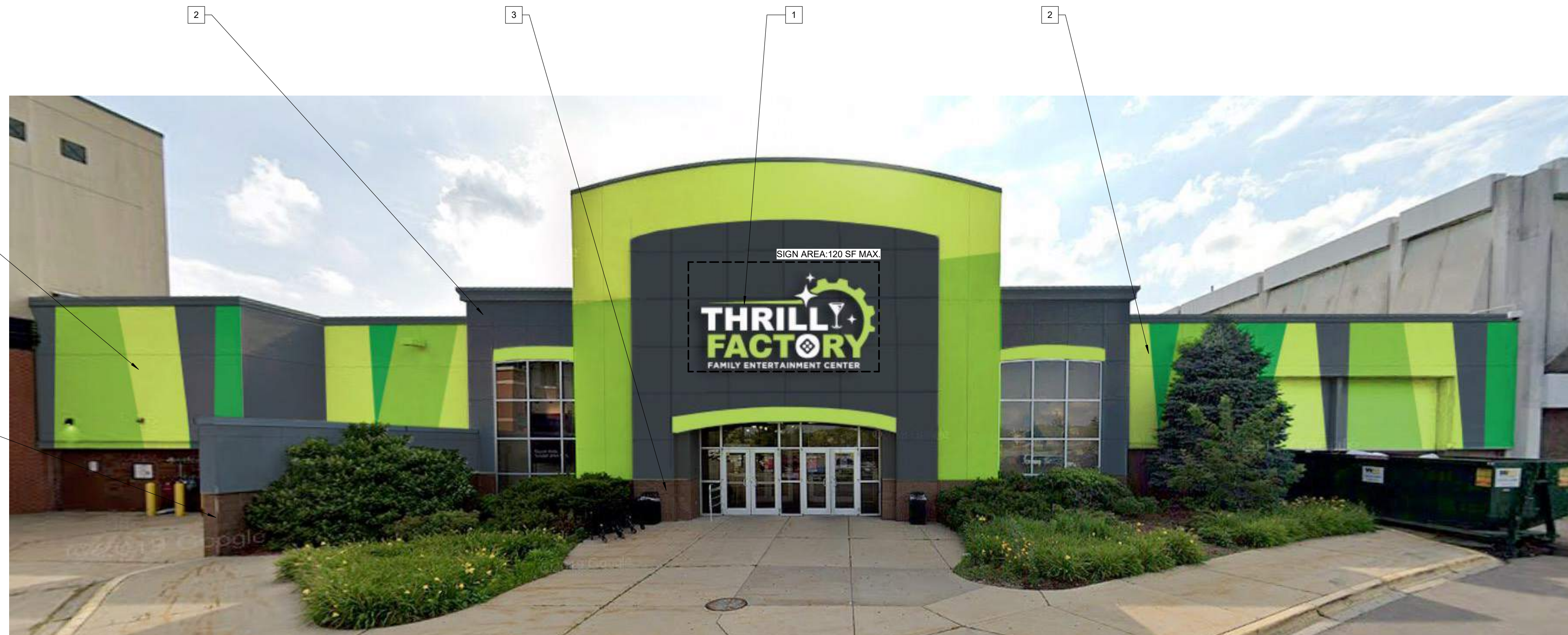
A1 NEW FRONT ELEVATION 3/8" = 1'-0"