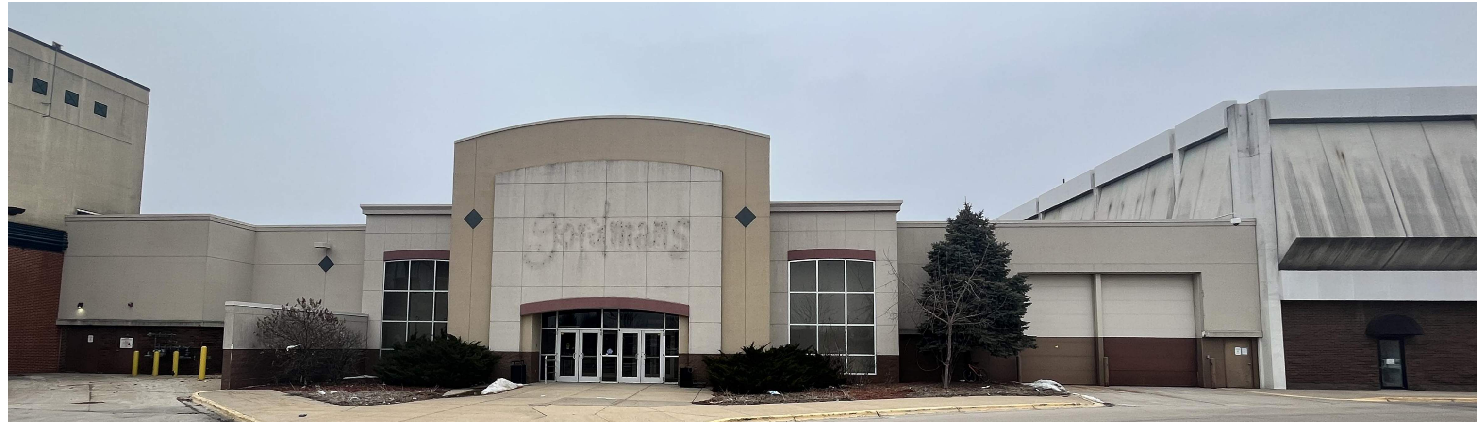
C1 EXISTING FRONT ELEVATION- FOR REFERENCE ONLY 1/4" = 1'-0"