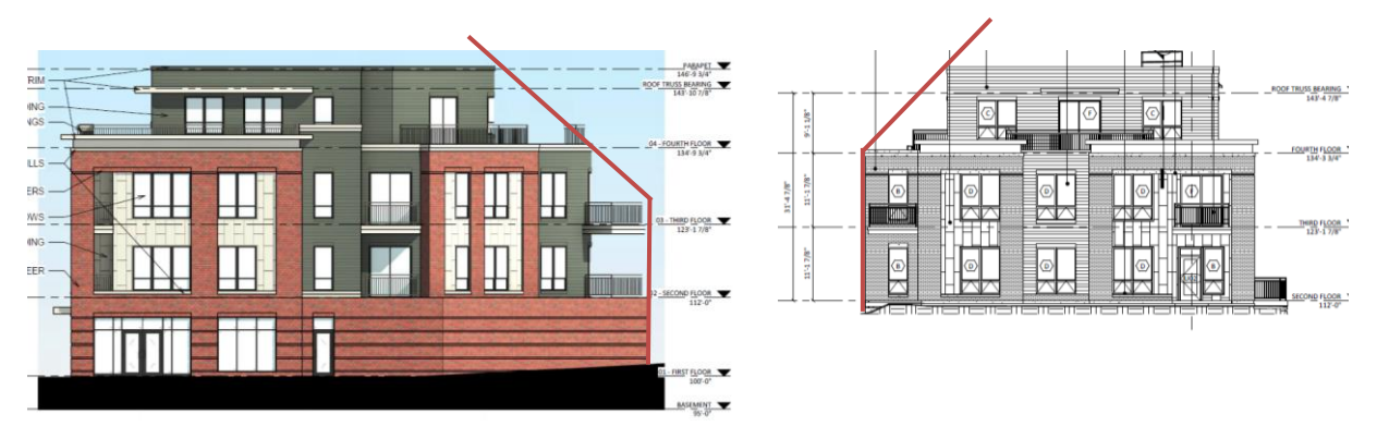
Image 2 – The Bulk Transition of the Proposed Building as seen on the Northeast Elevation (left) and West Elevation (right)

Based on the review by City Zoning, the current proposal would satisfy the side yard height transition to the residential district to the north, in this case the parcels located at 321 Glenway Street and 320 Waverly Place which are both zoned Traditional Residential – Consistent 2 (TR-C2) District and contain one- to one-and-a-half-story single-family residences. As MGO §28.064(3)(d) reads, "Where the NMX District abuts a residential district at the rear or side lot line, building height at the rear setback line (in this case, 6 feet) shall not exceed two (2) stories/twenty-five (25) feet. From this point, building height may increase at a ratio of one foot of rise to one foot of horizontal distance away from the property line, (a 45º angle) up to the maximum allowed height. Transitions exceeding this height and/or ratio limitation require conditional use." Examining the submitted elevations, both the west elevation as well as the northeast elevation show the building's compliance along the northern property line (see the transition requirement indicated by the red lines in the images below).