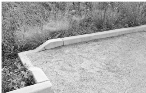
Figure I15: Interior Surface Parking Lot Landscaping Example.”