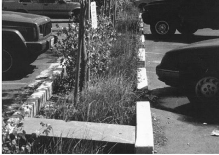
Figure I16: Interior Surface Parking Lot Landscaping Example.

Screening shall be provided along side and rear property boundaries between commercial, mixed-use or industrial districts and residential districts. Screening shall consist of a solid wall, solid fence, or hedge with year-round foliage, between six (6) and eight (8) feet in height, except that within the front yard setback area, screening shall not exceed four (4) feet in height. Height of screening shall be measured from natural or approved grade. Berms and retaining walls shall not be used to increase grade relative to screening height. For conditional uses, the Plan Commission may modify these requirements.”