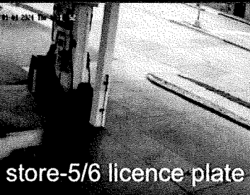
store-5/6 licence plate