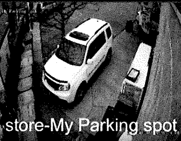
store-My Parking spot