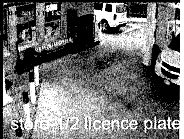
store-1/2 licence plate