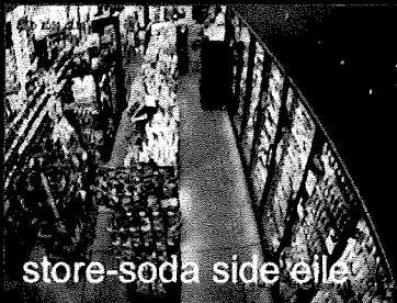
store-soda side eile