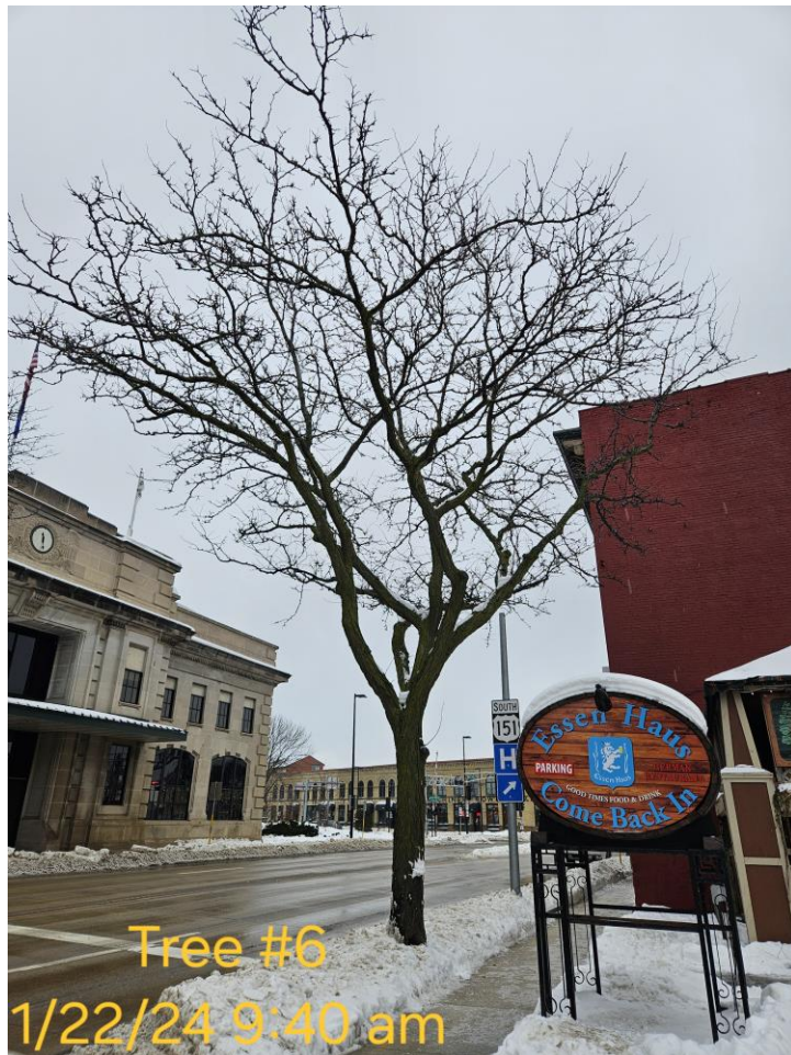
Tree #6 1/22/24 9:40 am