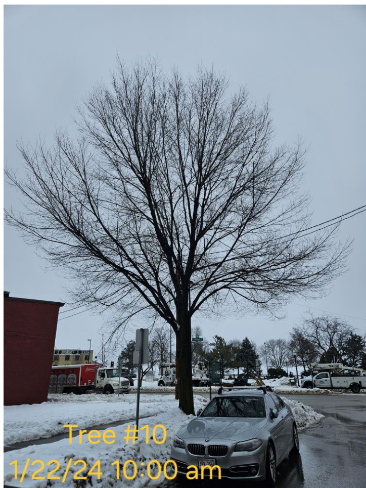
Tree #10 1/22/24 10:00 am