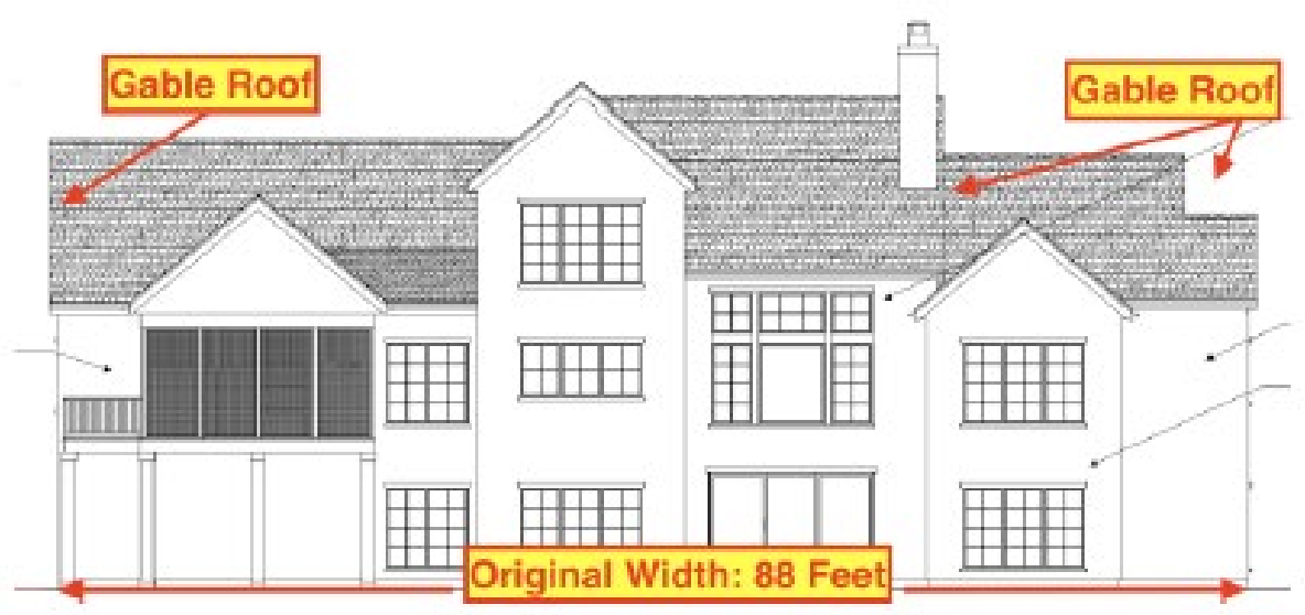
Original Design – East Elevation