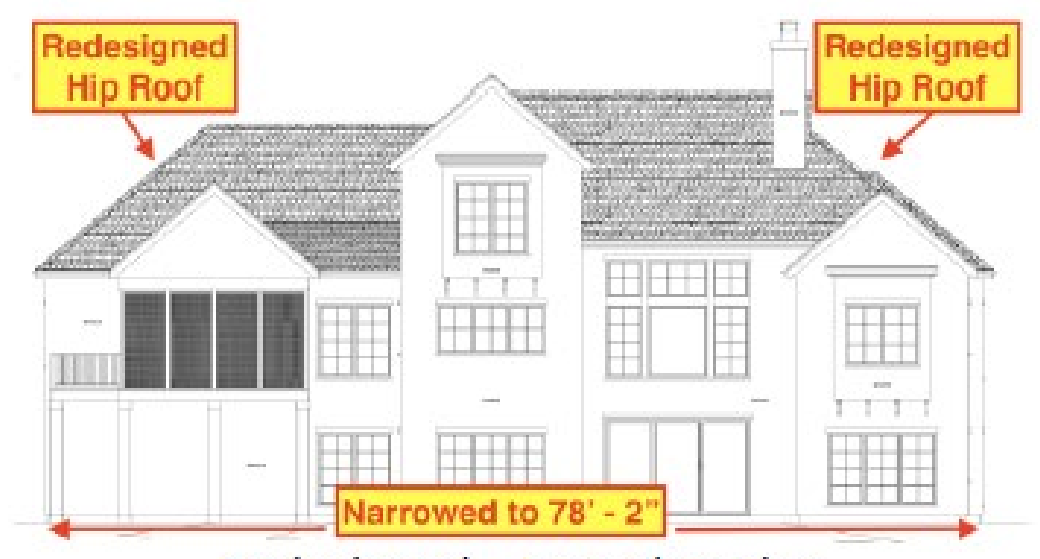
Redesigned - East Elevation