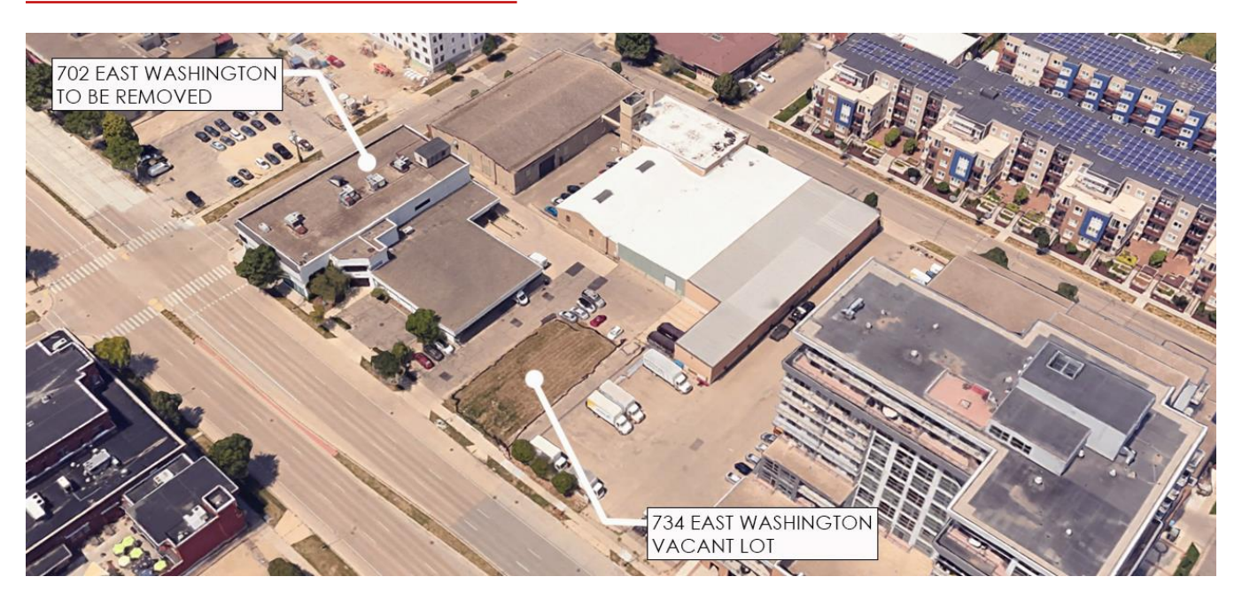
Aerial Image #1