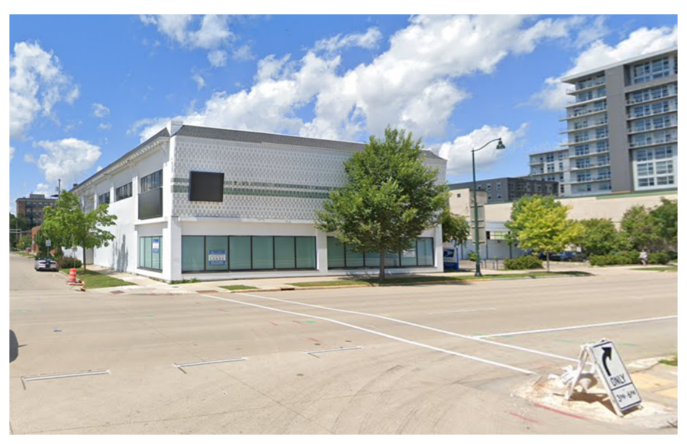
702 East Washington Avenue Corner of East Washington Avenue & North Blount Street