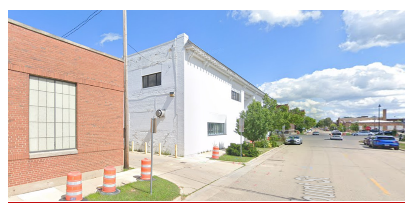
702 East Washington Avenue (White Building Only) Looking southwest down North Blount Street (curb-cut of shared driveway)