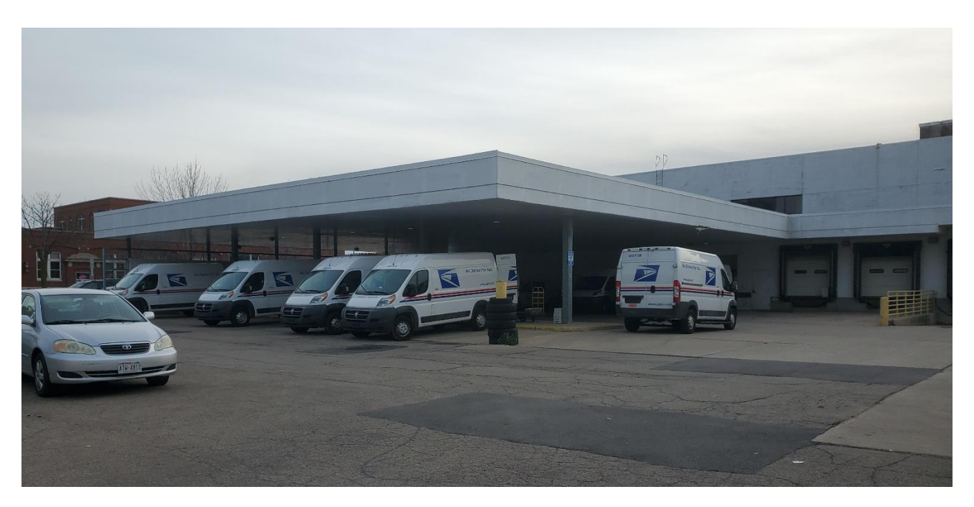
702 East Washington Avenue Vehicle canopy on southeast portion of parcel