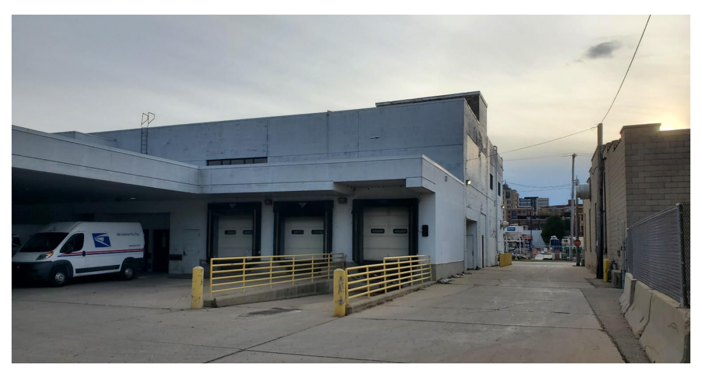
702 East Washington Avenue (White Building Only) Looking northwest down shared driveway. Vehicle canopy at left of photo.