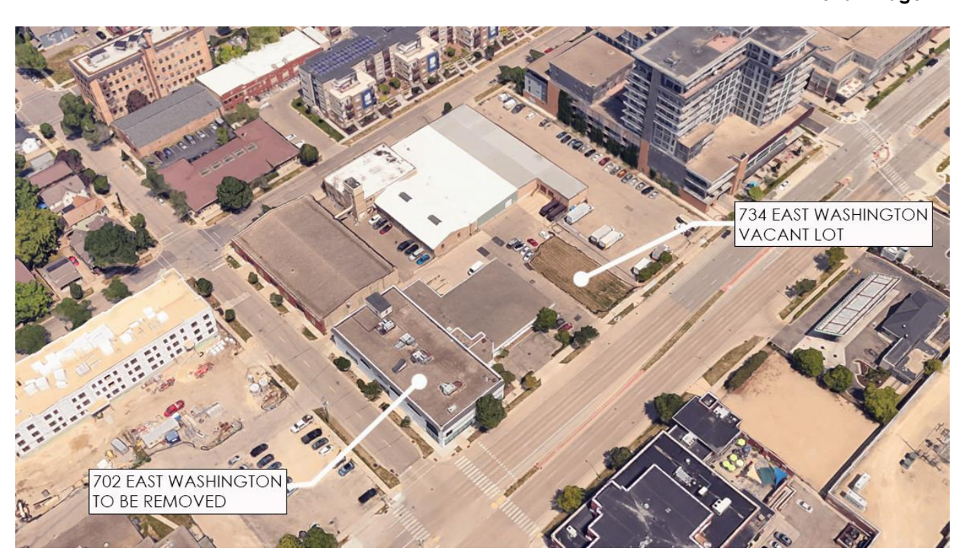
Aerial Image #2